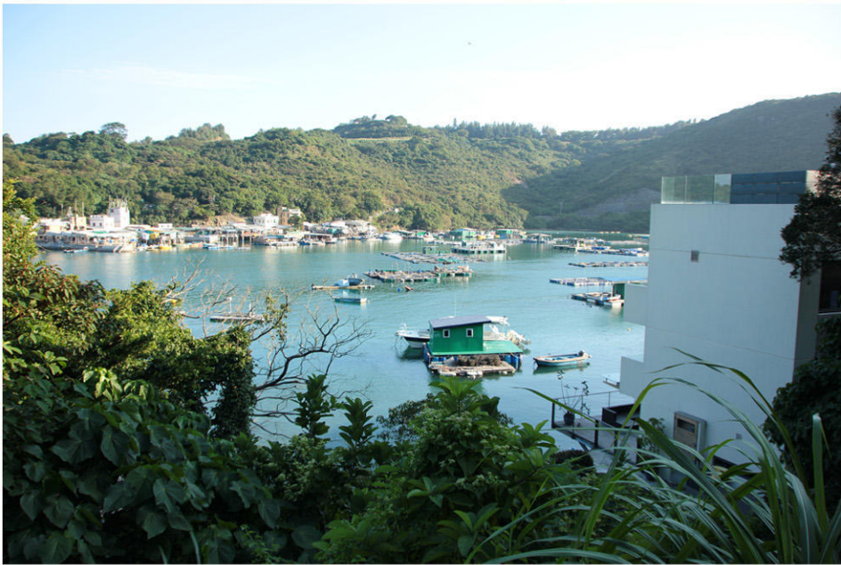
RES-2 RESIDENTS IN TAI WONG KUNG