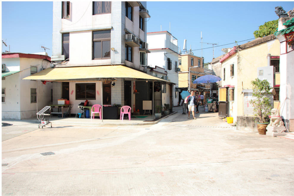
RES-1 RESIDENTS IN PO TOI O