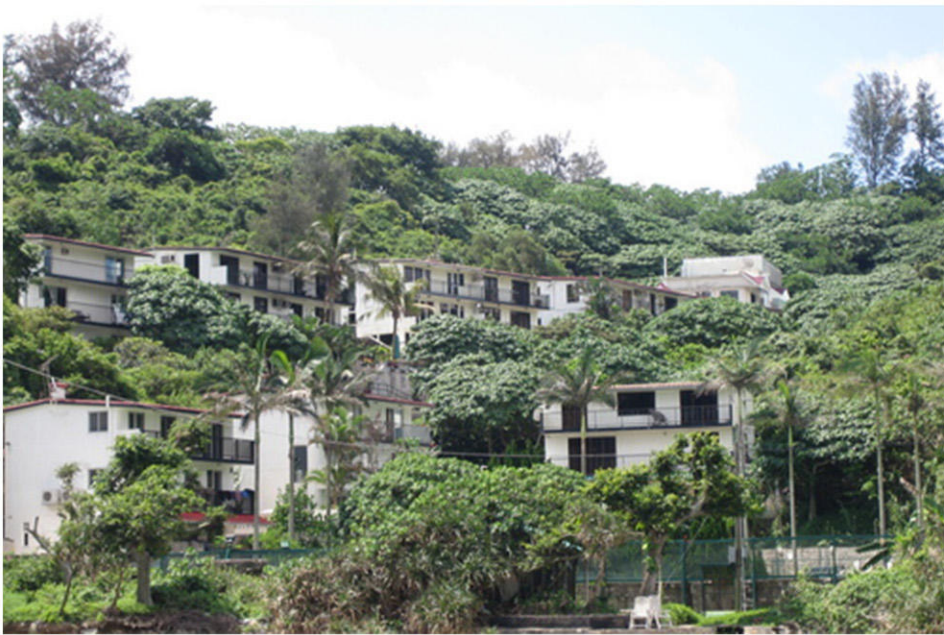
RES-4 RESIDENTS IN FAIRWAY VISTA