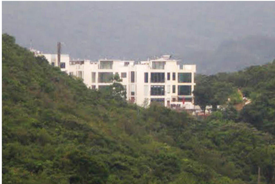
RES-3 RESIDENTS OF CALA D'OR