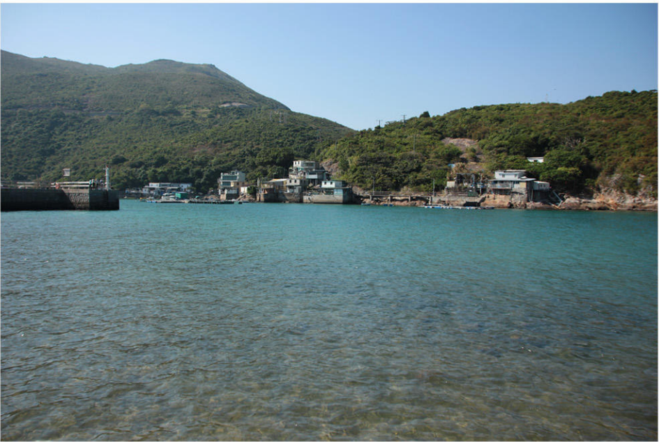
RES-2 VIEW OF TAI WONG KUNG LOOKING WEST