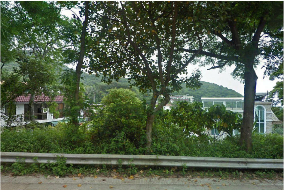
RES-5 RESIDENTS AT TAI AU MUN