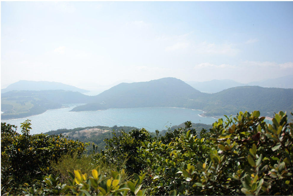
REC-4 VIEW SOUTH FROM TAI LENG TUNG HIKING TRAIL