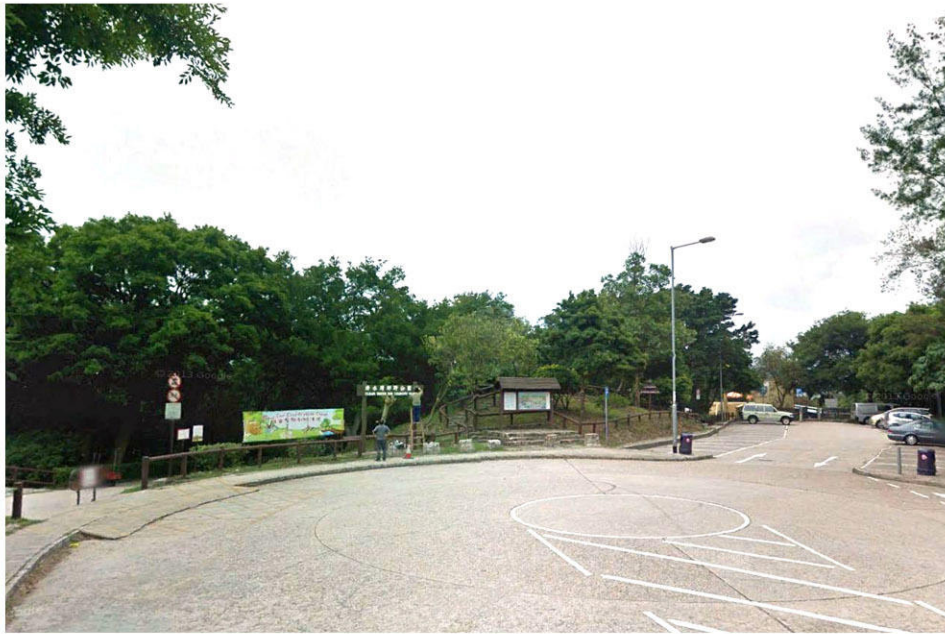
REC-3 VISITORS TO CLEAR WATER BAY COUNTRY PARK VISITOR CENTRE