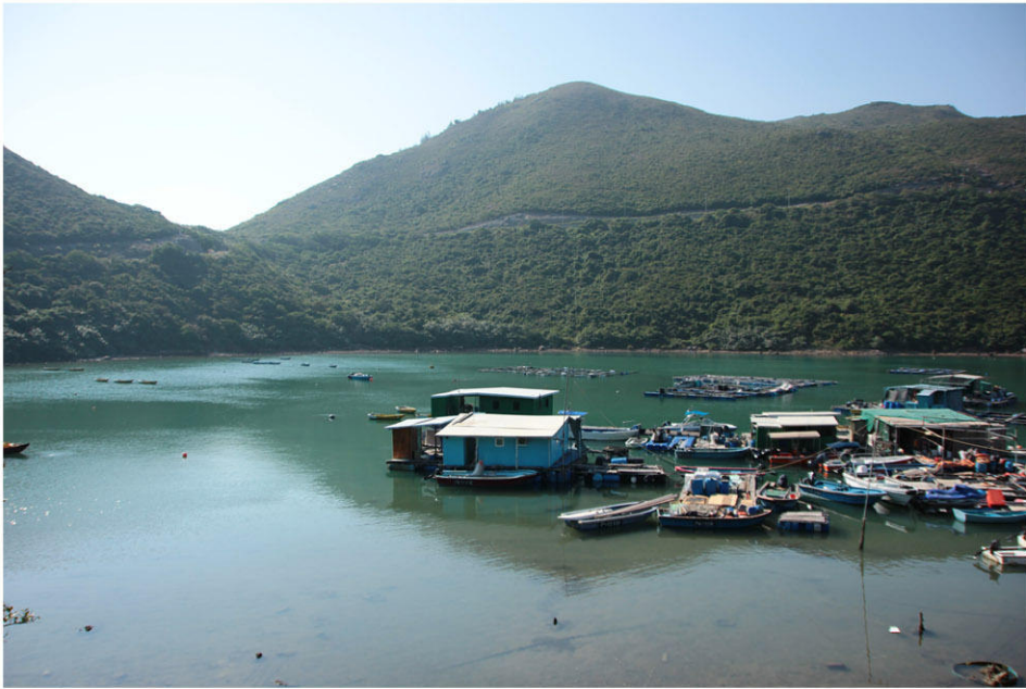
REC-1 VIEW OF TIN HA SHAN FROM THE SOUTH EAST