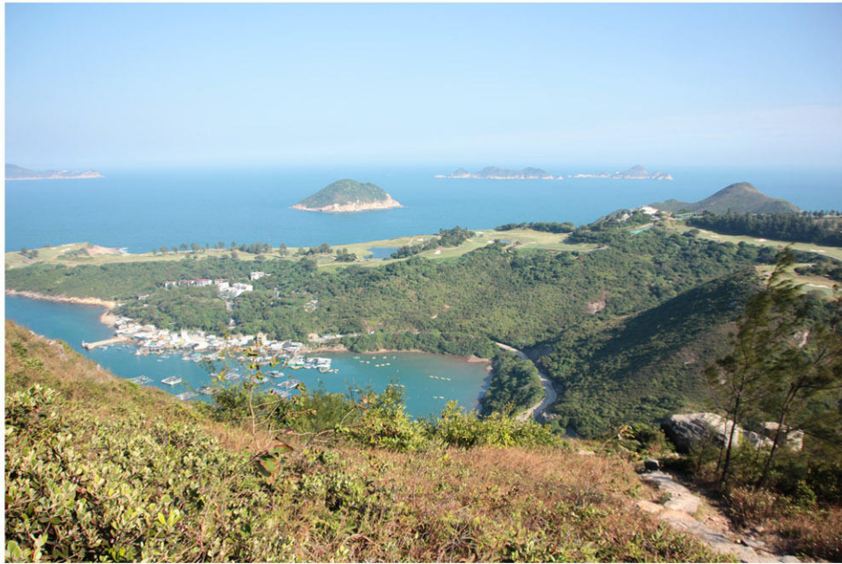
REC-1 VIEW FROM TIN HA SHAN HIKING TRAIL