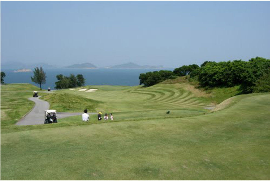
REC-2 PLAYERS ON THE CLEAR WATER BAY GOLF COURSE