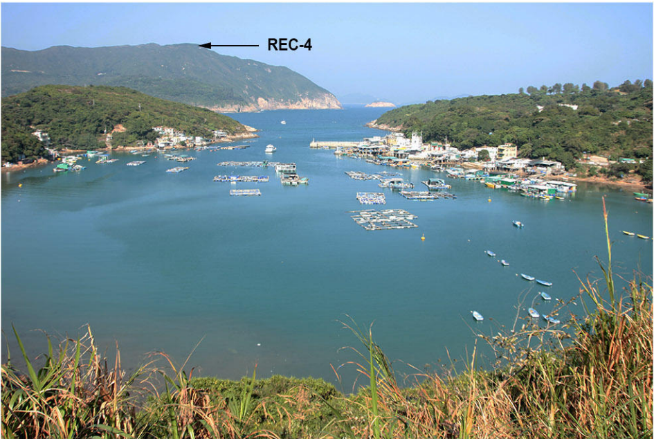
REC-4 HIKERS ON TAI LENG TUNG