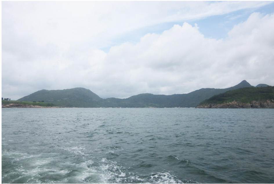
REC-5 VIEW WEST FROM RECREATIONAL CRAFT IN CLEAR WATER BAY