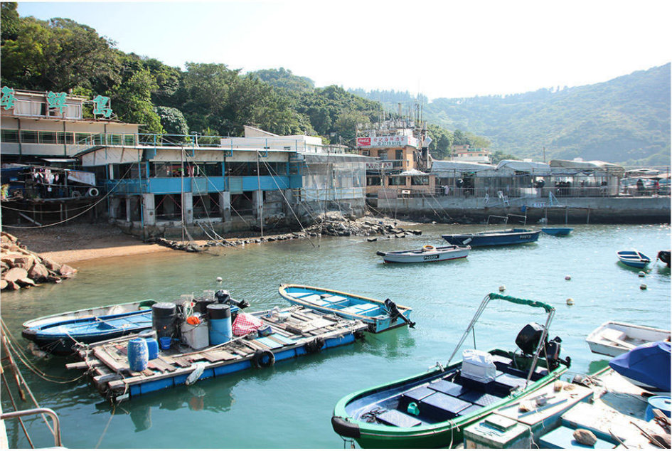
REC-6 VIEW OF SEAFOOD RESTAURANTS IN PO TOI O