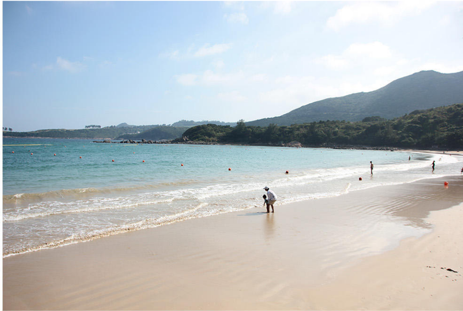
REC-9 USERS OF CLEAR WATER BAY SECOND BEACH