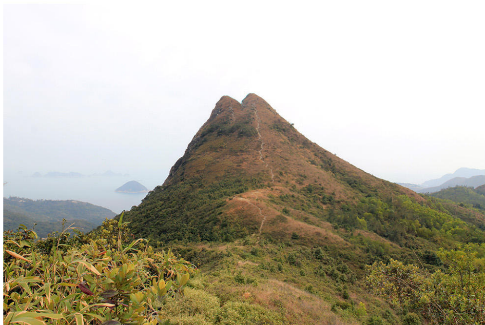
REC-7 VIEW OF HIGH JUNK PEAK FROM THE NORTH WEST