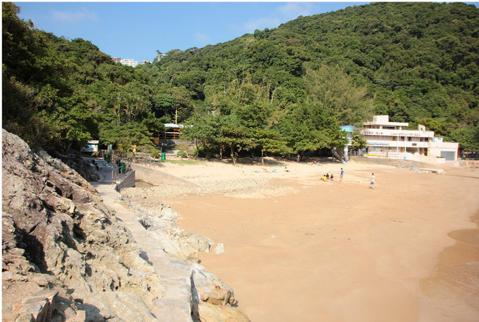
REC-8 USERS OF CLEAR WATER BAY FIRST BEACH