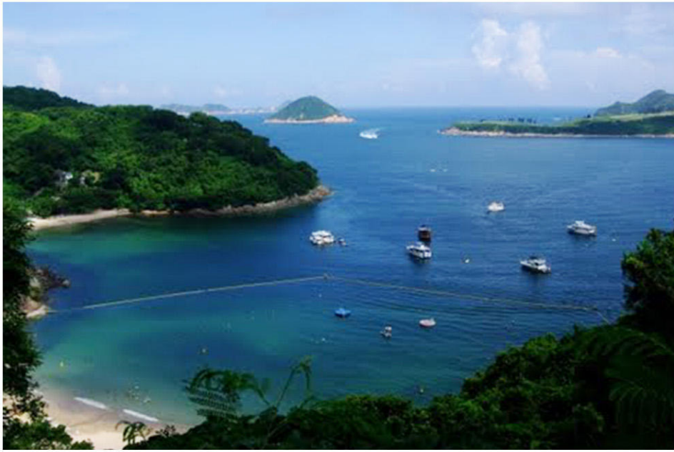
REC-5 RECREATIONAL CRAFT IN CLEAR WATER BAY