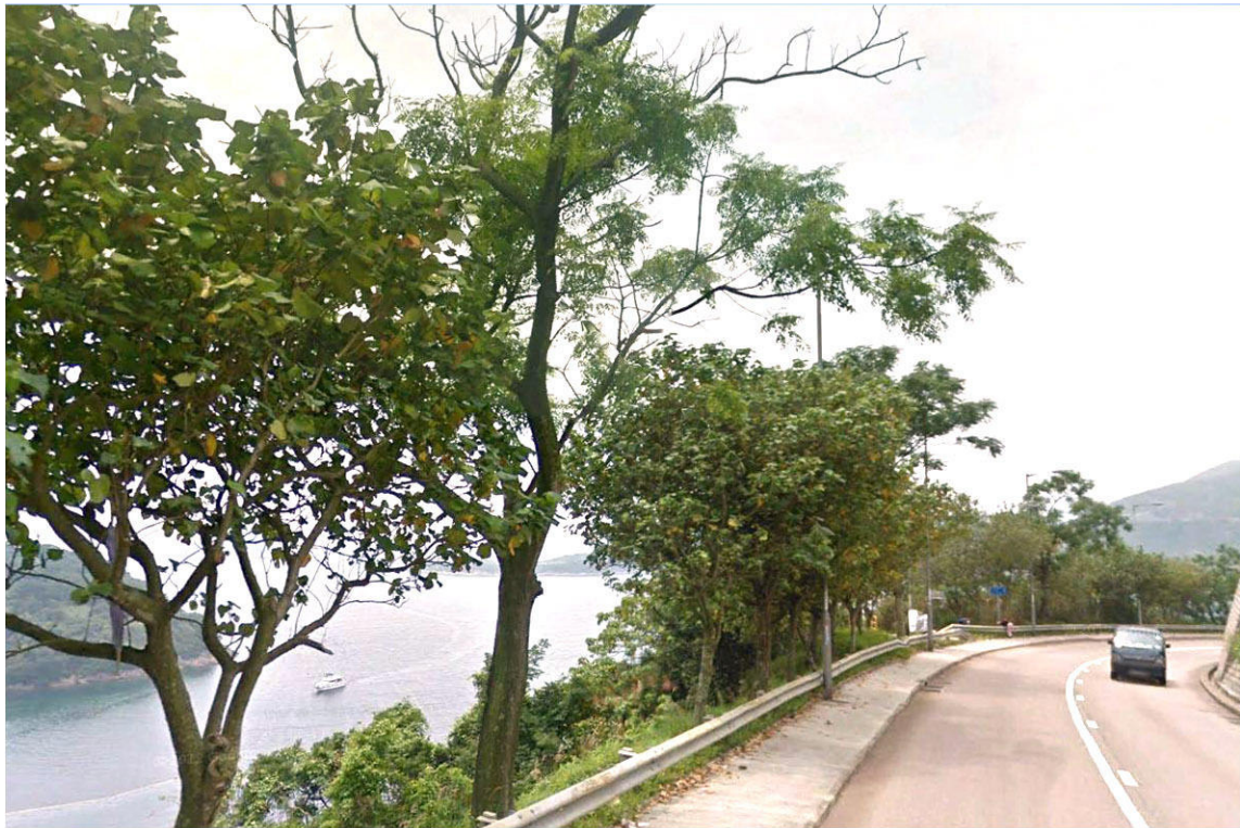
T-1b DRIVERS AND PASSENGERS ALONG TAI AU MUN ROAD