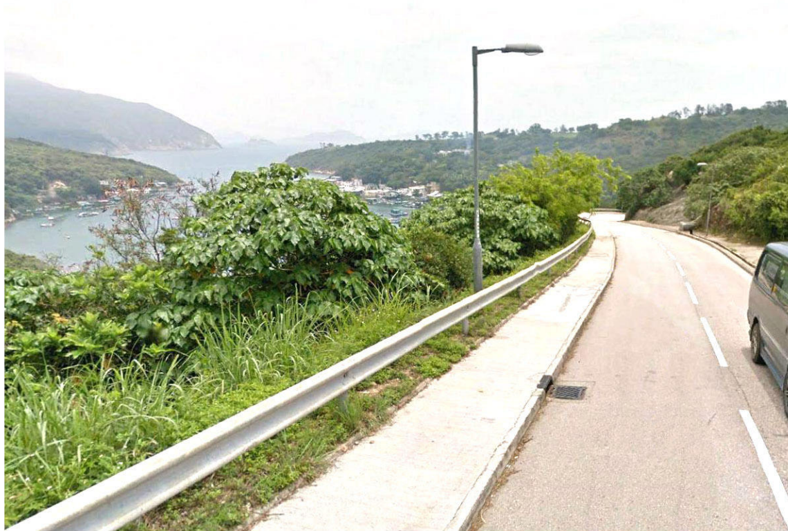
T-2 DRIVERS AND PASSENGERS ALONG POI TO O CHUEN ROAD