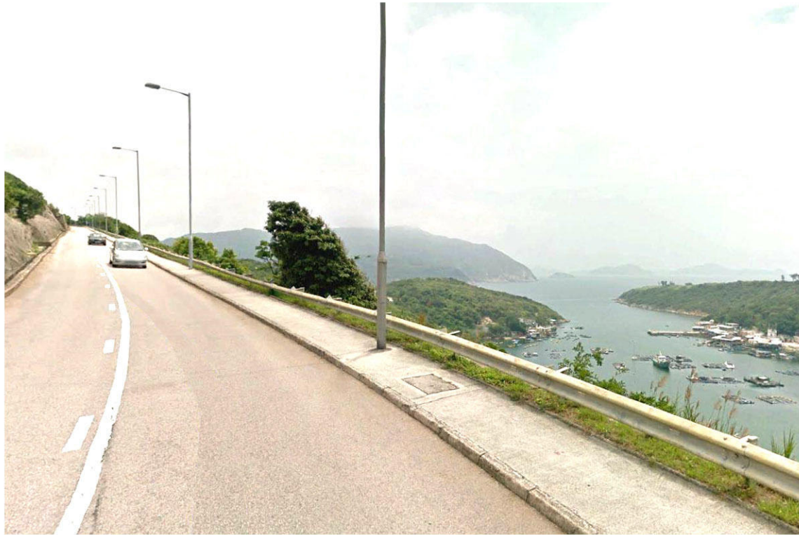
T-1a DRIVERS AND PASSENGERS ALONG TAI AU MUN ROAD