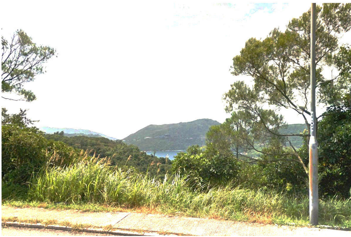
T-3 VIEW FROM CLEAR WATER BAY ROAD LOOKING SOUTH