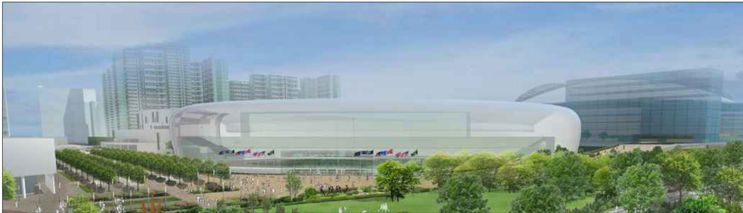
1: West Elevation of Public Sports Ground