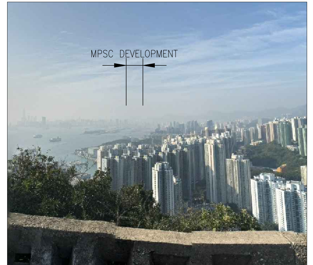
S-06: DEVIL'S PARK