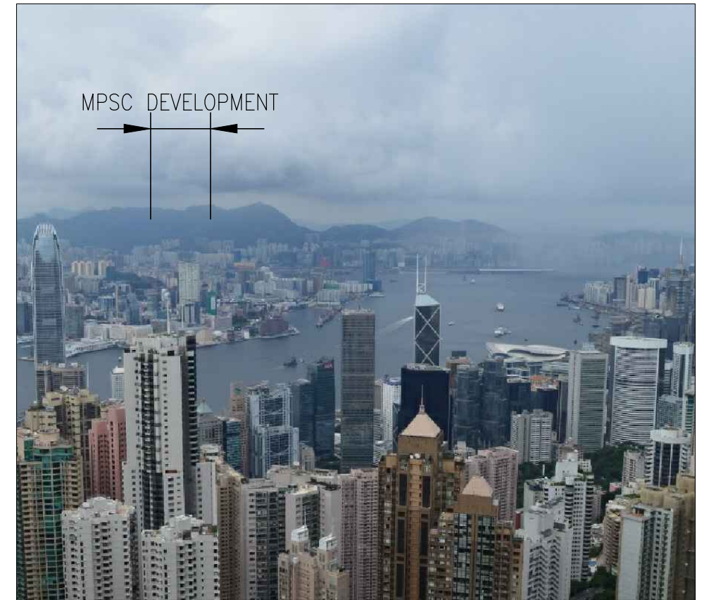
S-03: THE PEAK (VP7)