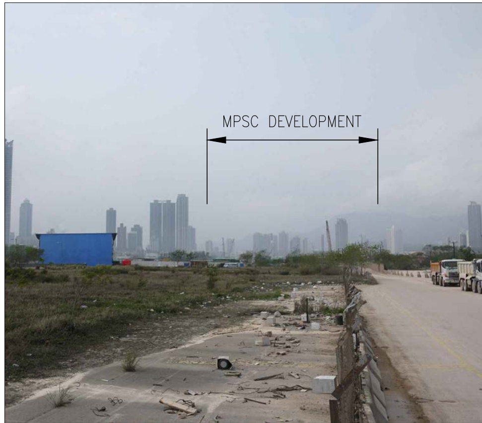
S-01: PROPOSED PROMENADE, SOUTH EAST KOWLOON DEVELOPMENT (VP3)