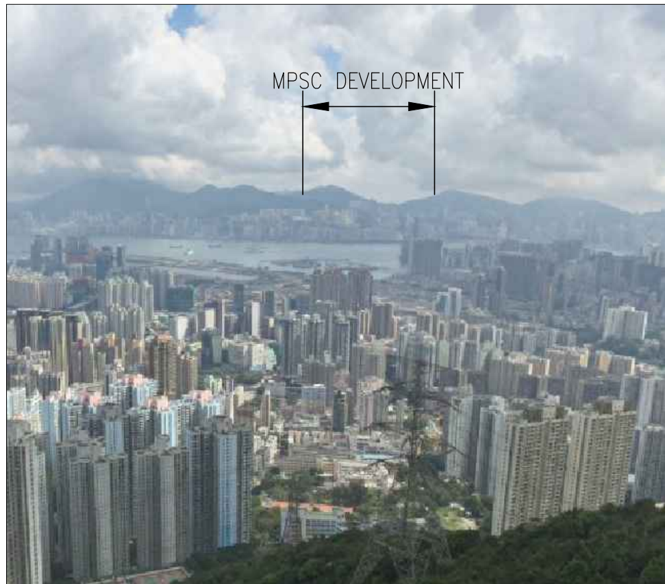
S-04: LION ROCK