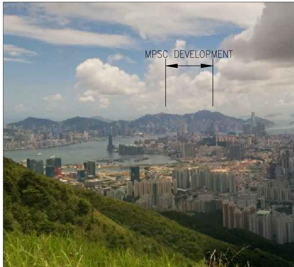
S-05: KOWLOON PEAK