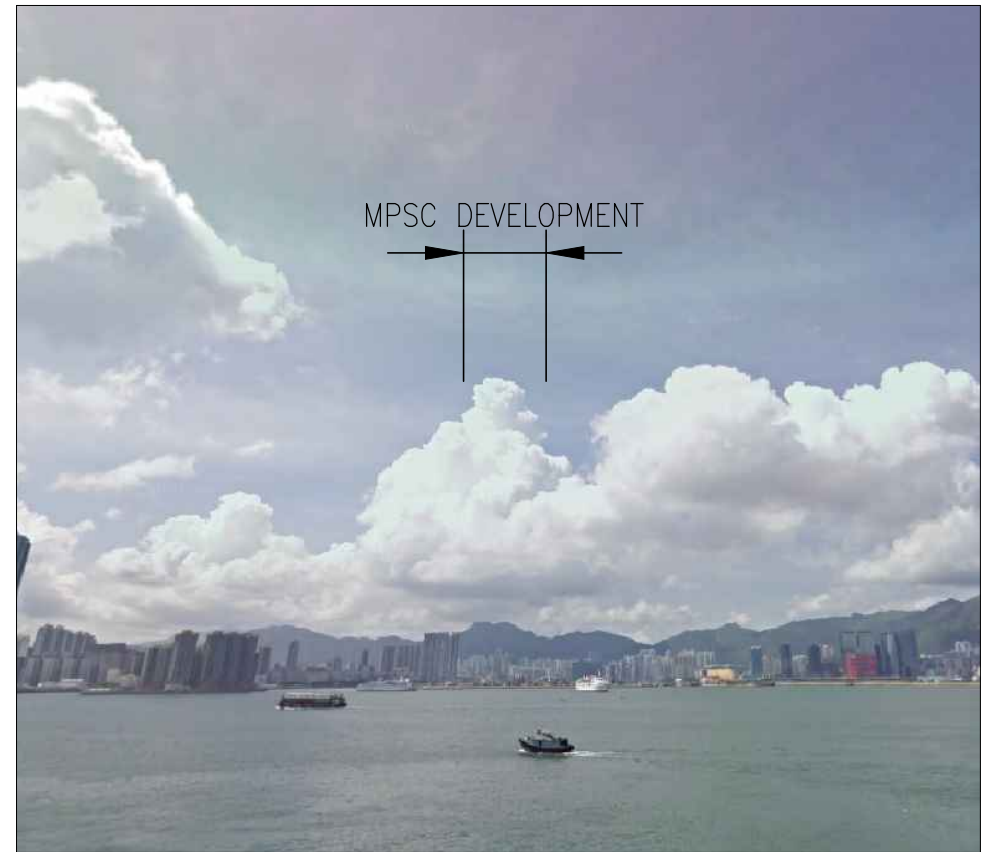
S-09: NORTH POINT PIER