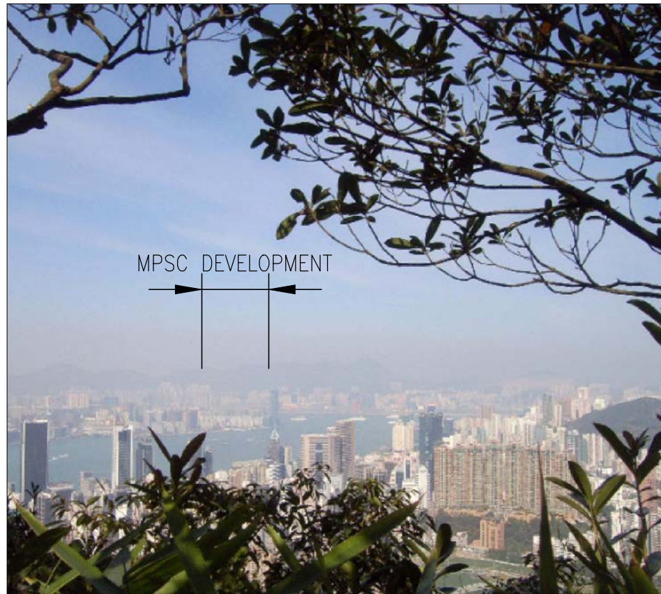
S-08: MOUNT CAMERON