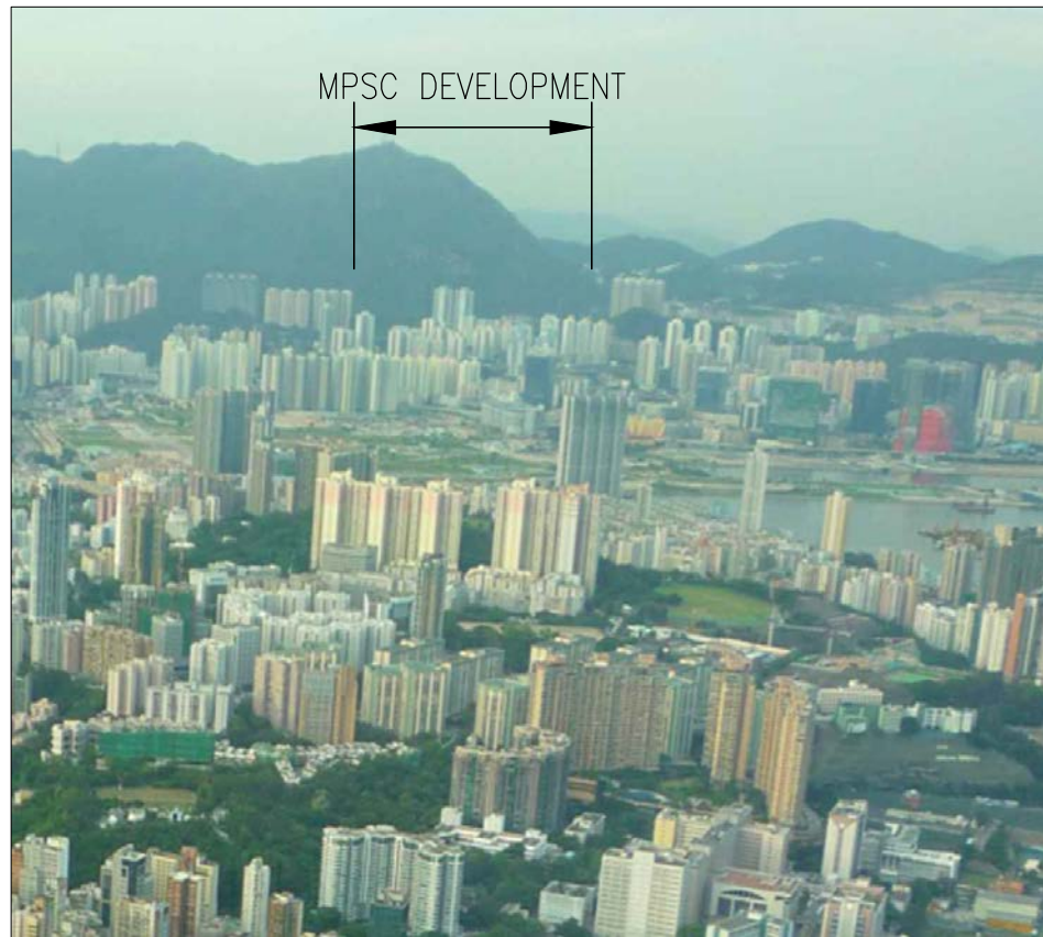
S-11: INTERNATIONAL COMMERCE CENTER