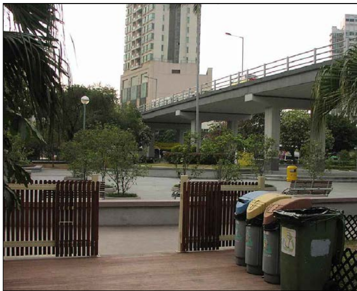
LR2-4: OLYMPIC GARDEN