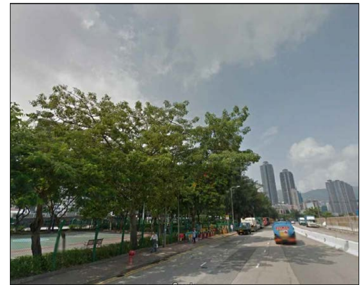
LR2-6: SUNG WONG TOI PLAYGROUND