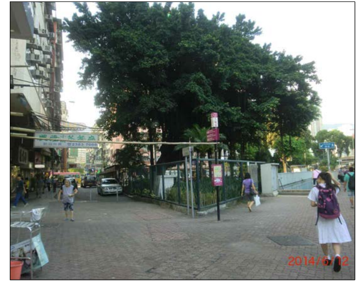
LR2-3: TAK KU LING ROAD REST GARDEN