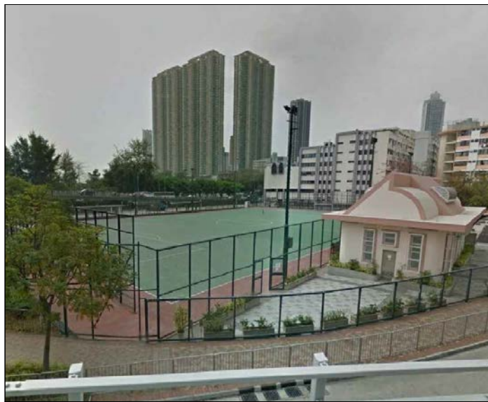
LR2-5: ARGYLE STREET PLAYGROUND