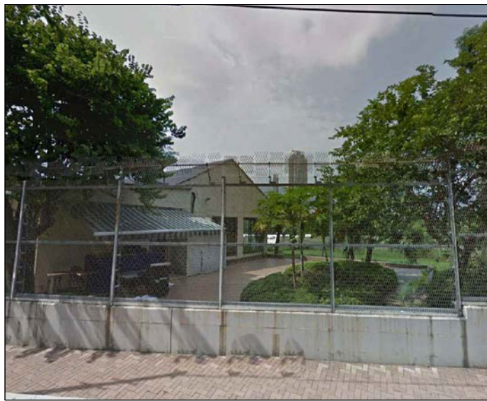
LR2-8: HONG KONG AVIATION CLUB