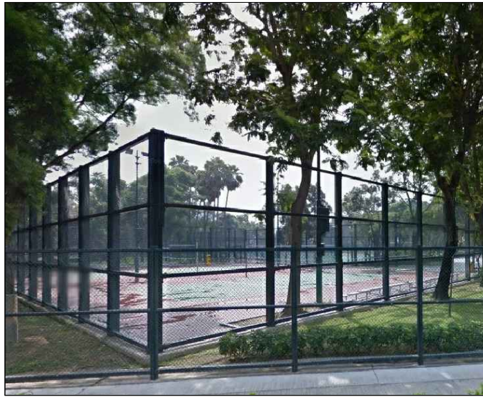
LR2-2: SHEK KU LUNG ROAD PLAYGROUND