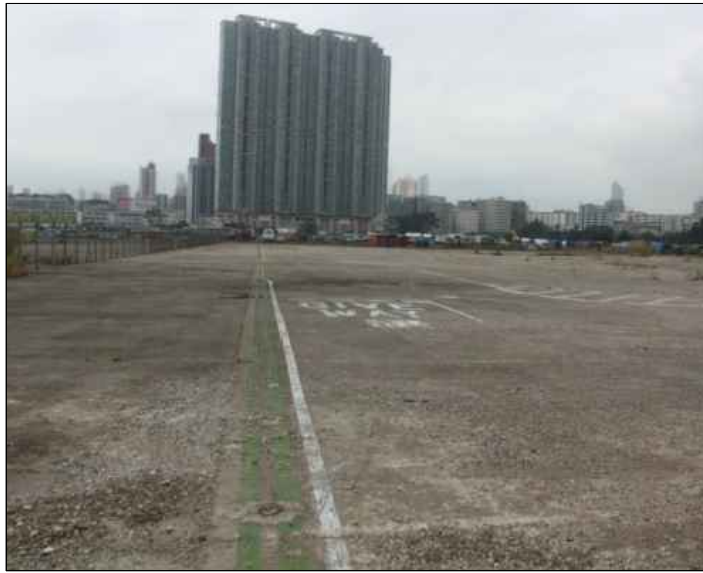
LR2-1: HARDSTANDING AT KAI TAK AIRPORT