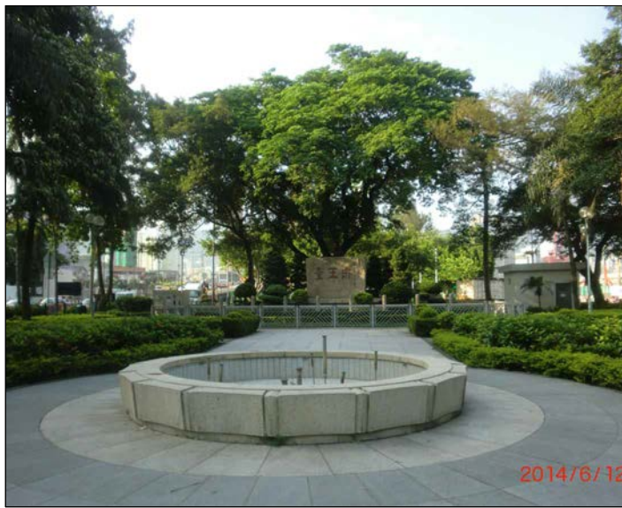
LR2-7: SUNG WONG TOI GARDEN