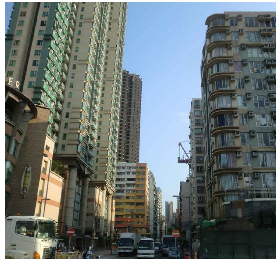
LCA03: MA TAU KOK AND KOWLOON CITY