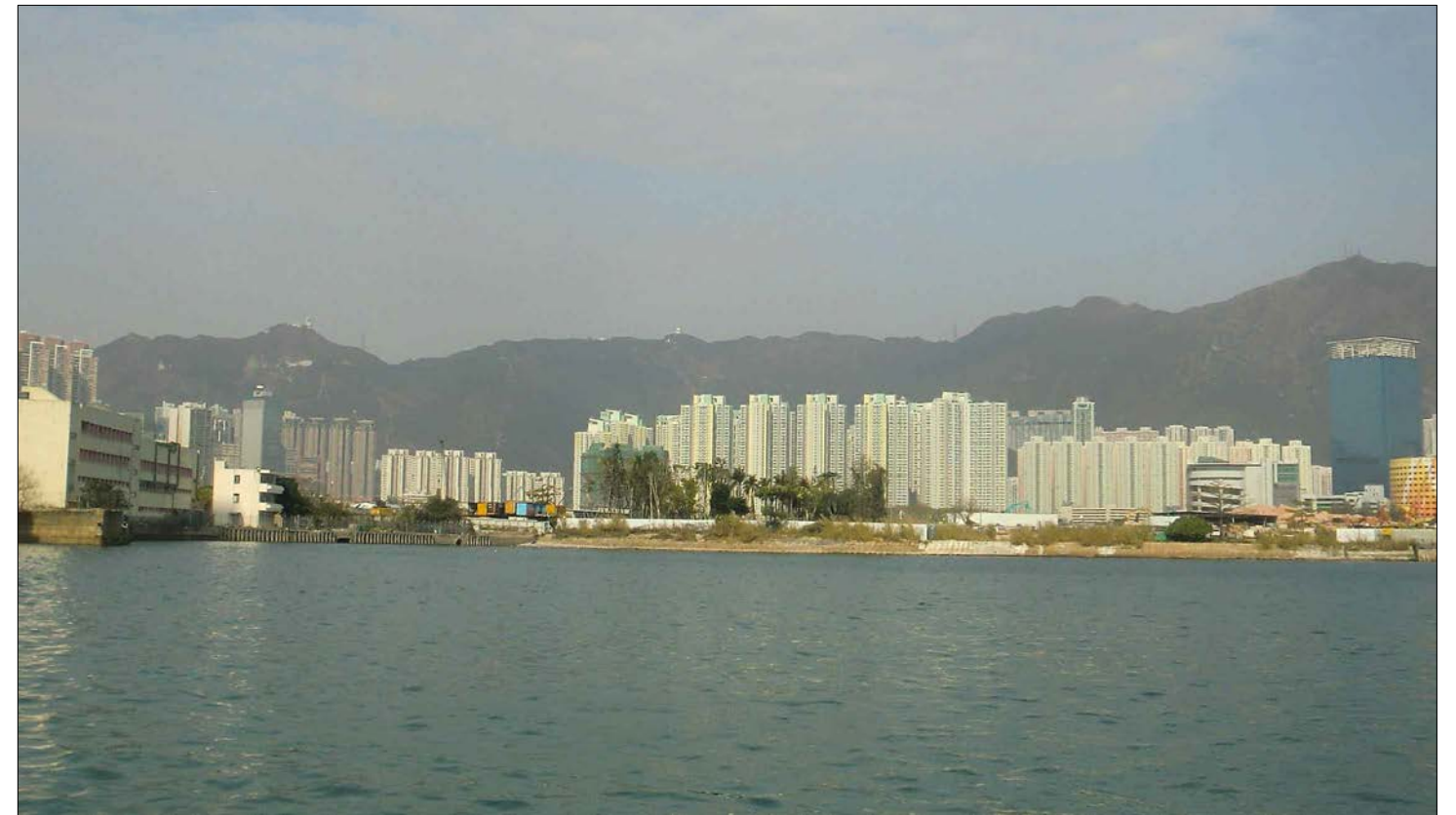
LCA05: TO KWA WAN TYPHOON SHELTER