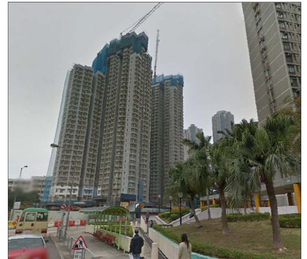
LCA04: TUNG TAU ESTATE