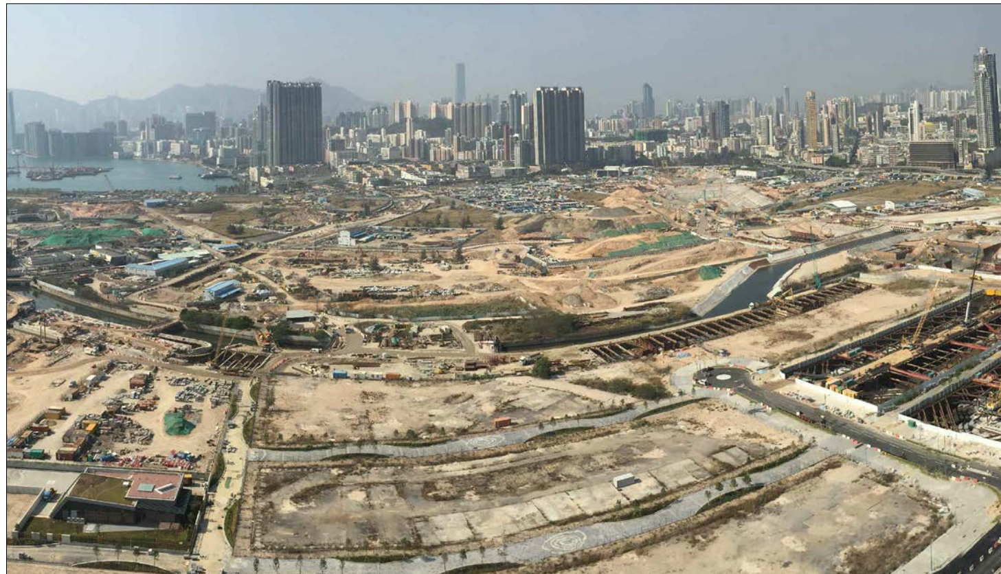
LCA01: FORMER KAI TAK AIRPORT