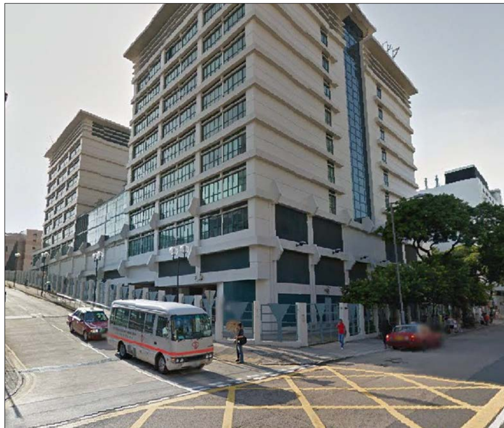
LCA02: INSTITUTIONAL AREAS NORTH AND SOUTH OF ARGYLE ROAD