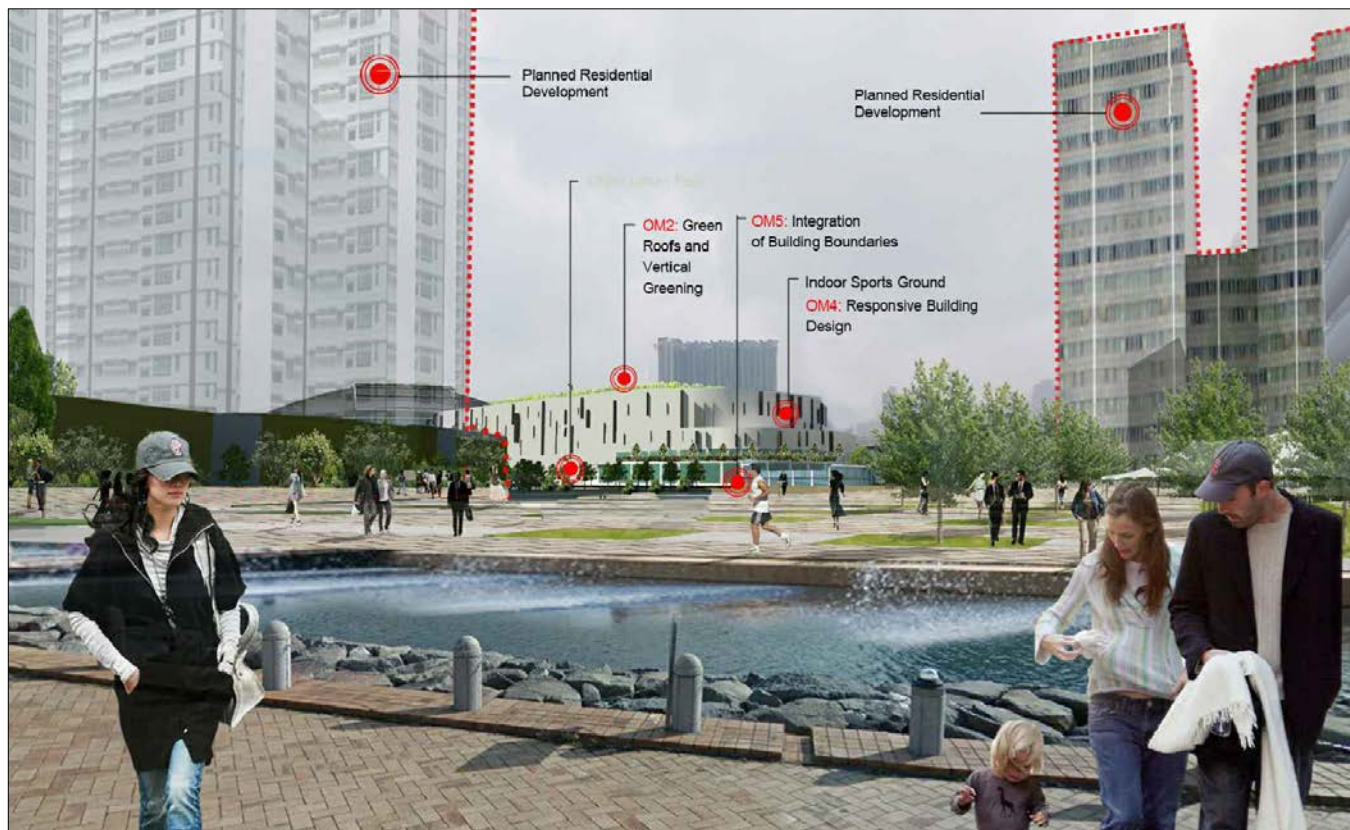
DAY 1 WITH MITIGATION MEASURES