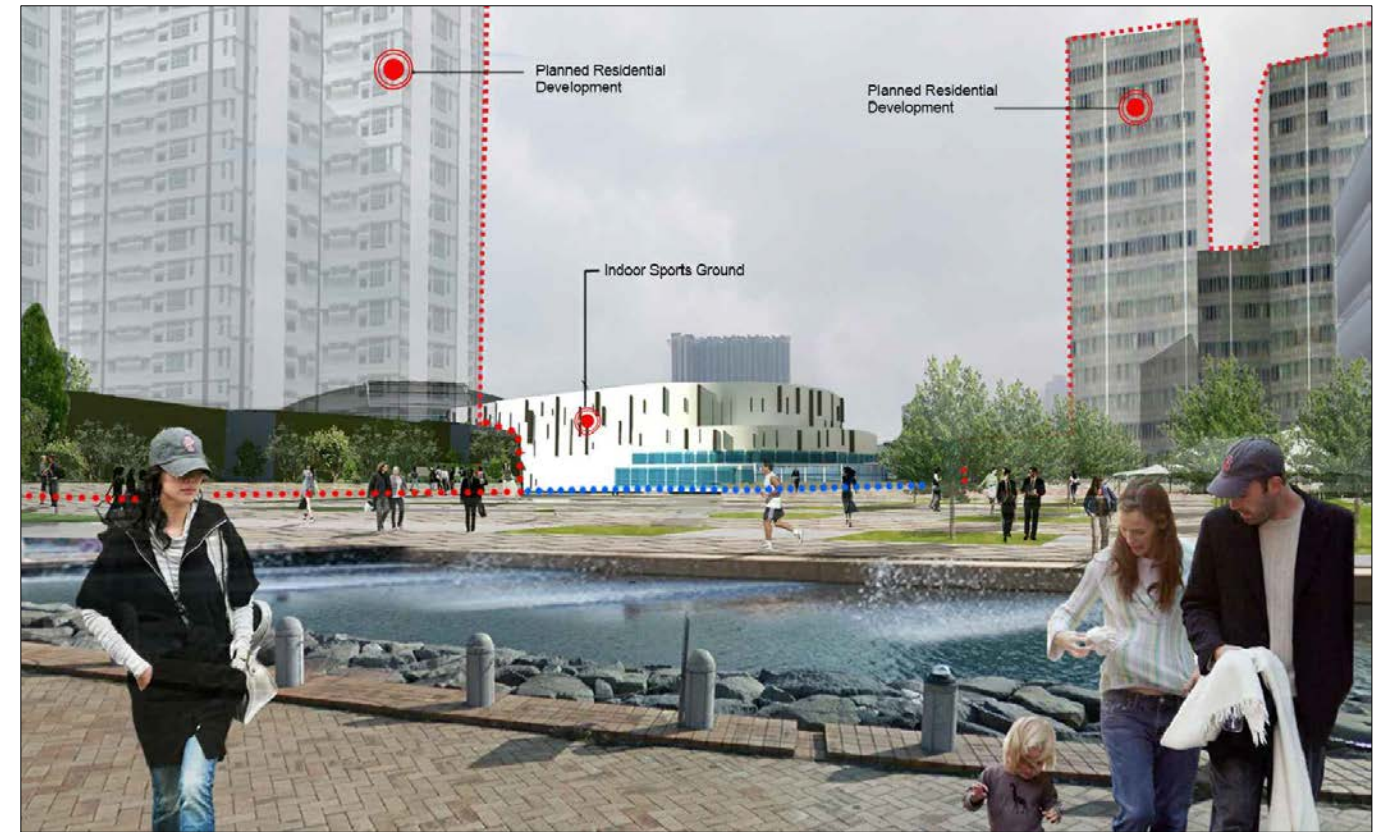
DAY 1 WITHOUT MITIGATION MEASURES