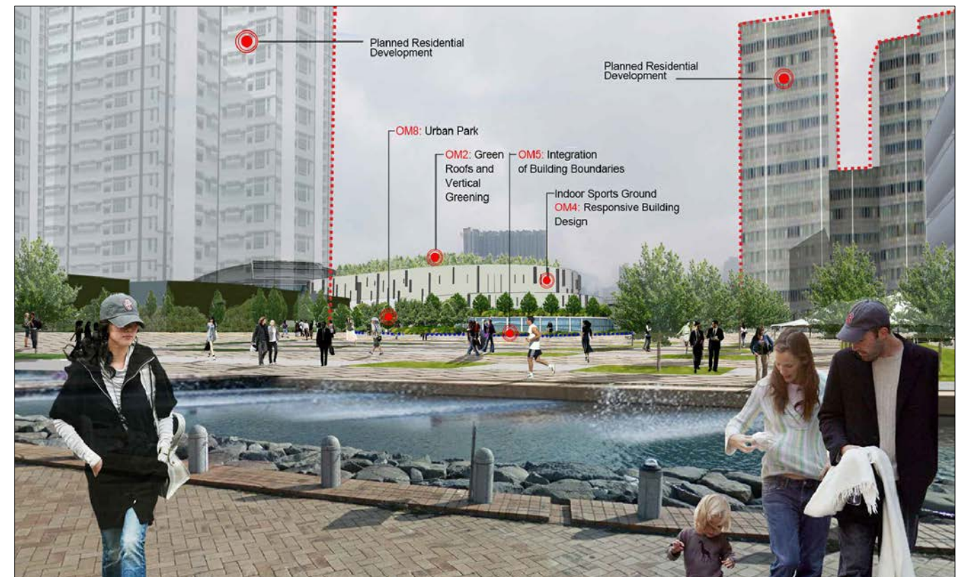
10 YEAR WITH MITIGATION MEASURES