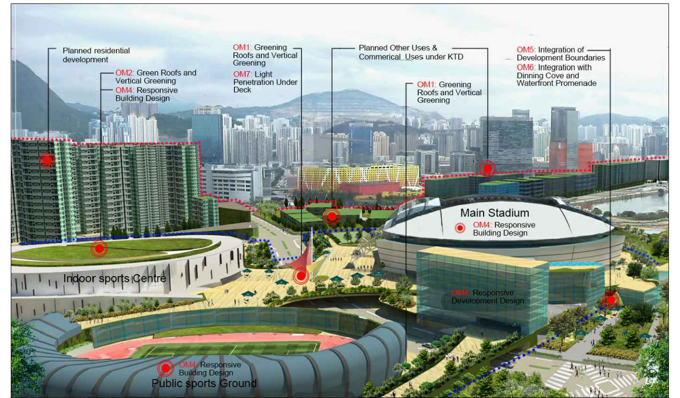
10 YEAR WITH MITIGATION MEASURES