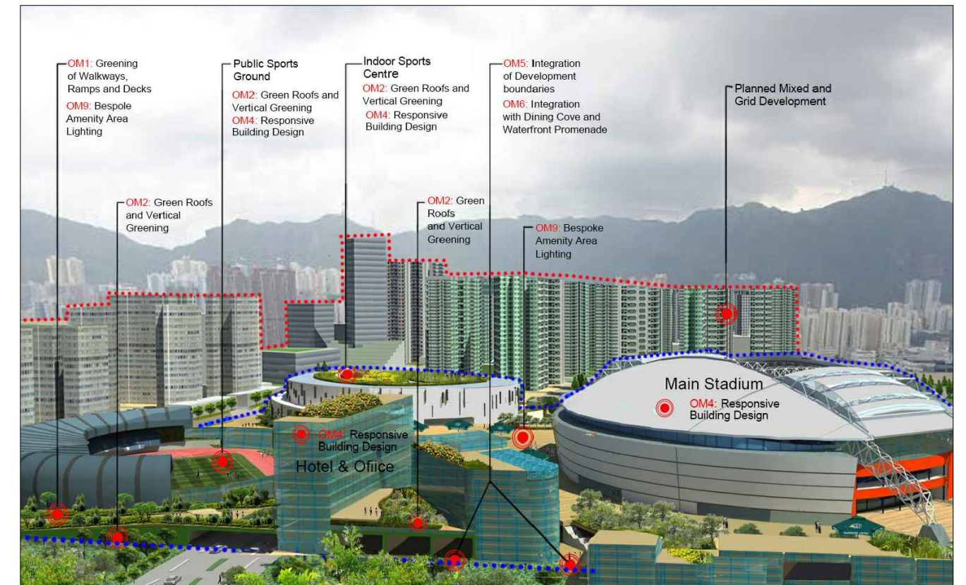
10 YEAR WITH MITIGATION MEASURES