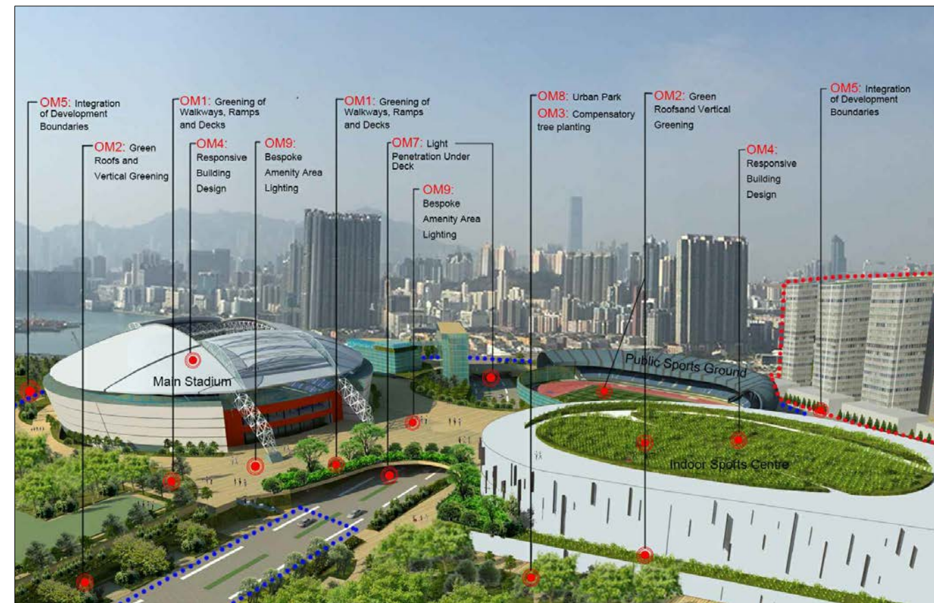
10 YEAR WITH MITIGATION MEASURES