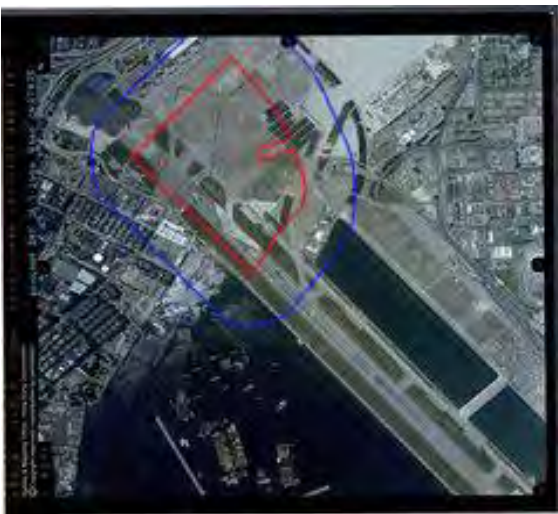
Figure 12-3-6 An aerial photograph showing the area of Old Kai Tak Airport on July 2000