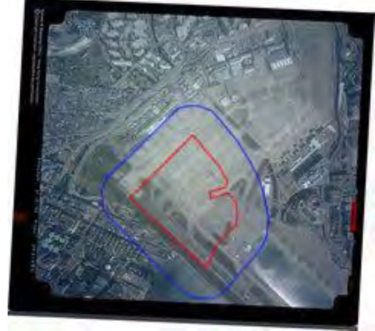
Figure 12-3-5 An aerial photograph showing the area of Old Kai Tak Airport on October 1998