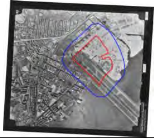
Figure 12-3-3 An aerial photograph showing Kai Tak Airport in 1972