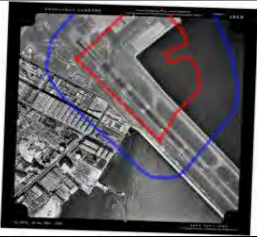
Figure 12-3-2 An aerial photograph showing Kai Tak Airport in 1963