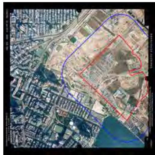
Figure 12-3-7 An aerial photograph showing the area of Old Kai Tak Airport on January 2014