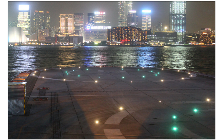
Lighting System of Existing Helipad in Wan Chai Heliport