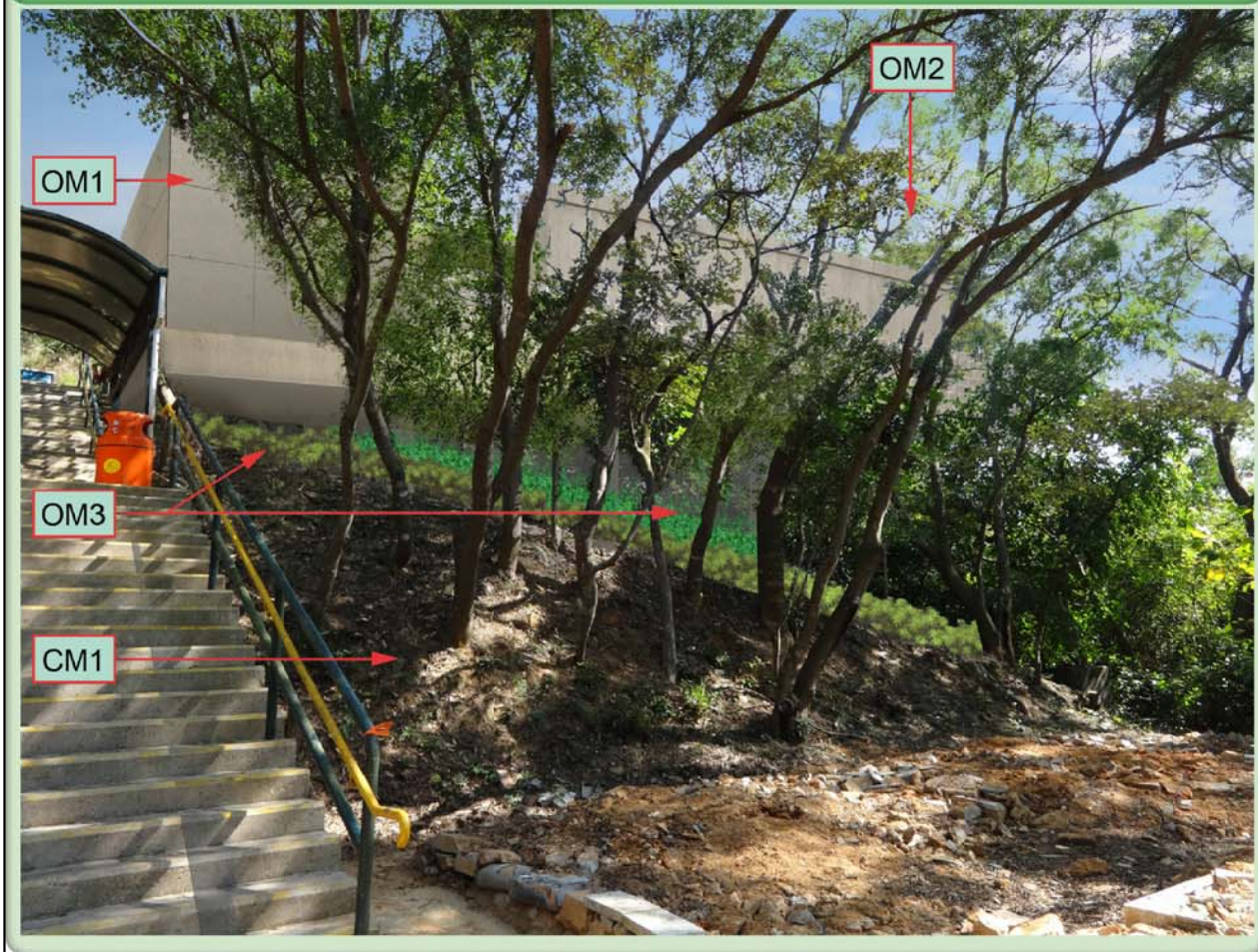
Day 1 with Mitigation Measure