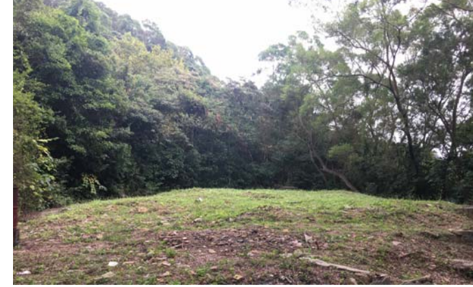
PHOTO SHOWING THE EXISTING CONDITION OF THE TREE COMPENSATION SITE

TREE COMPENSATION WITHIN THE EXISTING CEMETERY BOUNDARY