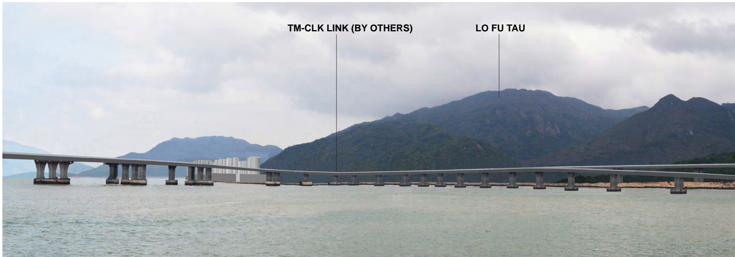
VSR1 Tung Chung New Town Extension Tung Chung East Development (TCNTE TCE Development) - Photomontage (Without mitigation at Day 1)