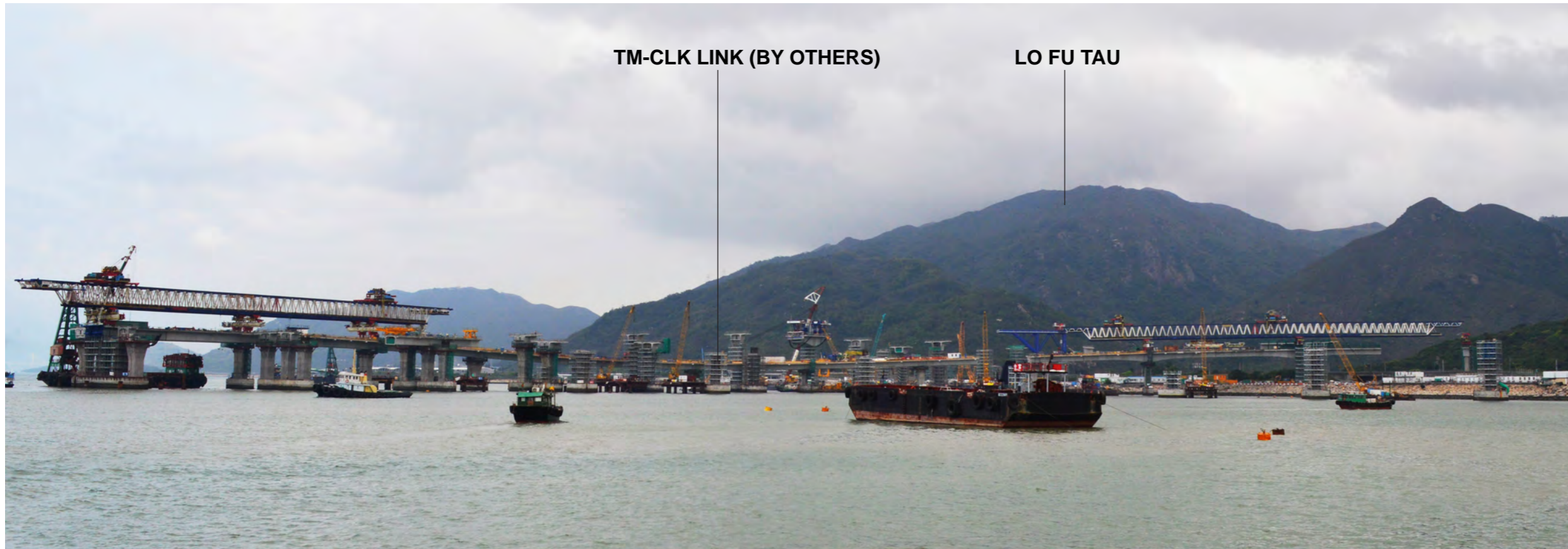
VSR1 Tung Chung New Town Extension Tung Chung East Development (TCNTE TCE Development) - Existing View (Approx. 1470m)