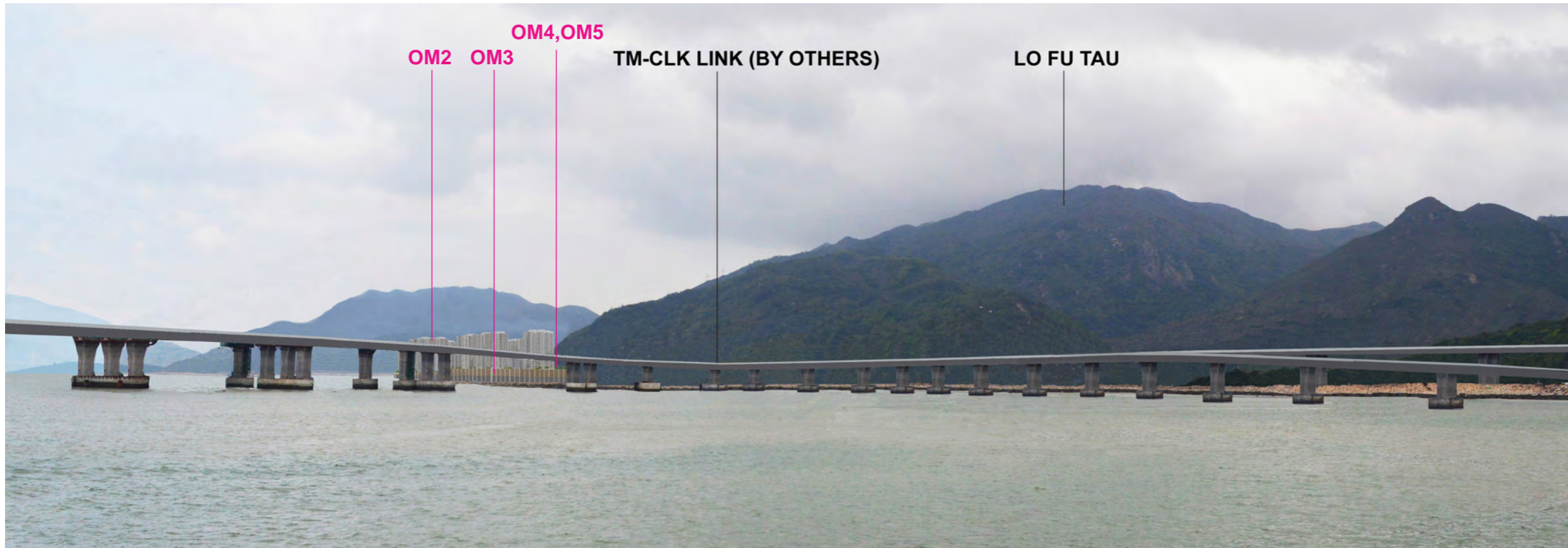
VSR1 Tung Chung New Town Extension Tung Chung East Development (TCNTE TCE Development) - Photomontage (With mitigation at Day 1)