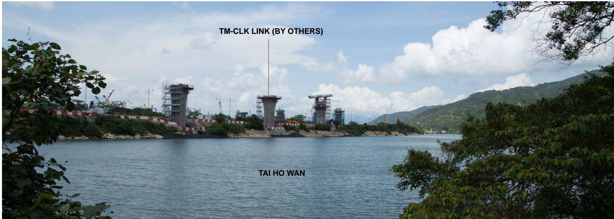
VSR3 Pak Mong Village - Existing View (Approx. 1130m)