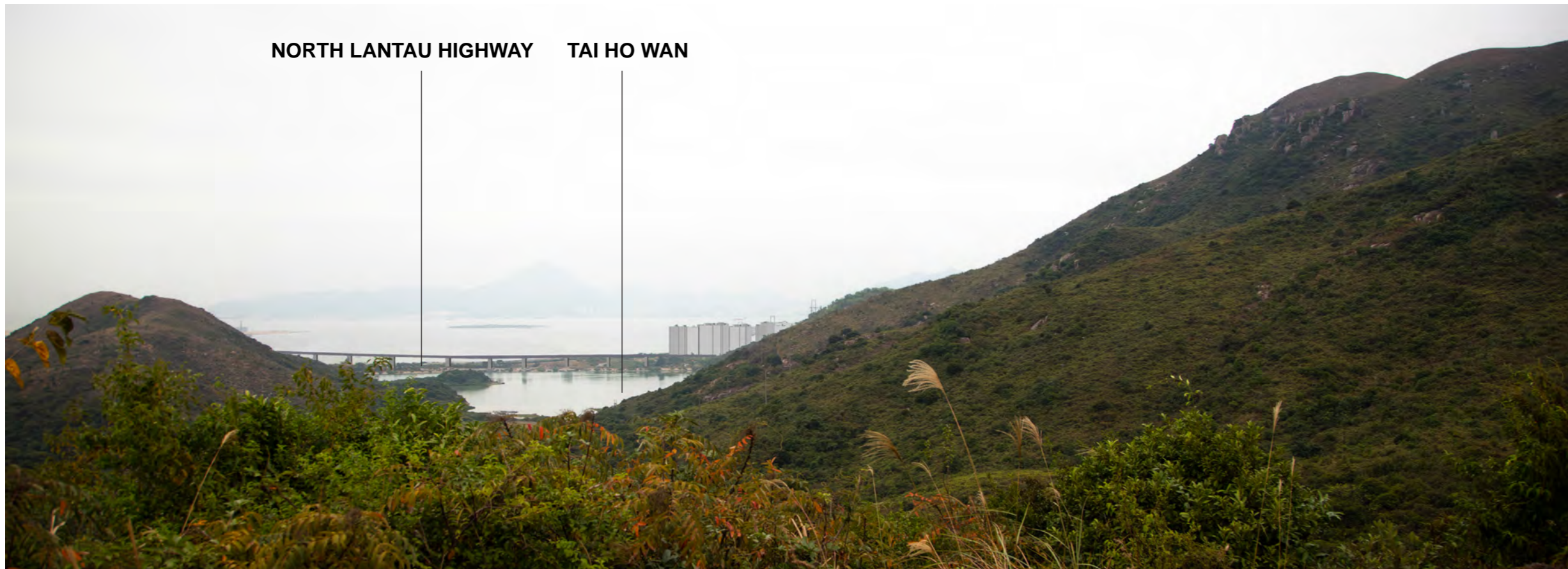
VSR4 Hong Kong Olympic Trail - Photomontage (Without mitigation at Day 1)