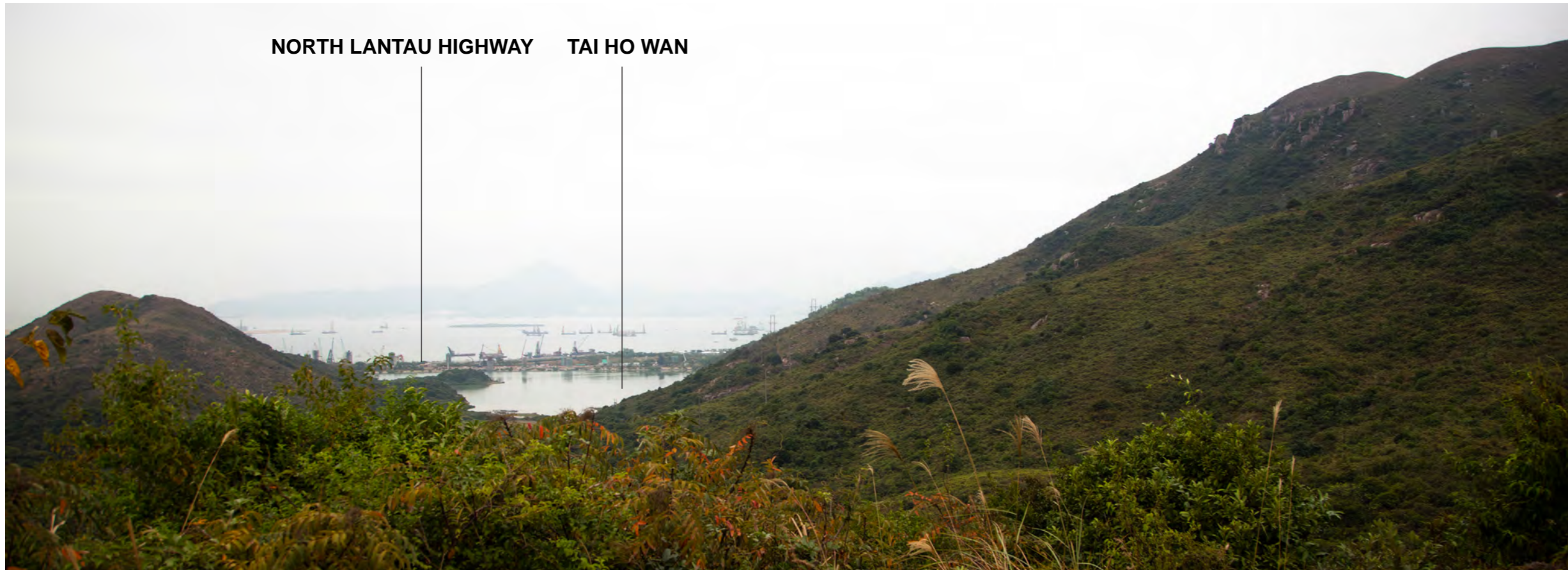
VSR4 Hong Kong Olympic Trail - Existing View (Approx. 1930m)