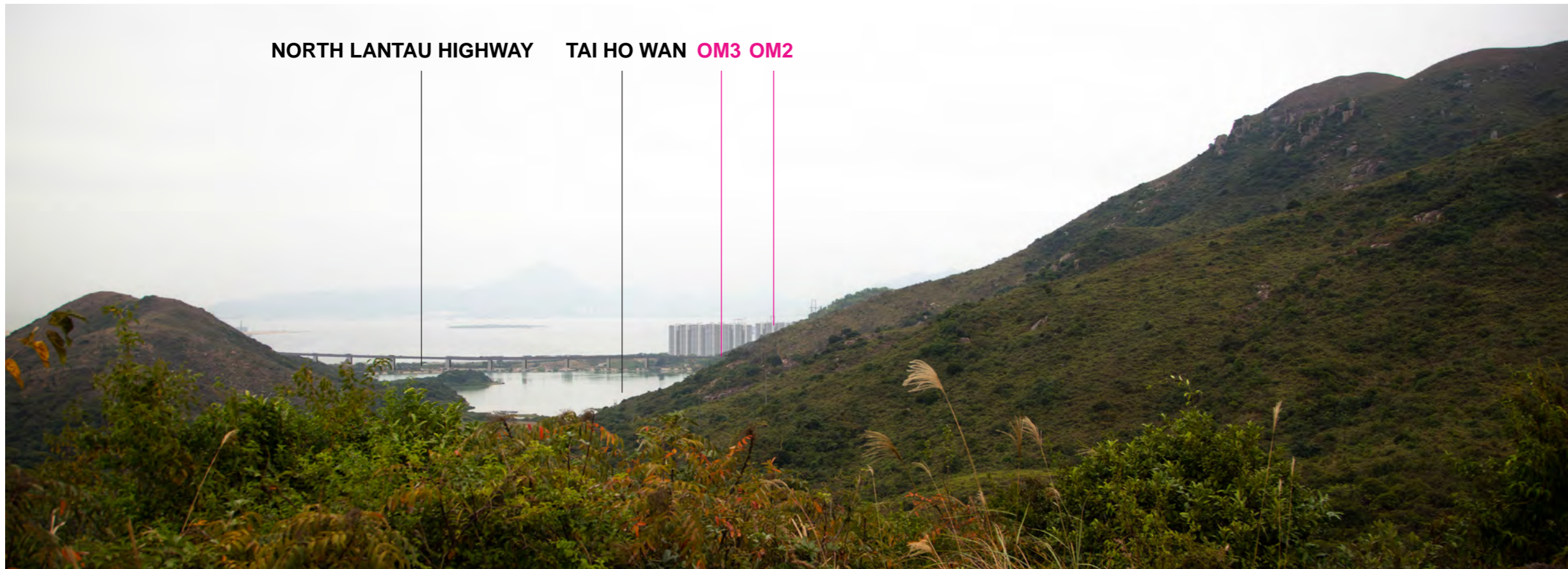
VSR4 Hong Kong Olympic Trail - Photomontage (With mitigation at Year 10)