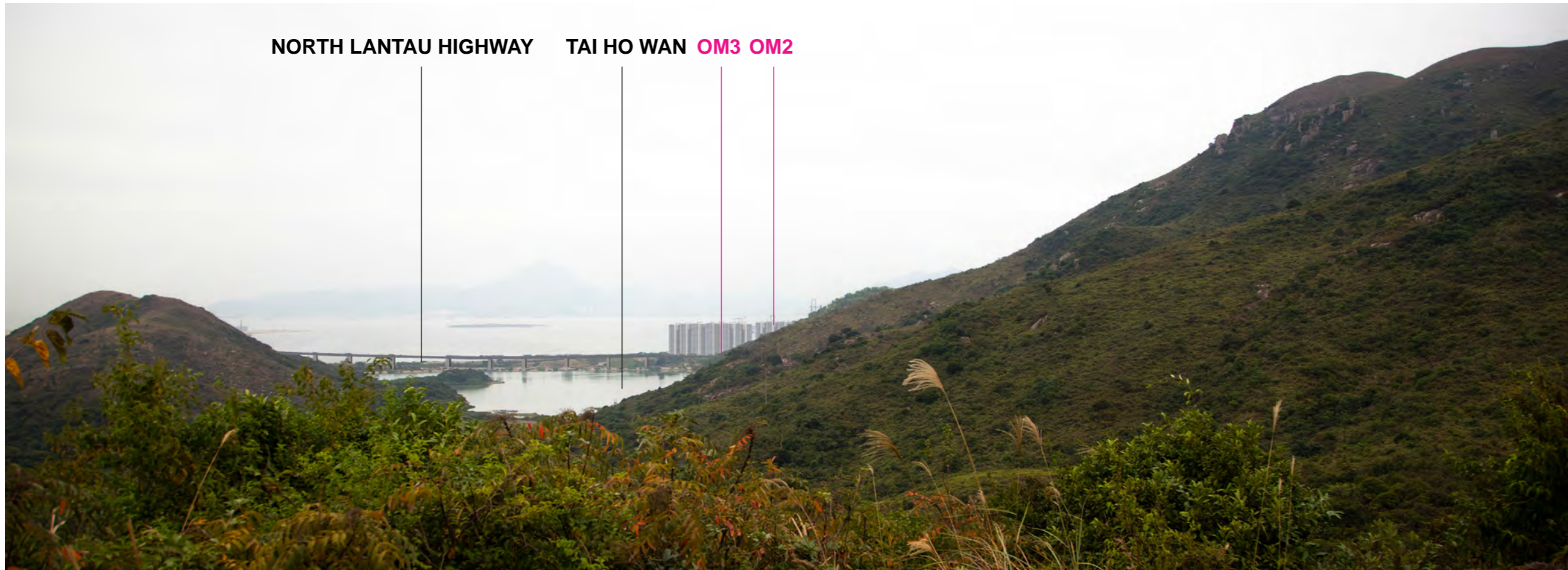
VSR4 Hong Kong Olympic Trail - Photomontage (With mitigation at Day 1)