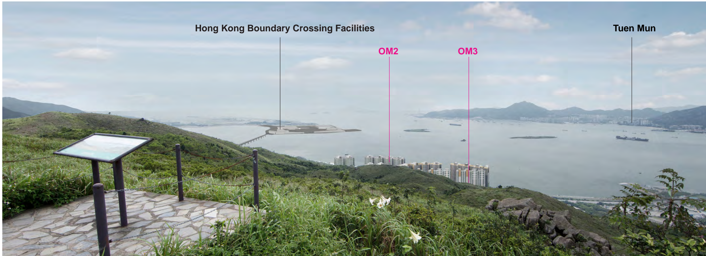
VSR5 Lo Fu Tau Country Trail - Photomontage (With mitigation at Year 10)