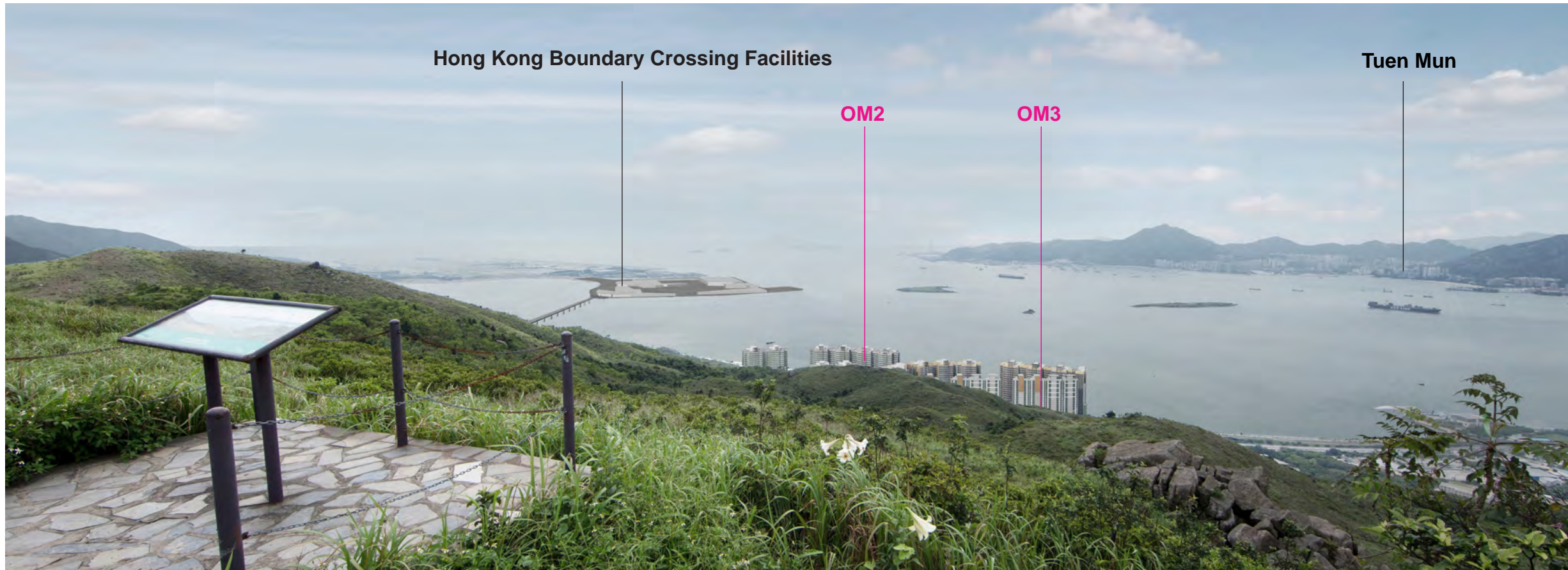
VSR5 Lo Fu Tau Country Trail - Photomontage (With mitigation at Day 1)