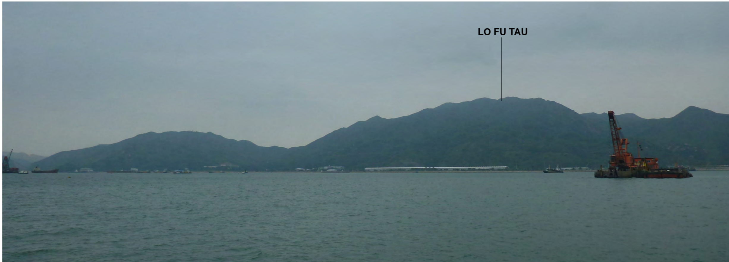
VSR6 Hong Kong Boundary Crossing Facilities - Existing View (Approx. 2390m)