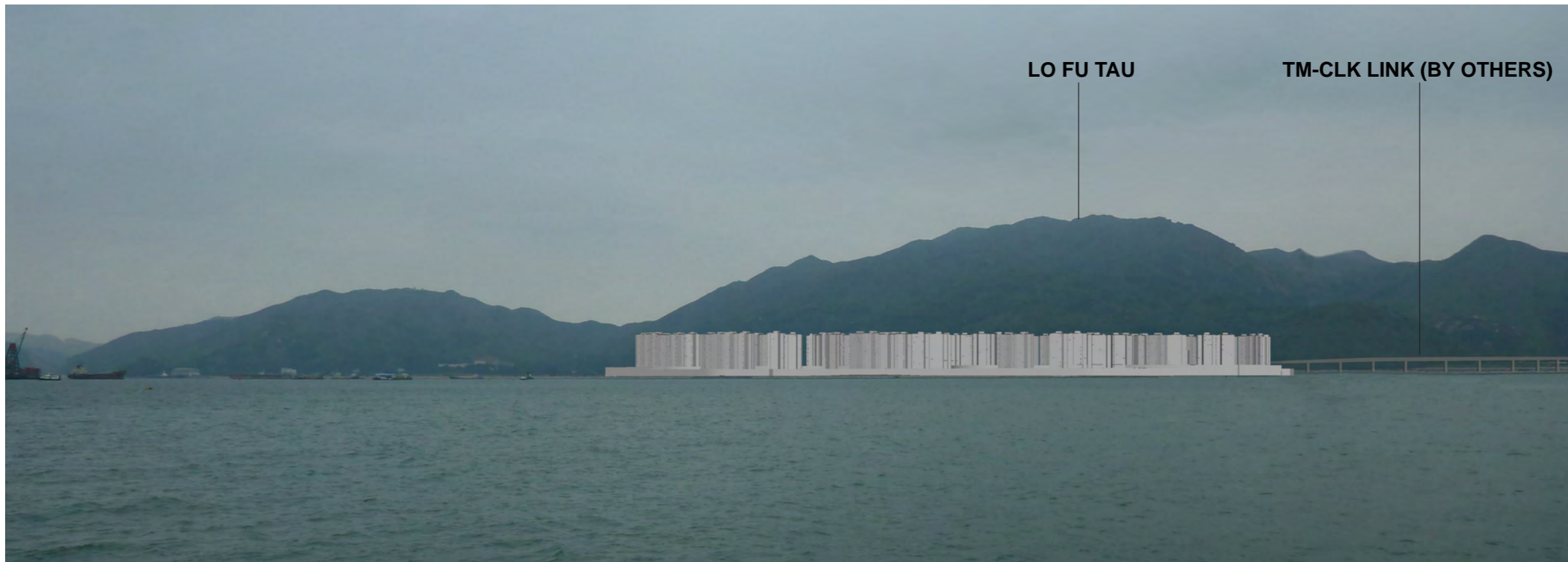
VSR6 Hong Kong Boundary Crossing Facilities - Photomontage (Without mitigation at Day 1)