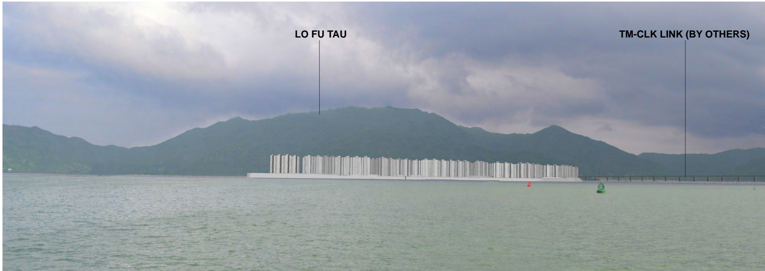
VSR7 Tai O-Tuen Mun Ferry - Photomontage (Without mitigation at Day 1)