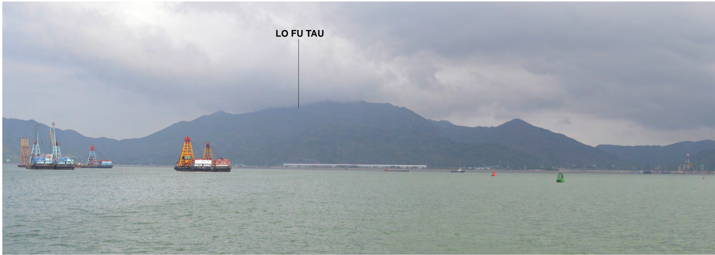
VSR7 Tai O-Tuen Mun Ferry - Existing View (Approx. 1825m)