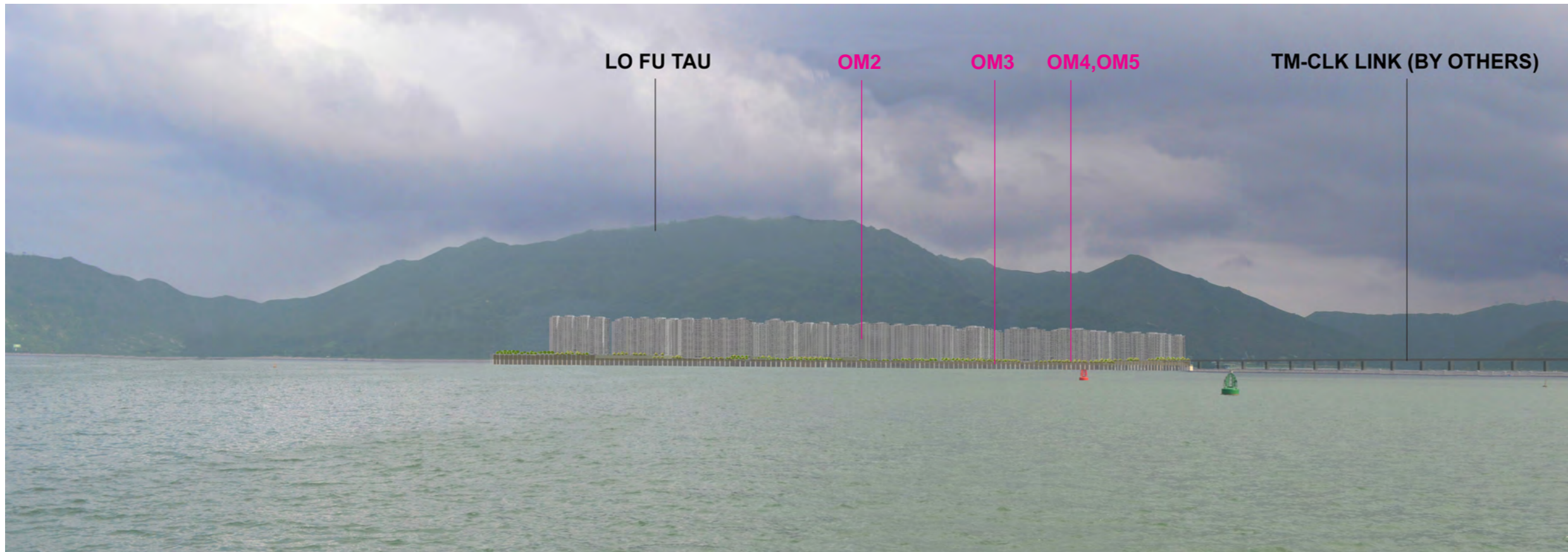
VSR7 Tai O-Tuen Mun Ferry - Photomontage (With mitigation at Year 10)