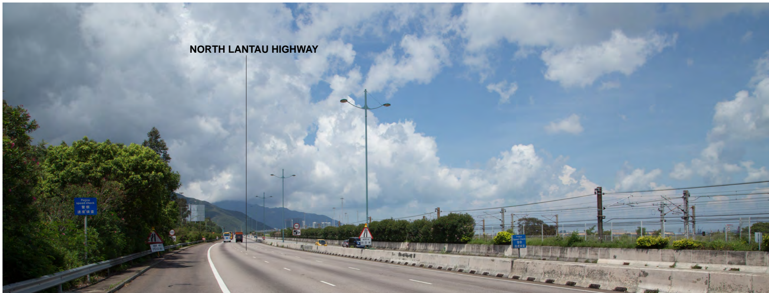
VSR8 North Lantau Highway - Existing View (Approx. 275m)