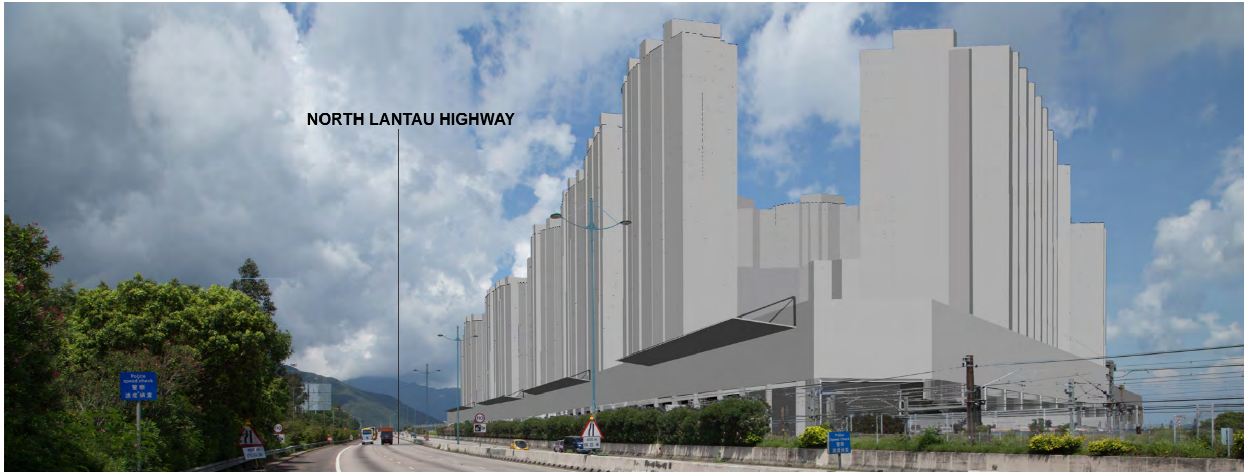
VSR8 North Lantau Highway - Photomontage (Without mitigation at Day 1)