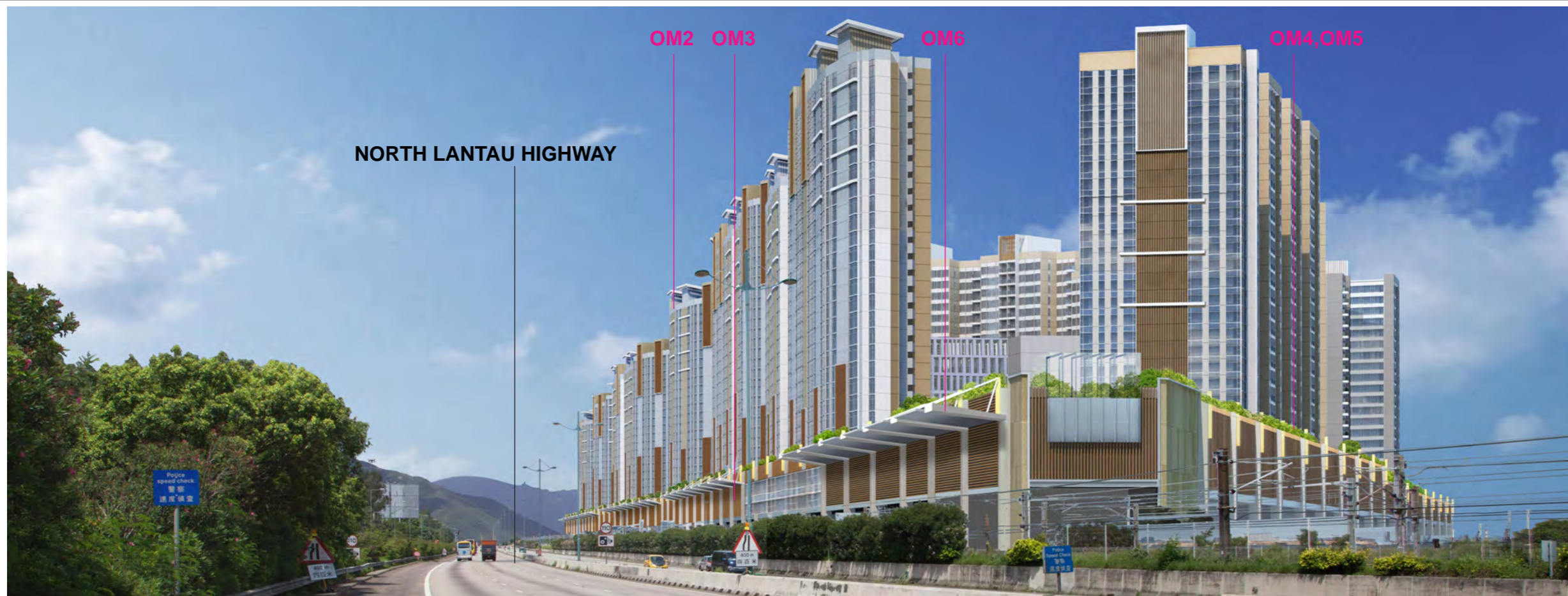
VSR8 North Lantau Highway - Photomontage (With mitigation at Day 1)