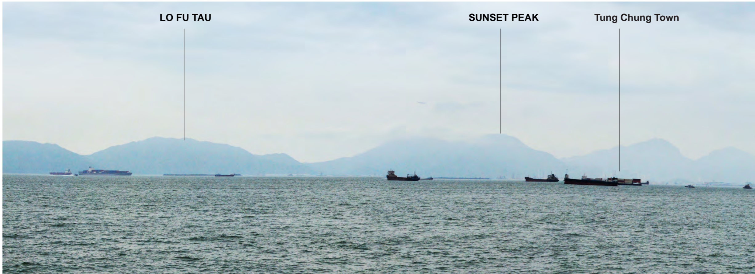
VSR12b Tuen Mun South Coast - Existing View (Approx. 6955m)