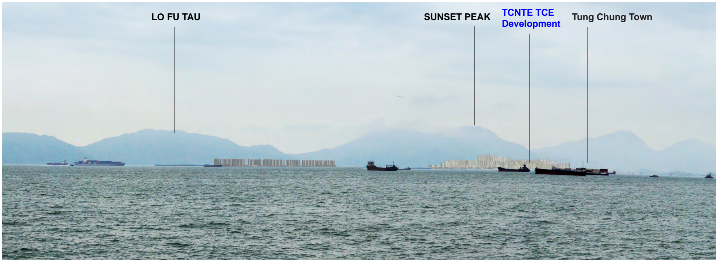
VSR12b Tuen Mun South Coast - Photomontage (Without mitigation at Day 1)