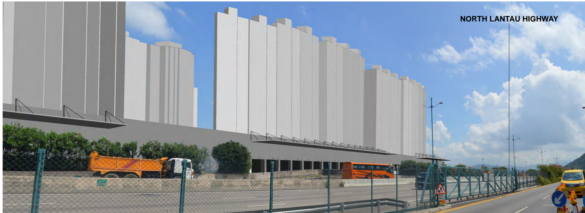
VSR13 Cheung Tung Road - Photomontage (Without mitigation at Day 1)