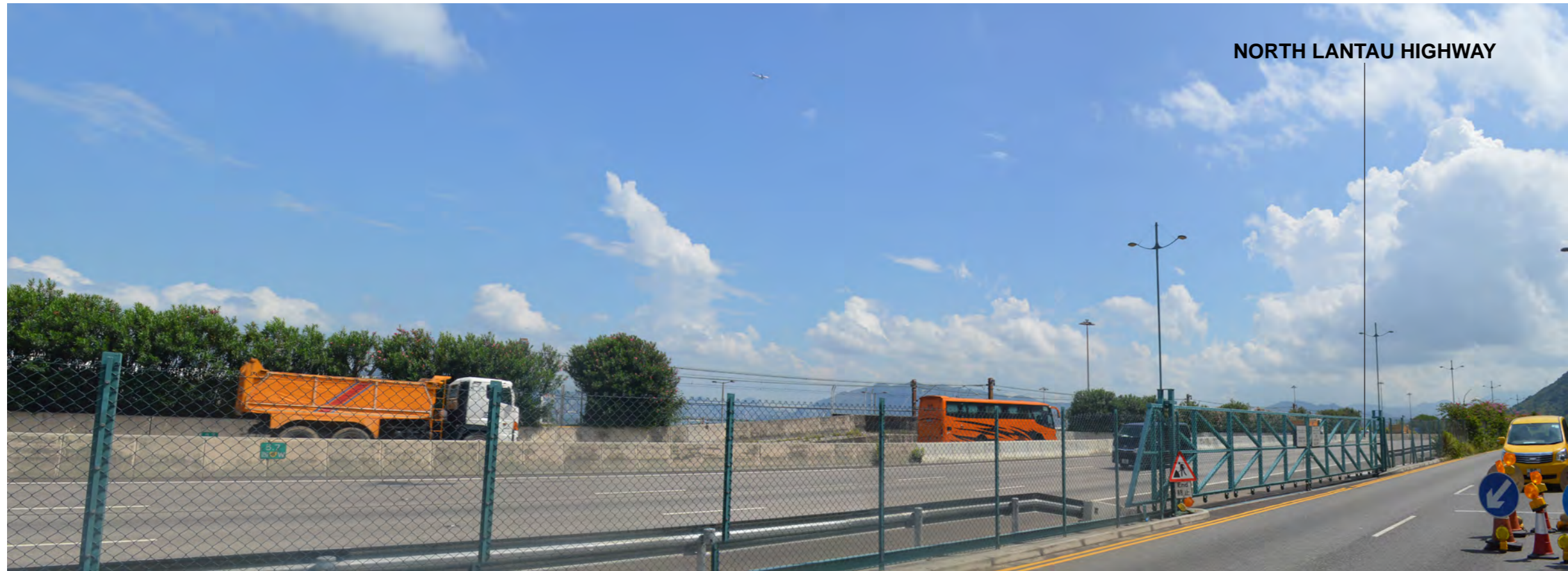
VSR13 Cheung Tung Road - Existing View (Approx. 50m)