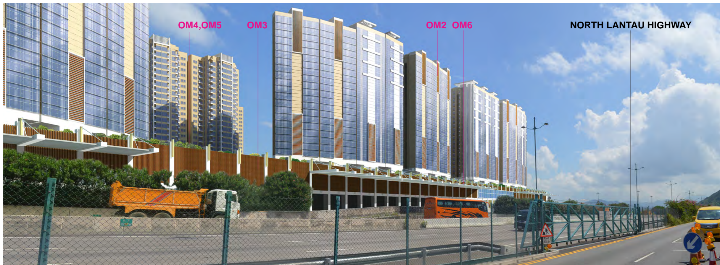
VSR13 Cheung Tung Road - Photomontage (With mitigation at Day 1)