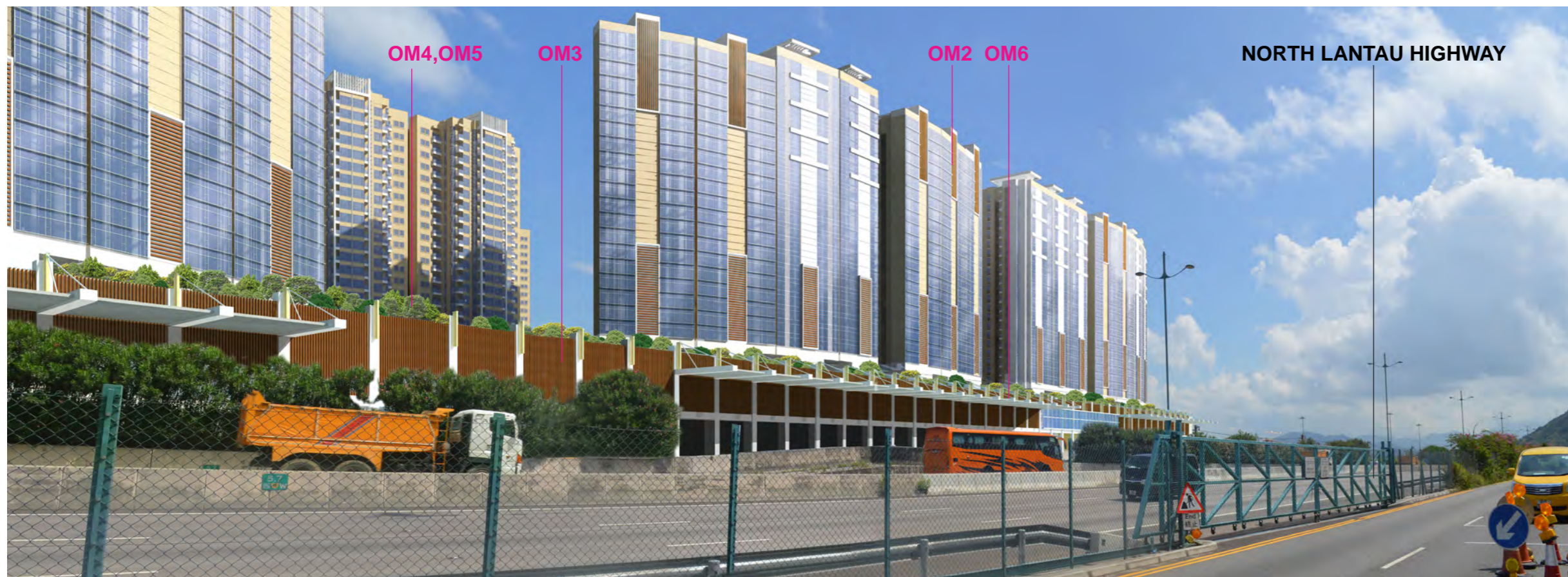
VSR13 Cheung Tung Road - Photomontage (With mitigation at Year 10)