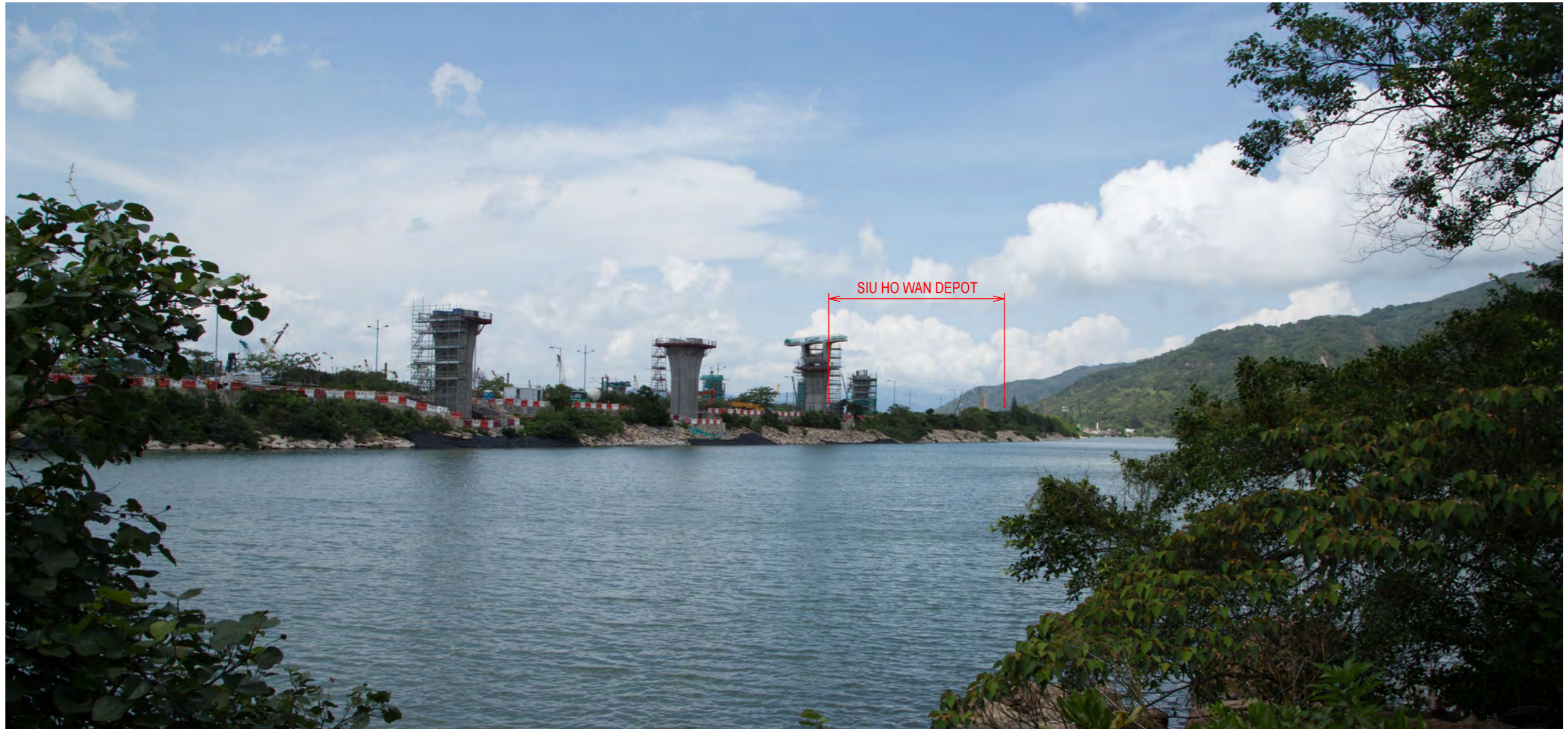
VSR 3 PAK MONG VILLAGE (APPROX. 1130M) TYPE OF VSR : RESIDENTIAL