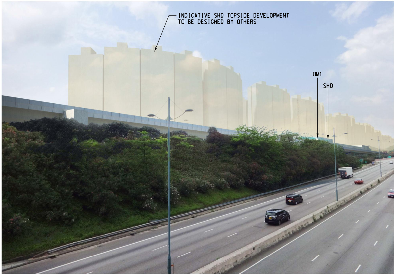
10 YEARS WITH MITIGATION MEASURE

NOTE : THE DRAWING PROVIDES AESTHETIC IMPRESSION OF THE INDICATIVE FORM, SIZE AND QUALITY OF THE ARCHITECTURAL AND LANDSCAPING TREATMENT FOR THE SHD STRUCTURES. THE FINAL DETAILS OF LAYOUT, MATERIALS AND FINISHES WILL BE SUBJECT TO DETAILED DESIGN.