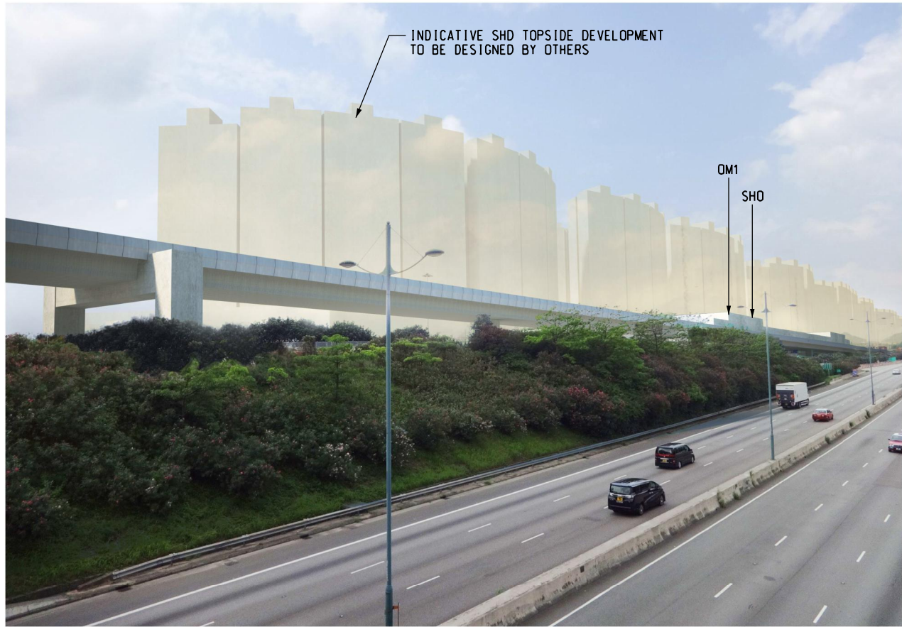
DAY 1 WITH MITIGATION MEASURE