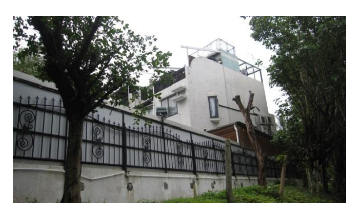
NSR<sub>2</sub> House No. 1, Narcissus Path, Palm Springs