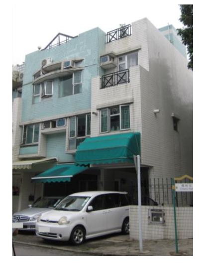
NSR 1 House No. 7, Cherry Path, Palm Springs