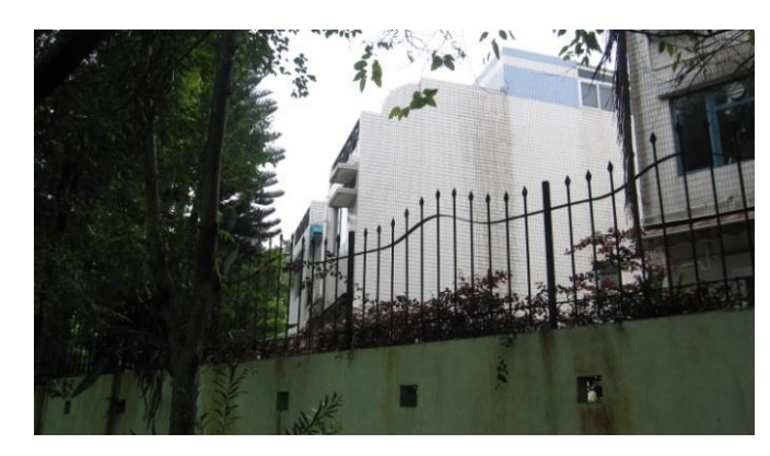
NSR 3 House No. 61, Narcissus Path, Palm Springs