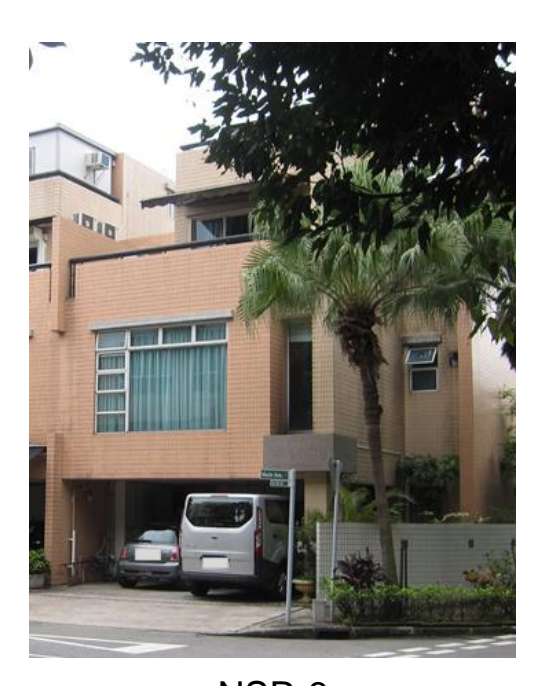
NSR 6 House No. 1, Mann Avenue, Royal Palms