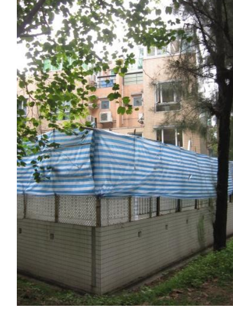
NSR 5 House No. 1, Ventura Avenue, Royal Palms