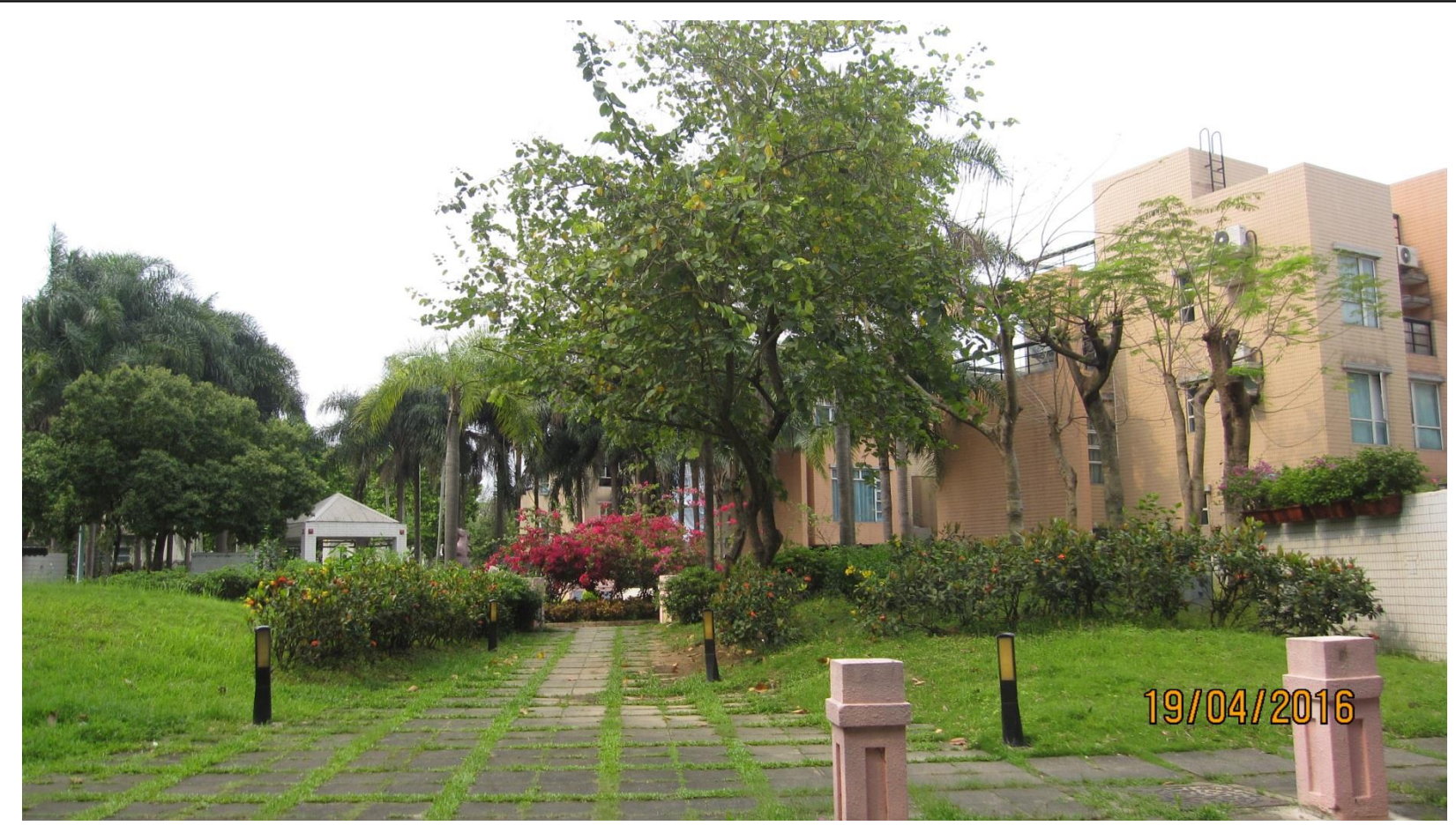
LR4 – Amenity Planting