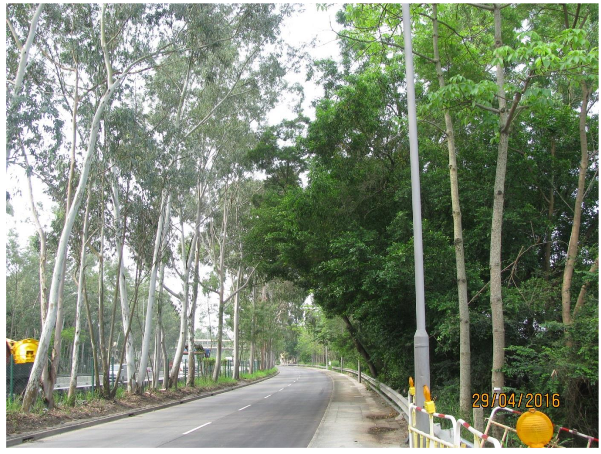
LR3 – Roadside Planting