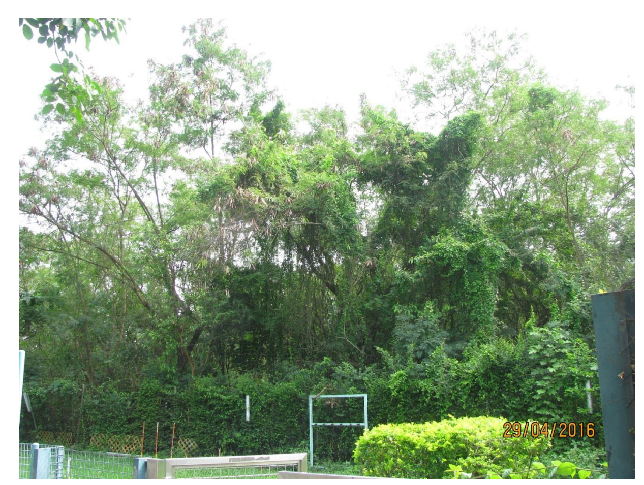
LR5 – Tree Plantation