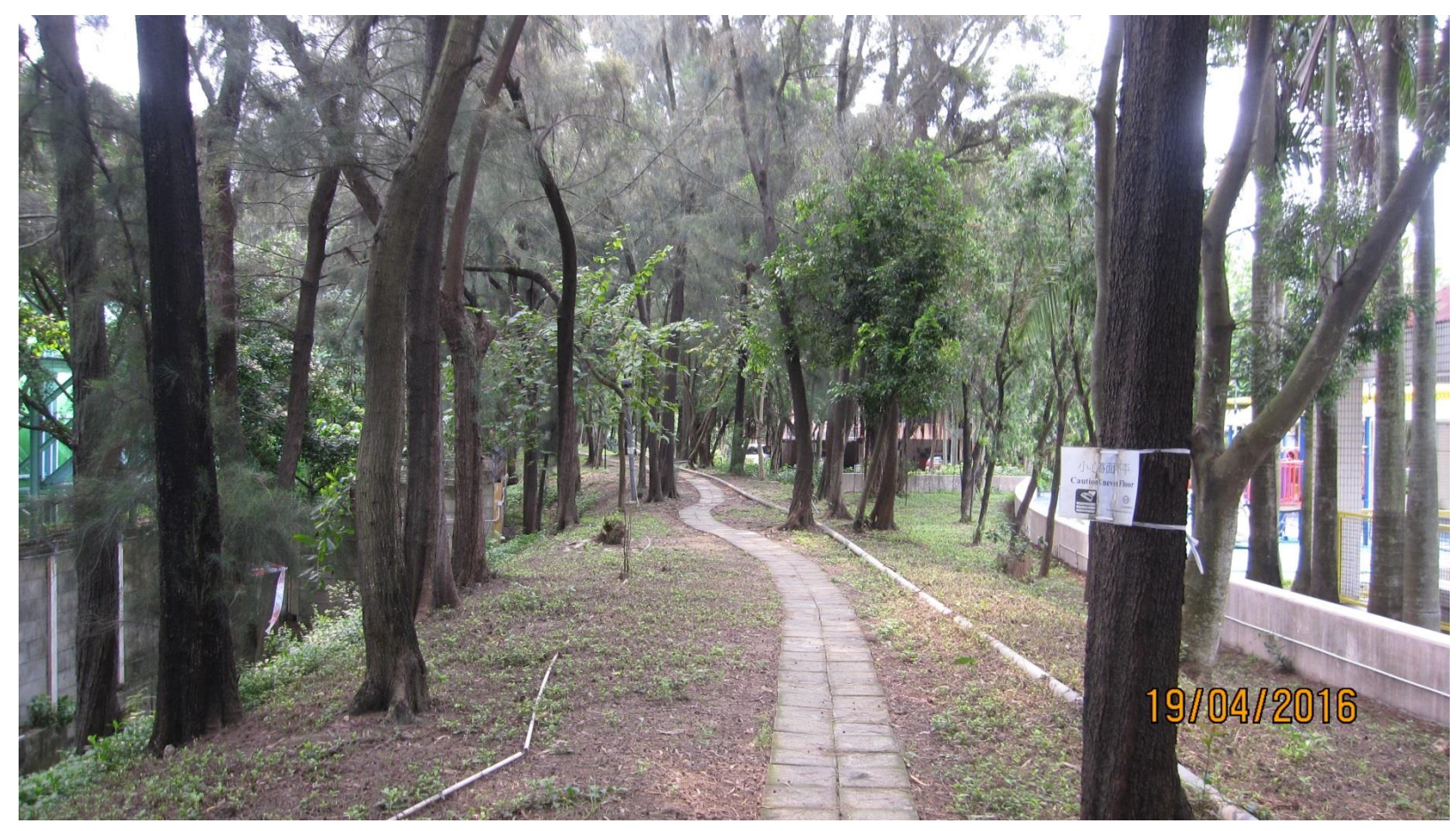
LR2 – Periphery Planting

This document is issued for the party which commissioned it and for specific purposes connected with the captioned project only. It should not be relied upon by any other party or used for any other purpose. We accept no responsibility for the consequences of this document being relied upon by any other party, or being used for any other purpose, or containing any error or omission which is due to an error or omission in data supplied to us by other parties.