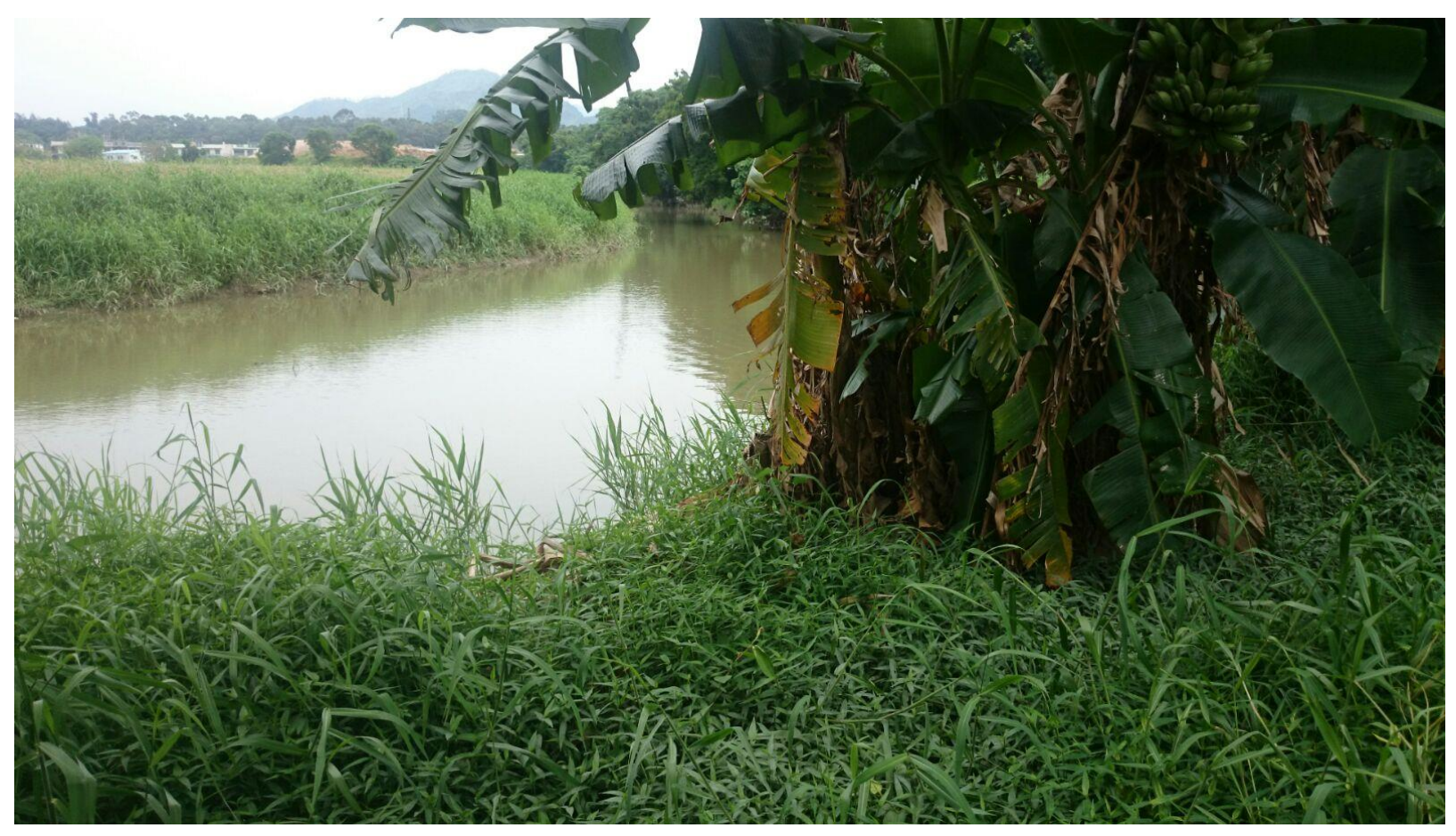
LR8.2 – Watercourse (North of Project Site)

This document is issued for the party which commissioned it and for specific purposes connected with the captioned project only. It should not be relied upon by any other party or used for any other purpose. We accept no responsibility for the consequences of this document being relied upon by any other party, or being used for any other purpose, or containing any error or omission which is due to an error or omission in data supplied to us by other parties.