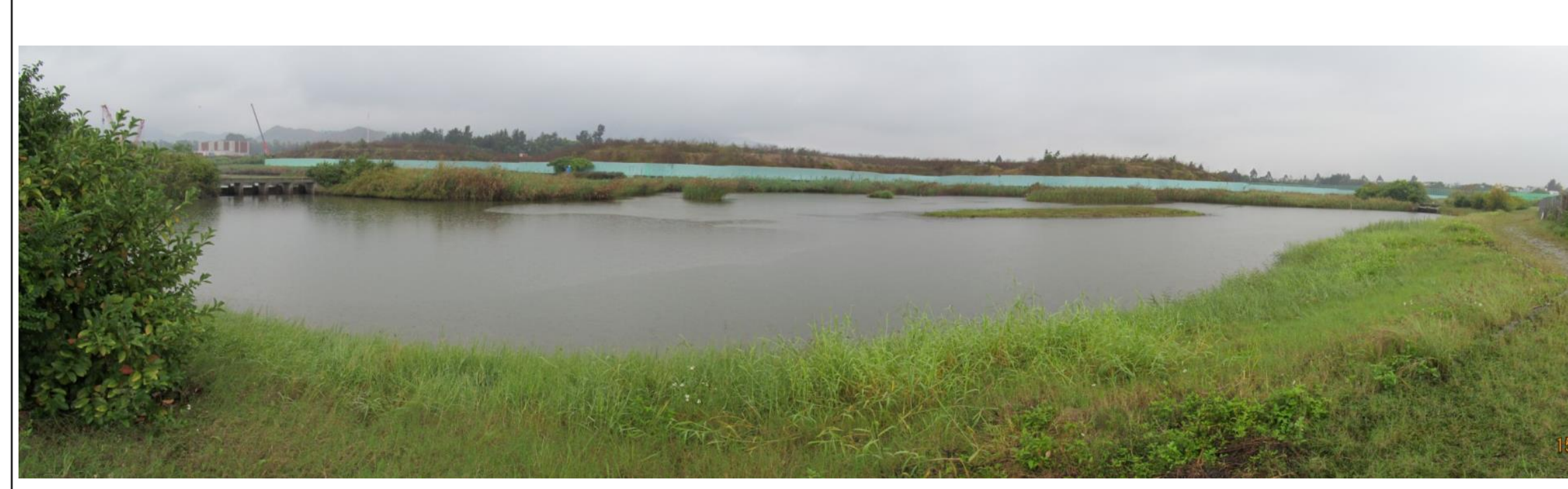
LR6 – Restored Wetland