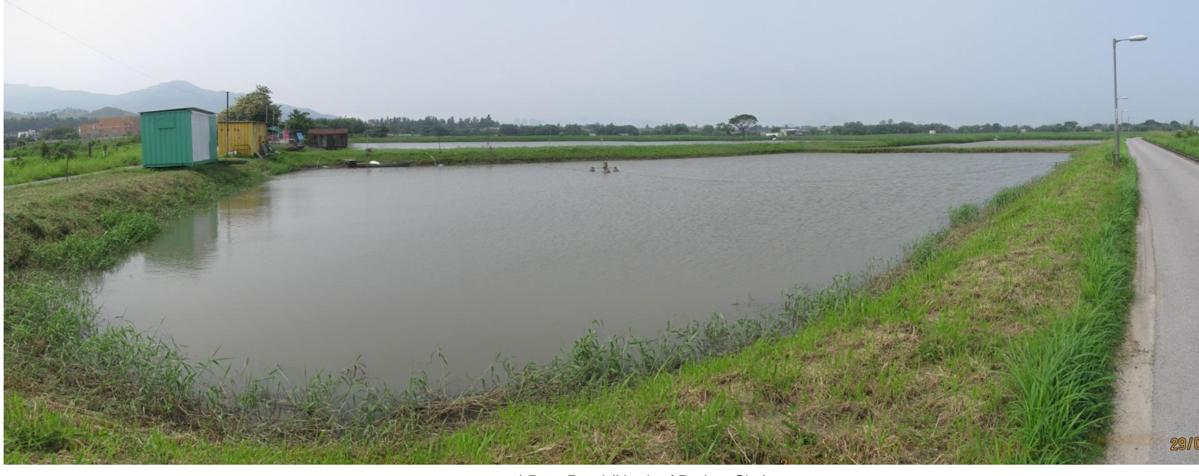
LR7 – Pond (North of Project Site)

This document is issued for the party which commissioned it and for specific purposes connected with the captioned project only. It should not be relied upon by any other party or used for any other purpose. We accept no responsibility for the consequences of this document being relied upon by any other party, or being used for any other purpose, or containing any error or omission which is due to an error or omission in data supplied to us by other parties.