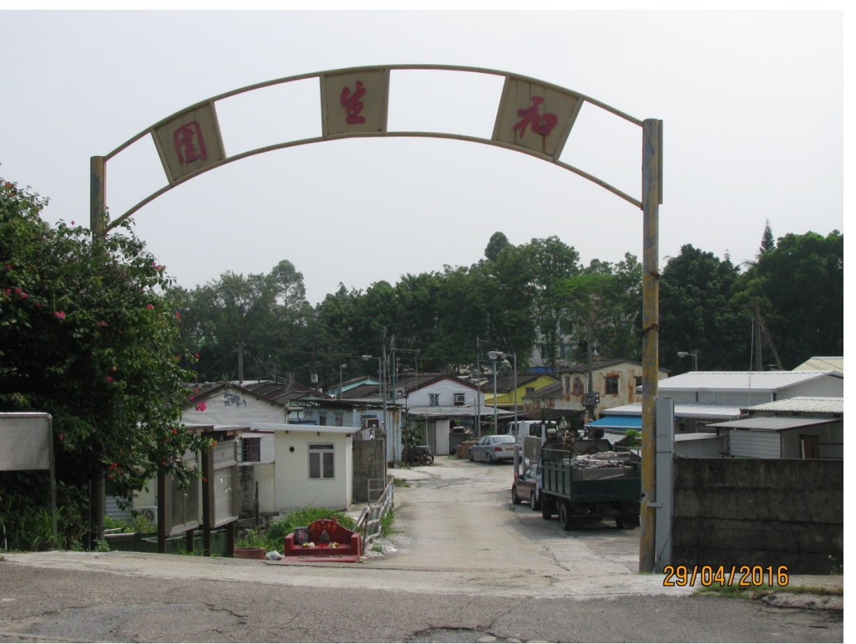
LCA3 – Village Type Development