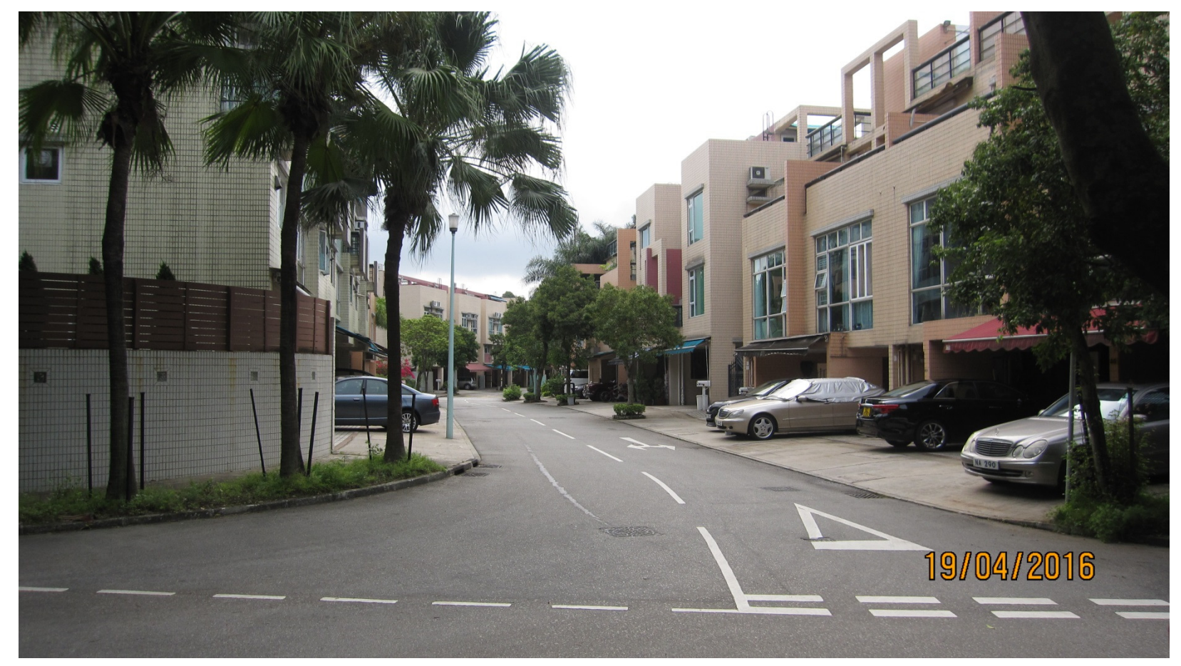
LCA1 – Low-rise Rural Residential Development