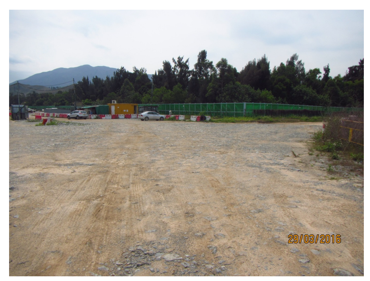
LCA2 - Planned Comprehensive Residential Development