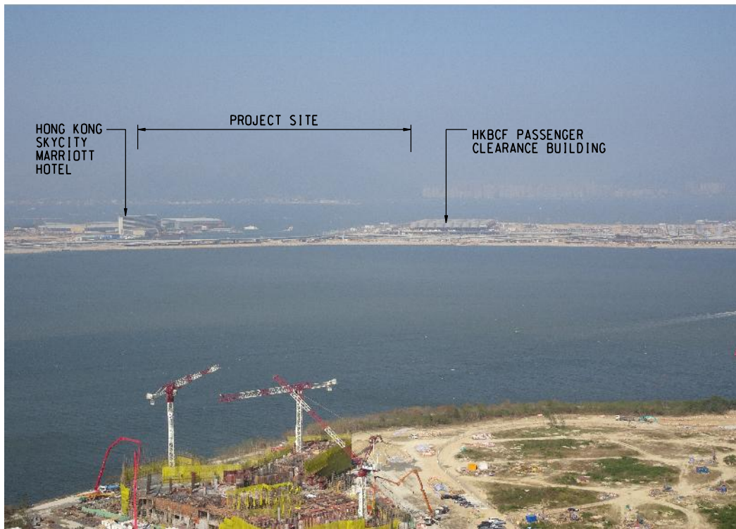
EXISTING VIEW OF R1 FROM TUNG CHUNG TOWN