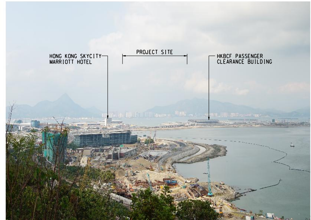
EXISTING VIEW OF RE5 FROM SCENIC HILL