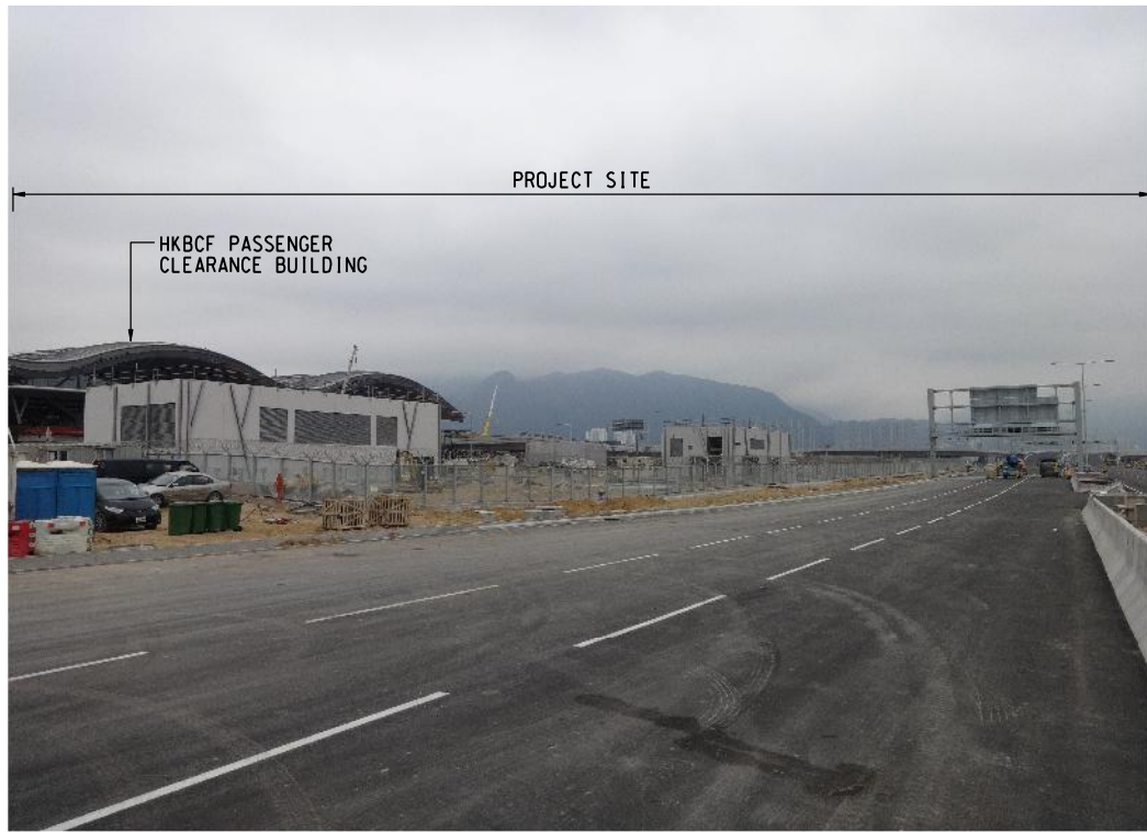
EXISTING VIEW OF O6 AND T1 FROM HKBCF