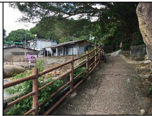
PHOTO 594 VILLAGE HOUSES AND PEDESTRIAN WALKWAY DATE TAKEN: 21/06/2016

This drawing has been prepared for the use of AECOM's client. It may not be used, modified, reproduced or relied upon by third parties, except as agreed by AECOM or as required by law. AECOM accepts no responsibility, and disclaims any liability whatsoever, to any party that uses or relies on this drawing without AECOM's express written consent. Do not scale this document. All measurements must be obtained from the stated dimensions.