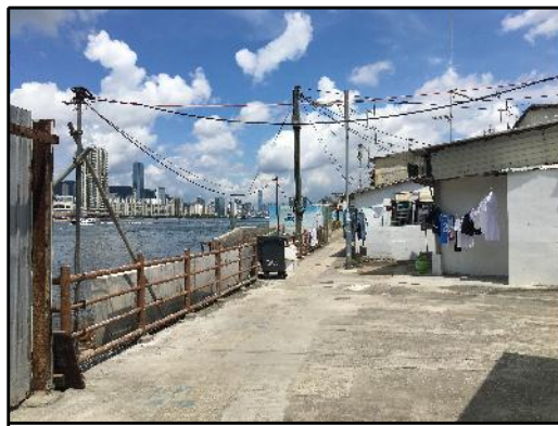
PHOTO 593 VILLAGE HOUSES AND PEDESTRIAN WALKWAY DATE TAKEN: 21/06/2016

PROJECT NO. 項目編號 60494885 AGREEMENT NO. 協議編號 SHEET TITLE 圖紙名稱 PHOTO RECORDS OF SITE RECONNAISSANCE (REGION E) SHEET NUMBER 圖紙編號 60494885/EIA/FIGURE 8.1E SHEET 5 OF 5