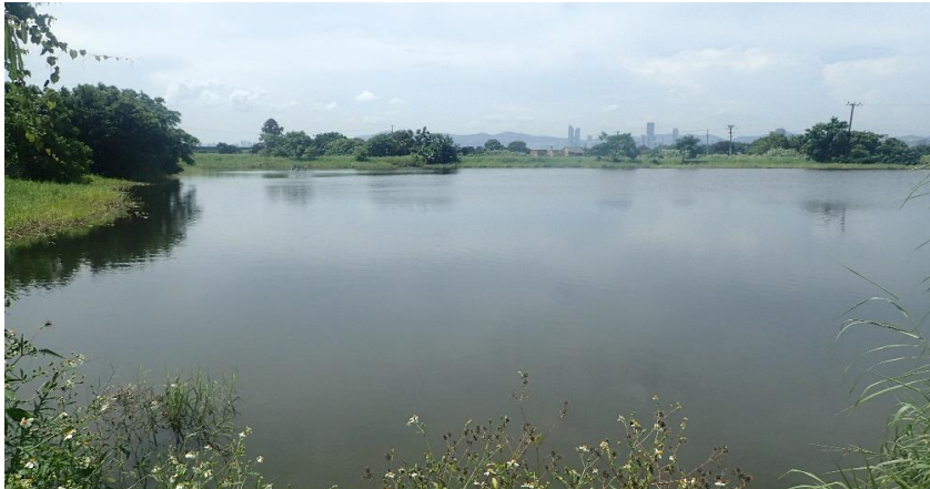
Inactive Fishpond at Fung Lok Wai