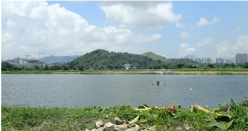
Active Fishpond at Fung Lok Wai