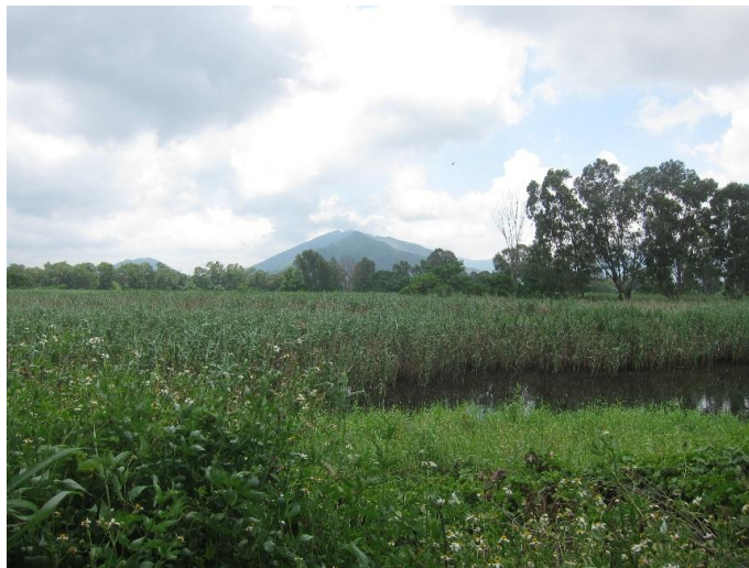
Inactive Fishpond at Nam Sang Wai