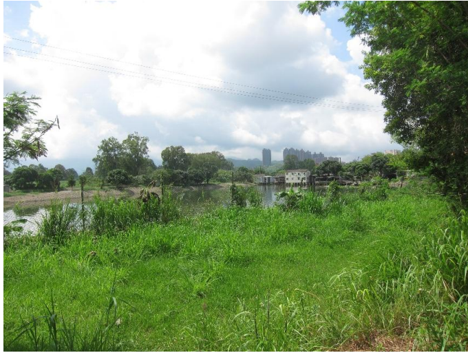
Active Fishpond at Nam Sang Wai