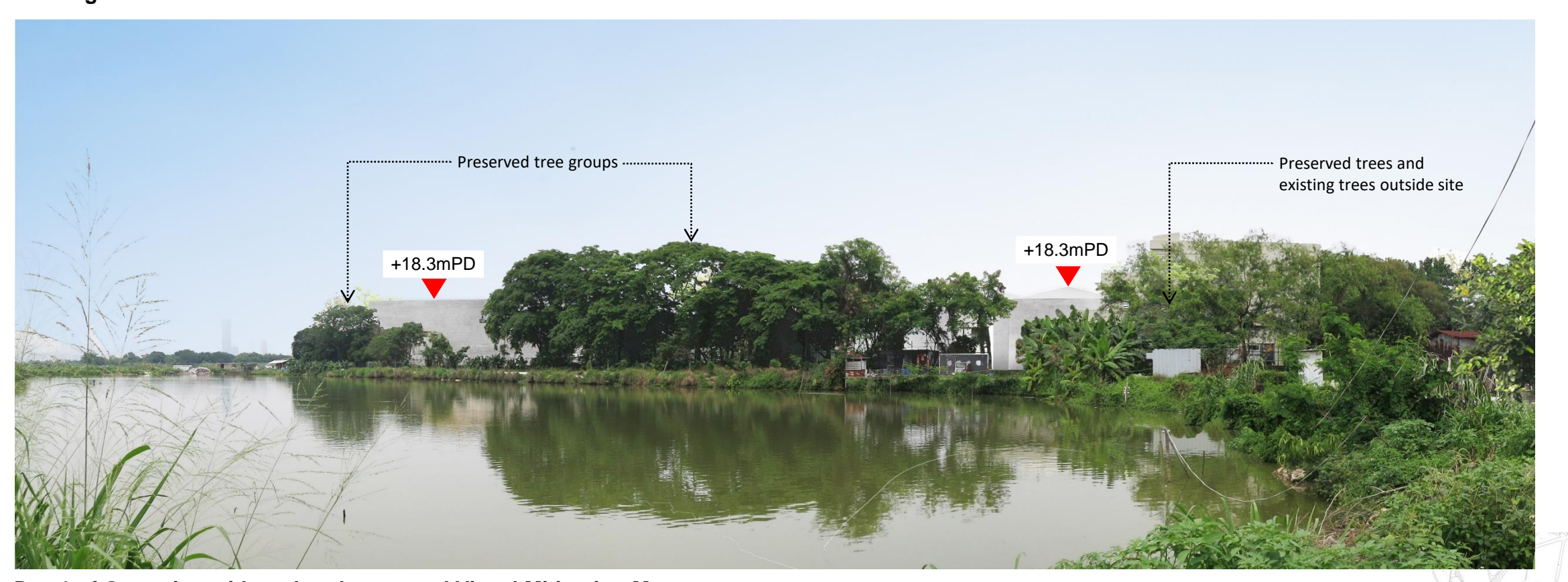
Day 1 of Operation without Landscape and Visual Mitigation Measure