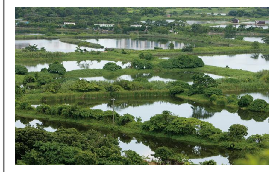
LCA-04 Tai Sang Wai Mangrove