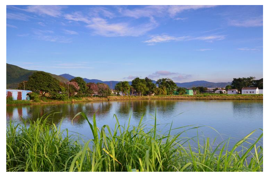
LCA-05 Fung Lok Wai Wetland