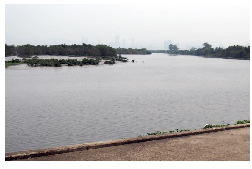
LCA-02 Shan Pui River Inshore Water