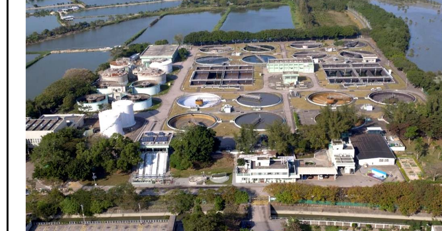
LCA-01 Existing Yuen Long Sewage Treatment Works