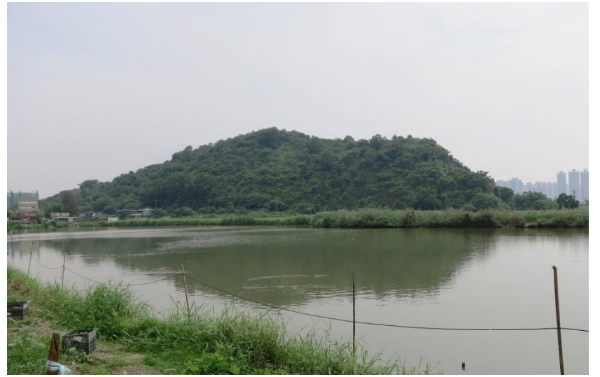
LCA-06 Secondary Woodland