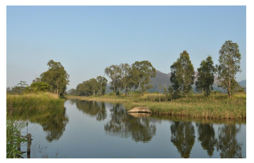
LCA-03 Nam Sang Wai Wetland