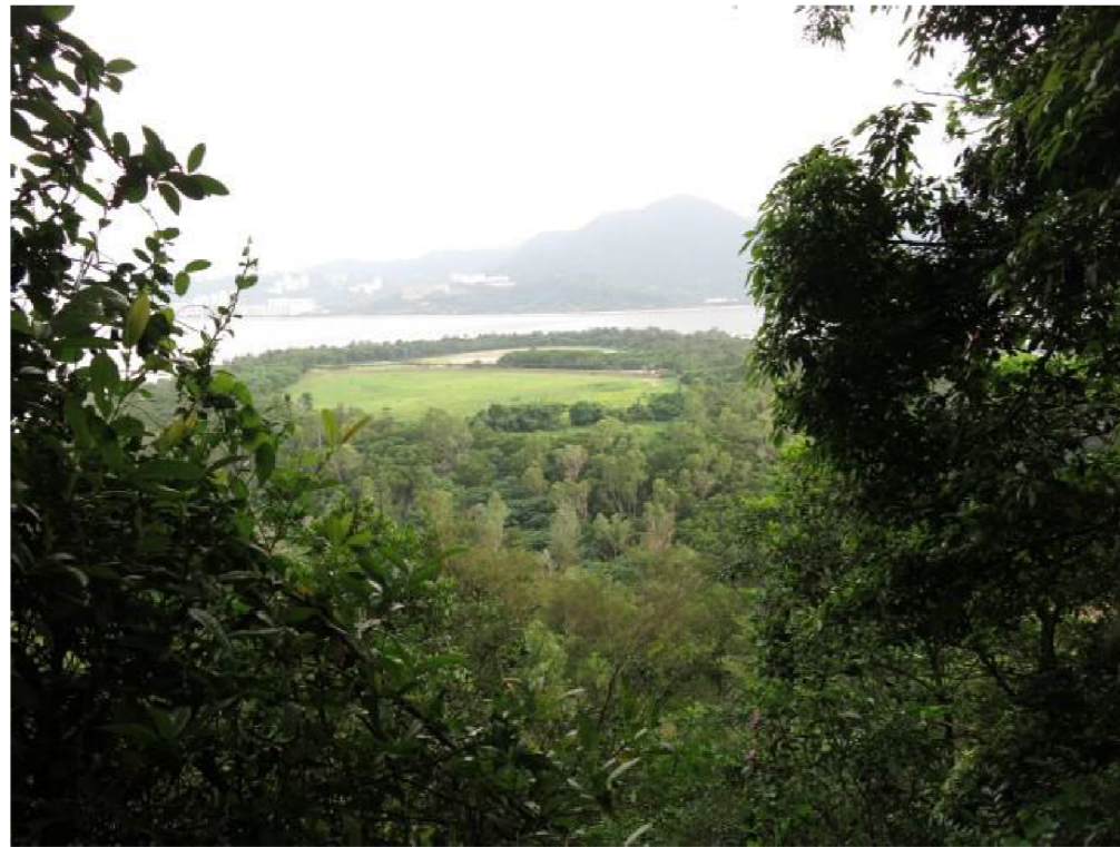
View from Hillside Vantage Point 1