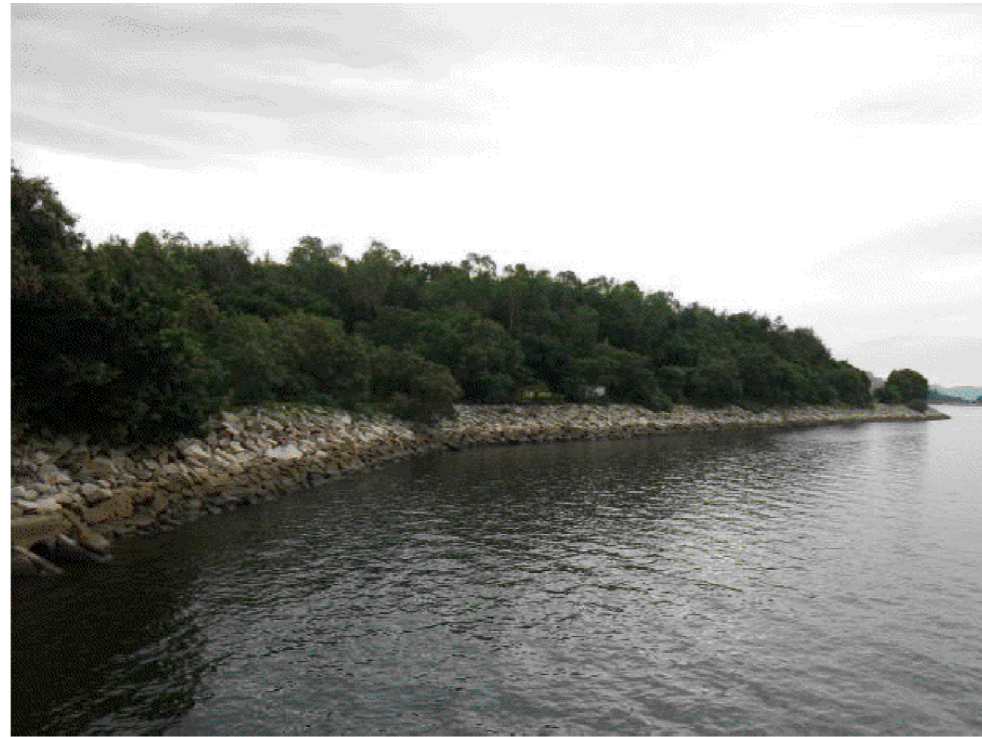
View from Tai Po Waterfront Park Pier Observation Point