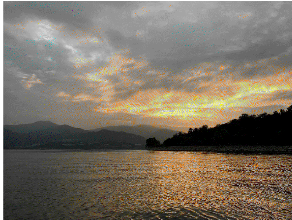
View from Vessel Fixed Observation Point