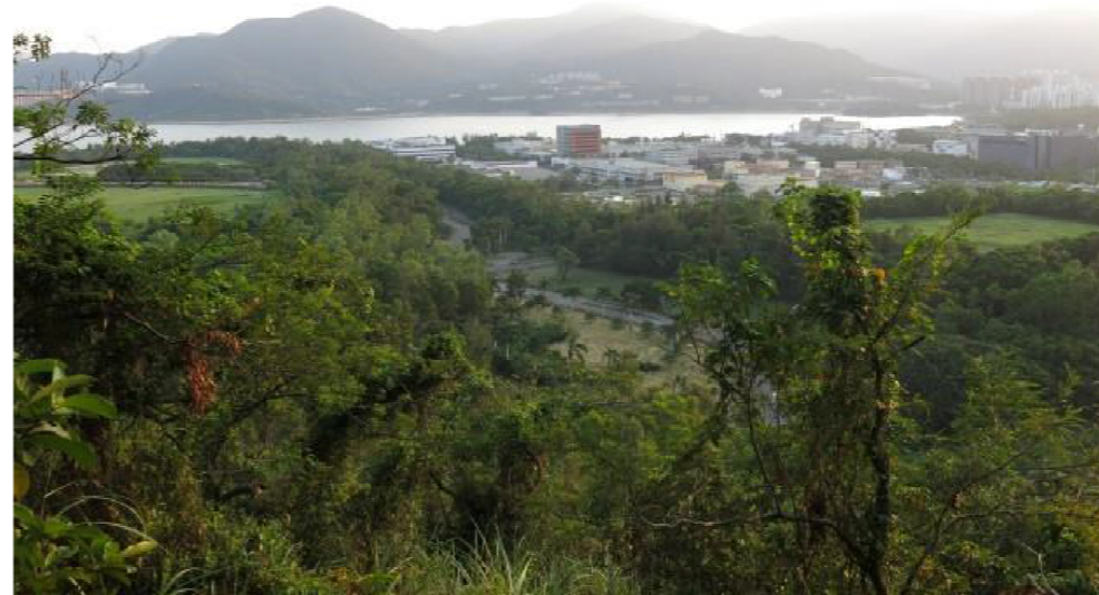
View from Hillside Vantage Point 2