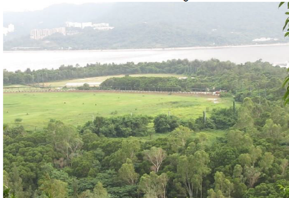
View from Hillside Vantage Point 1 - Close-up