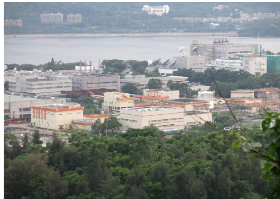
View from Hillside Vantage Point 2 - Close-up