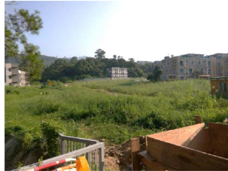
Cultivated Land (Abandoned)