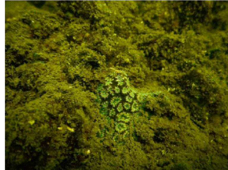
Oulastrea crispata (at Rocky Shore)