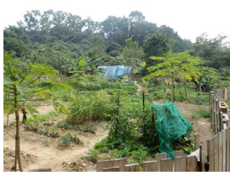
Cultivated Land (Active)