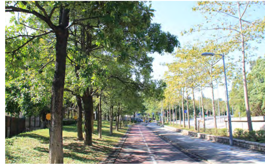
LR9.1 Ting Kok Road Roadside Amenity Planting