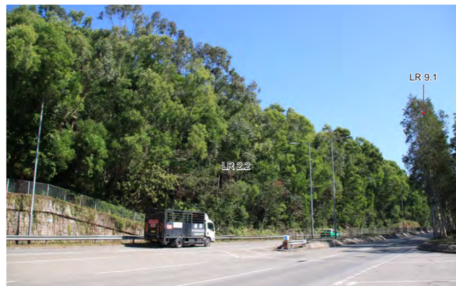
LR2.2 Ting Kok Road North Mixed Woodland