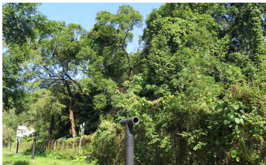
LR2.1 Ting Kok Road South Mixed Woodland