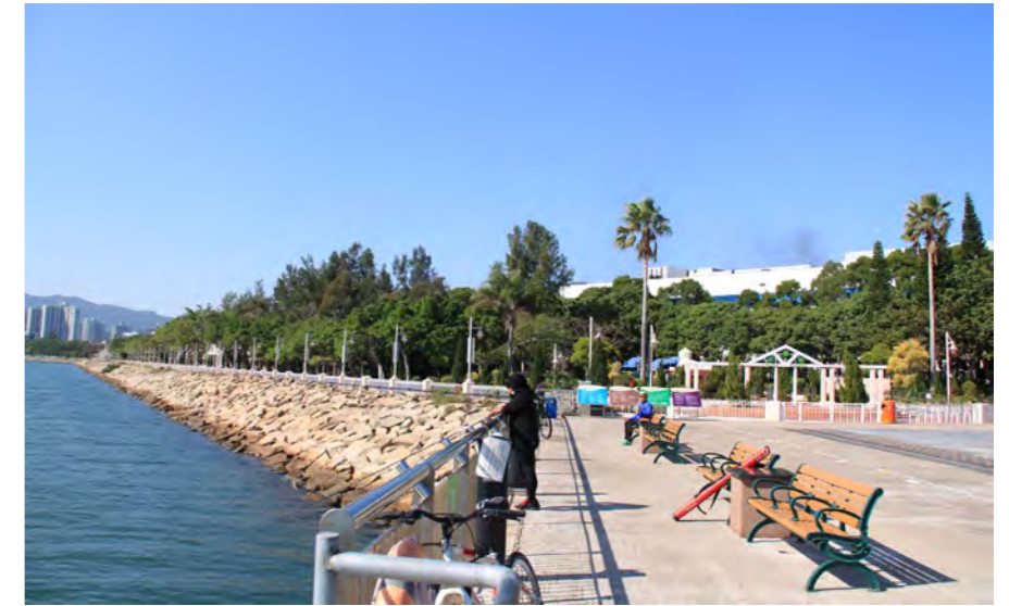
LR8 Tai Po Waterfront Park