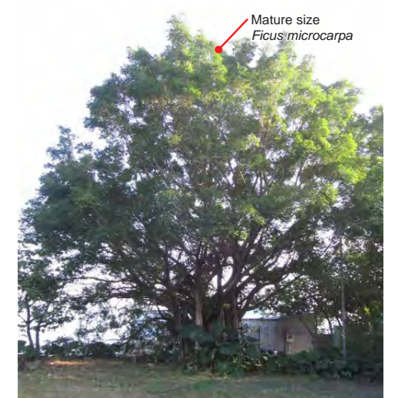
LR10.2 Golf Park Golf Driving Range on Ex-landfill Site (outside Project Site)