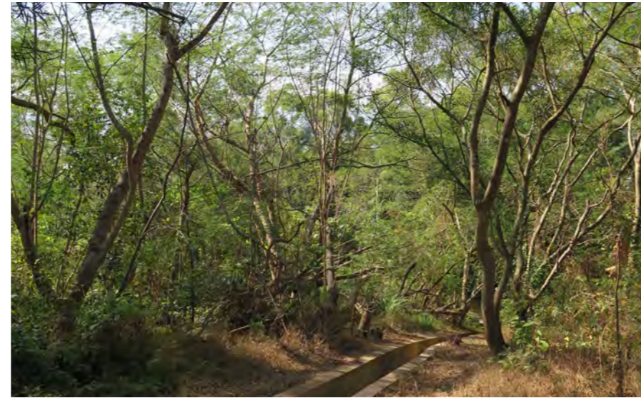
LR1.1 Ex-Landfill Site Plantation (within Project Site)