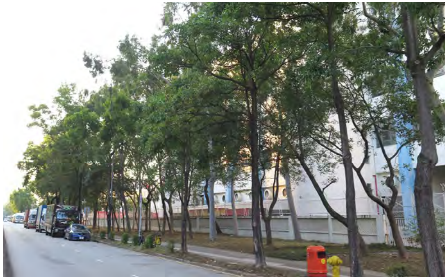
LR9.2 Tai Po Industrial Estate Roadside Amenity Planting