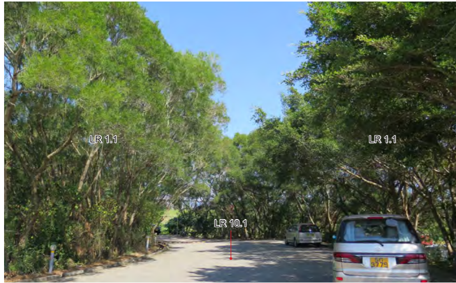
LR1.1 Ex-Landfill Site Plantation (within Project Site)