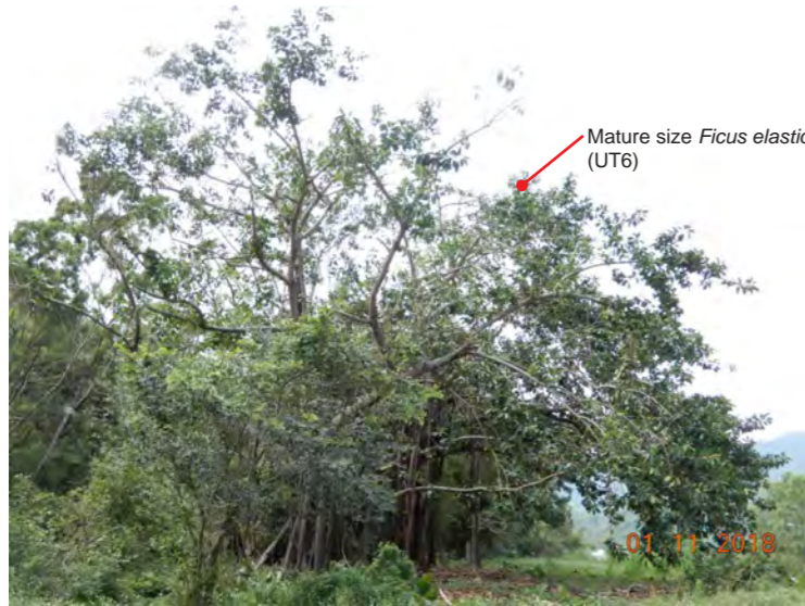
LR1.1 Ex-Landfill Site Plantation (within Project Site)