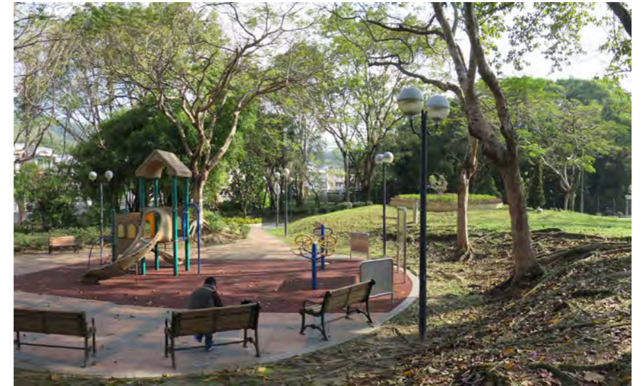
LR11 Amenity Area - Ha Hang Village Sitting-out Area