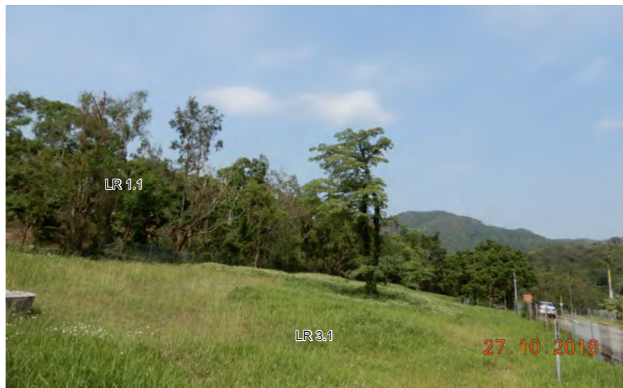
LR3.1 Managed Grassland on Ex-landfill Site (within Project Site)