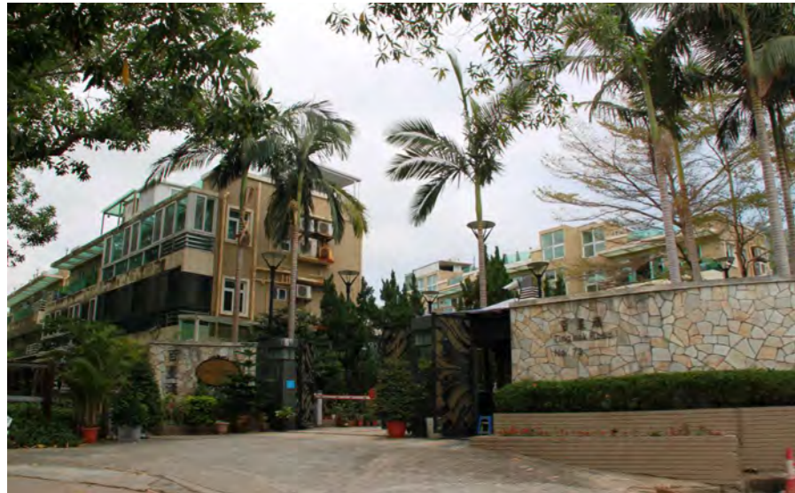
LR10.6 Ha Hang Low-rise Residential Developed Area