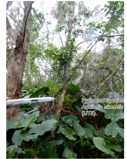
LR1.1 Ex-Landfill Site Plantation (within Project Site)