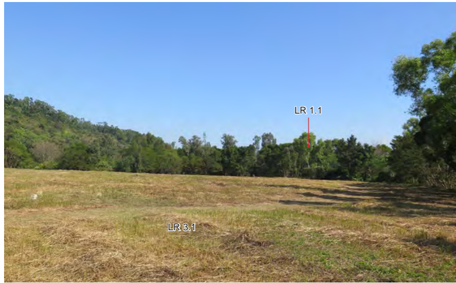
LR3.1 Managed Grassland on Ex-landfill Site (within Project Site)