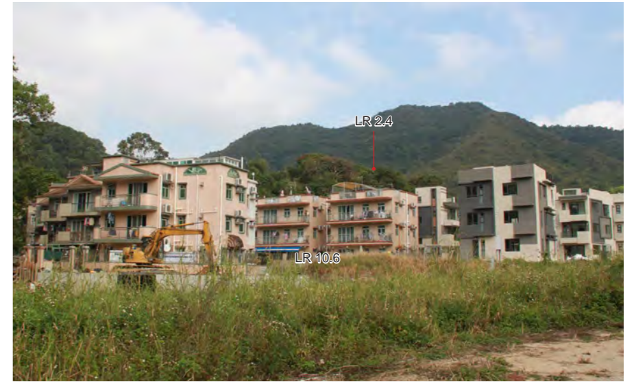
LR10.6 Ha Hang Low-rise Residential Developed Area