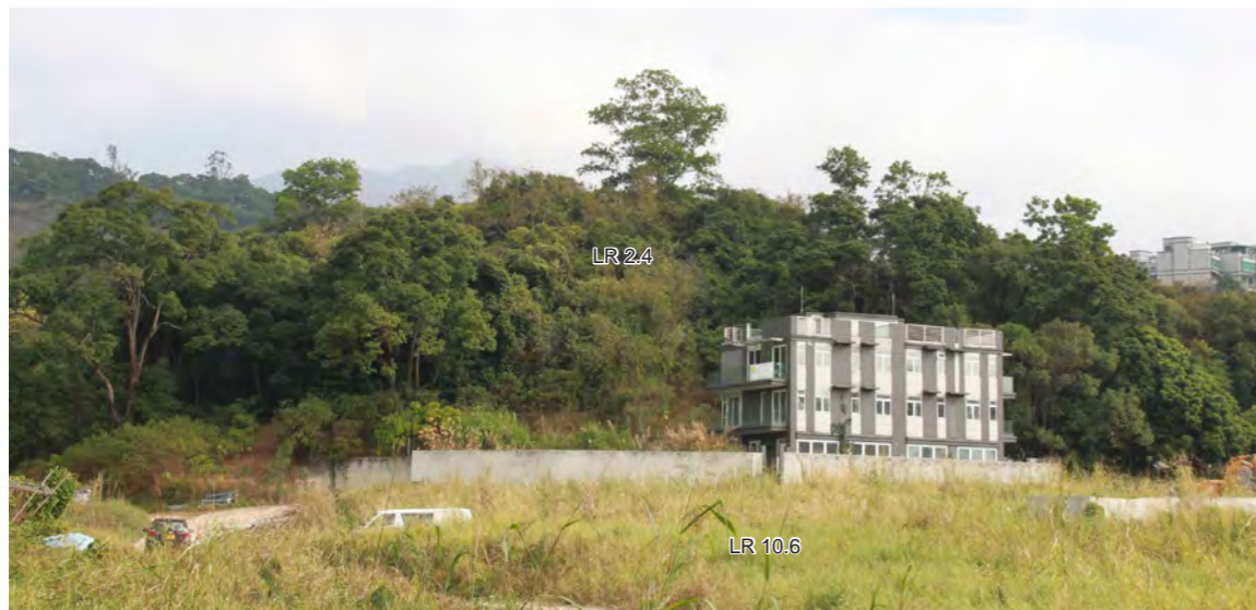
LR2.4 Ha Hang Mixed Woodland