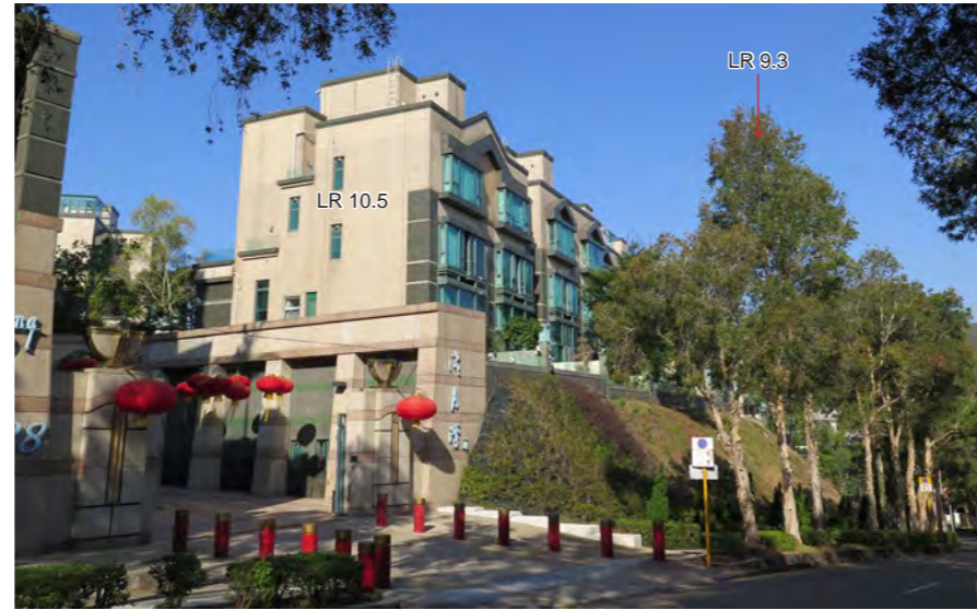
LR10.5 Lo Fai Road Low-rise Residential Developed Area