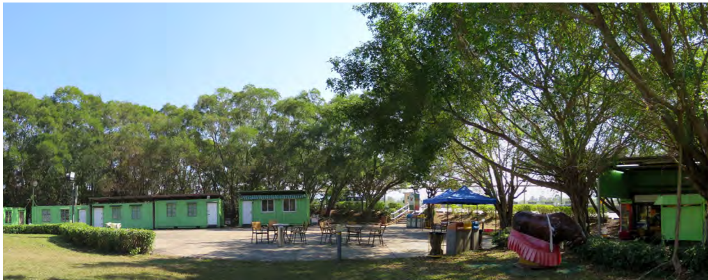
LR10.1 Golf Park Golf Driving Range on Ex-landfill Site (within Project Site)