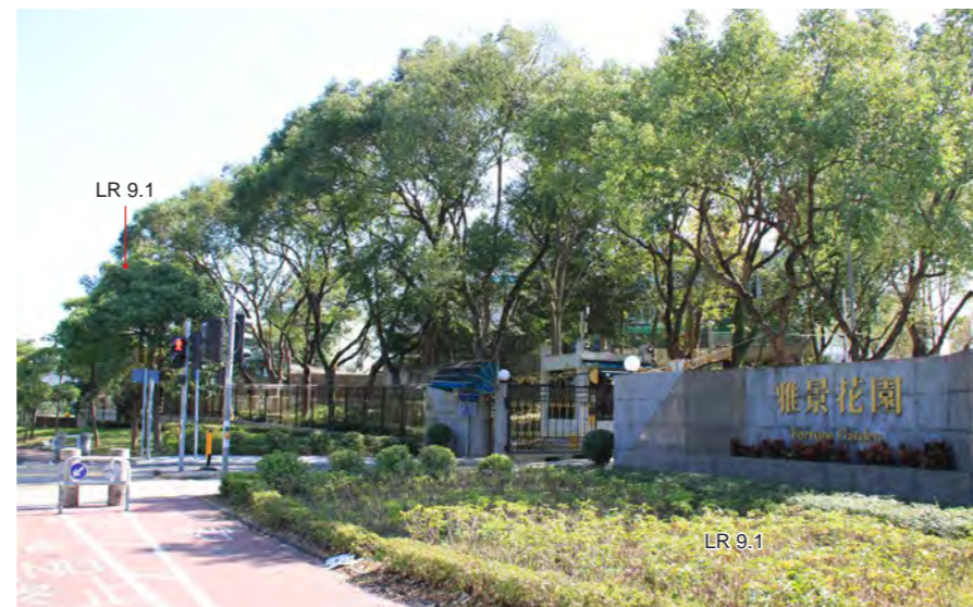
LR10.4 Ting Kok Road South Low-rise Residential Developed Area