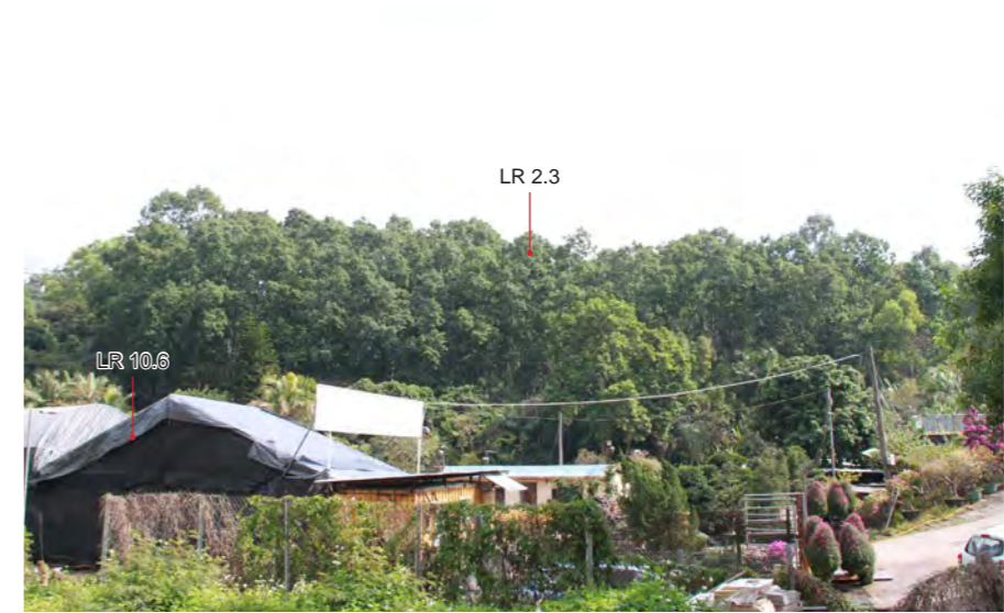
LR2.3 Lo Fai Road West Mixed Woodland