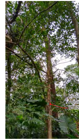
LR1.1 Ex-Landfill Site Plantation (within Project Site)