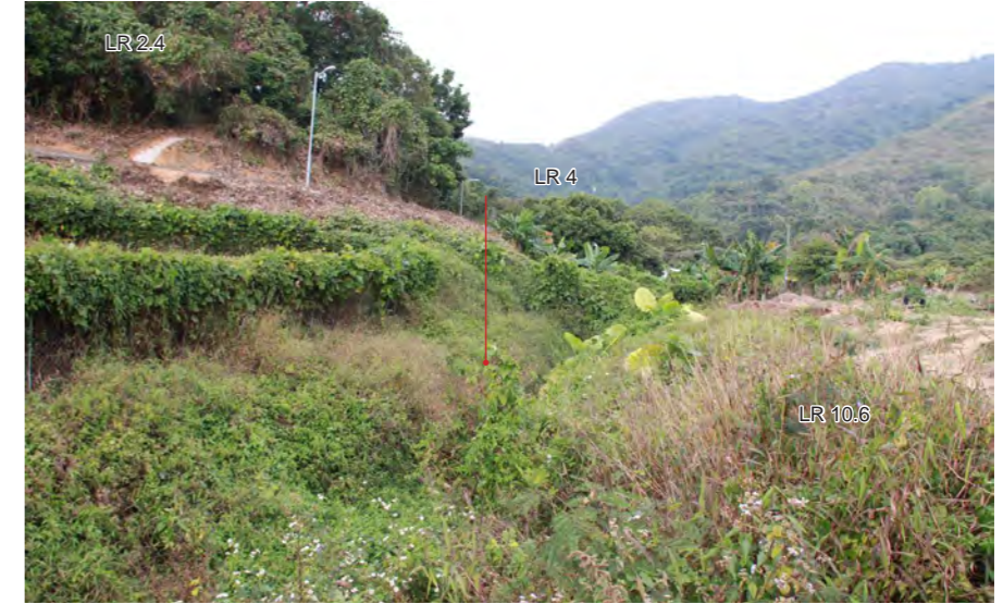
LR4 Ha Hang Watercourse