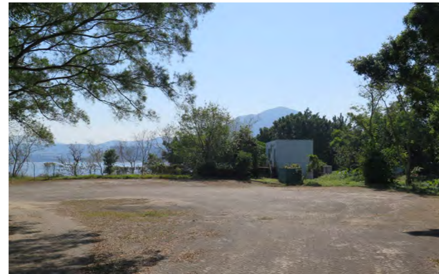
LR10.2 Golf Park Golf Driving Range on Ex-landfill Site (outside Project Site)