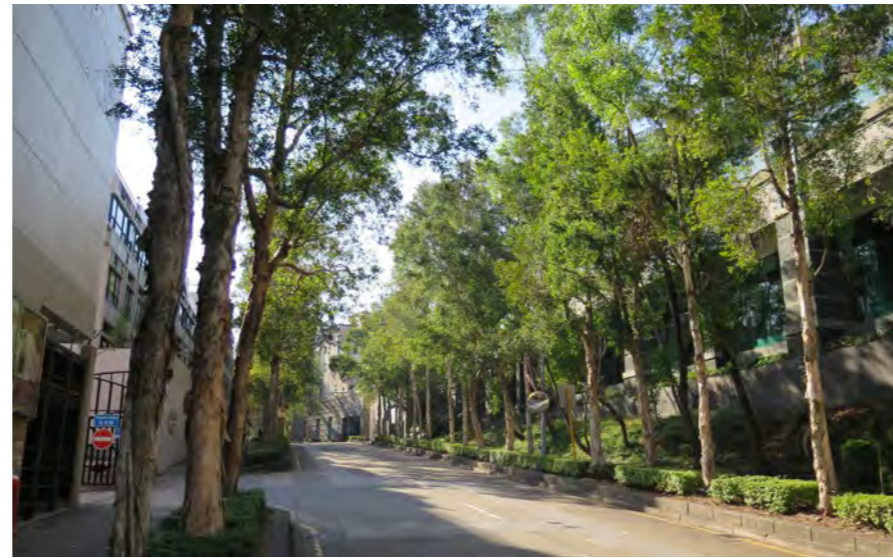
LR9.3 Lo Fai Road Roadside Amenity Planting