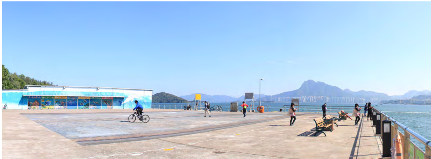
LR8 Tai Po Waterfront Park