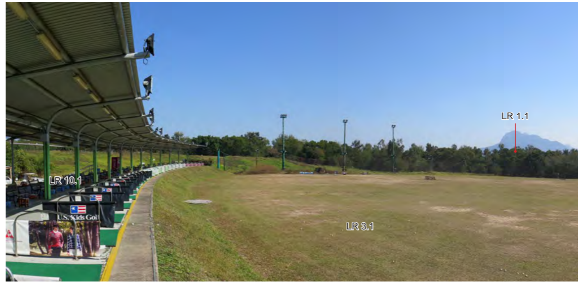
LR3.1 Managed Grassland on Ex-landfill Site (within Project Site)