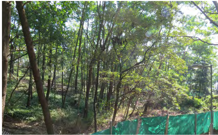
LR2.2 Ting Kok Road North Mixed Woodland