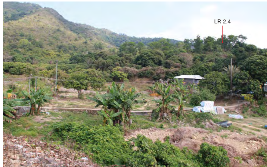
LR5 Ha Hang Agricultural Field