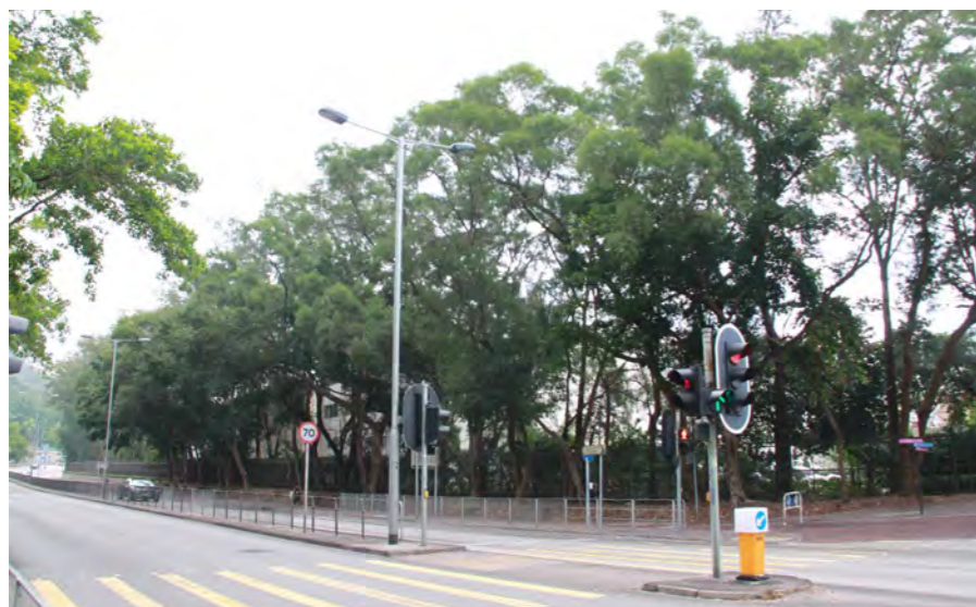
LR9.1 Ting Kok Road Roadside Amenity Planting