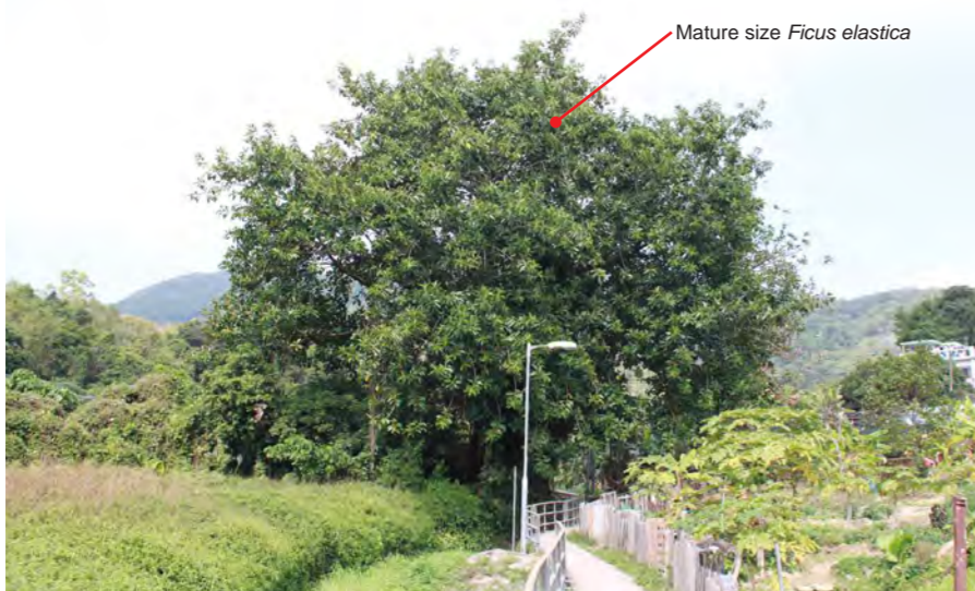
LR5 Ha Hang Agricultural Field