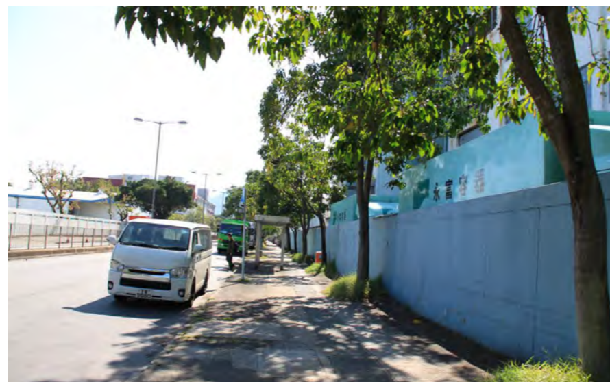
LR9.2 Tai Po Industrial Estate Roadside Amenity Planting