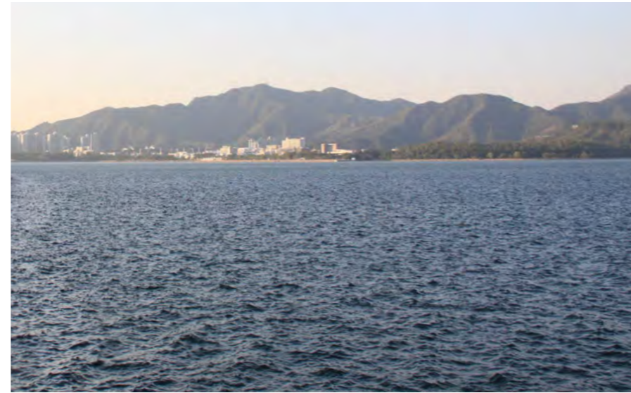
LR7 Water Body - Tolo Harbour