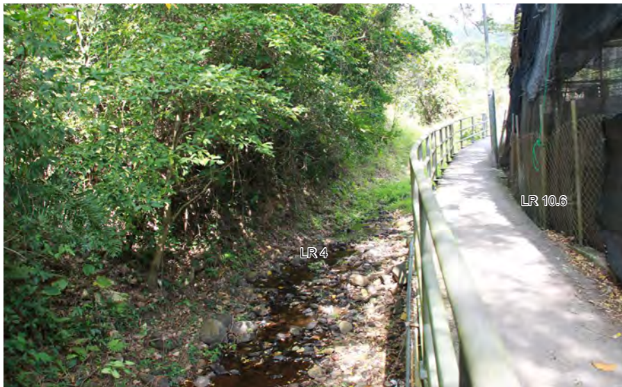
LR4 Ha Hang Watercourse