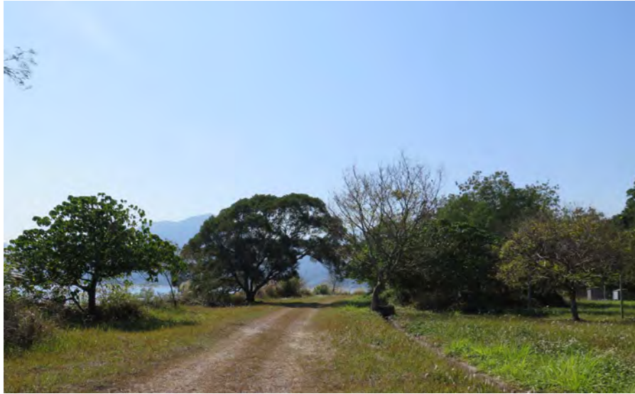
LR3.2 Managed Grassland on Ex-landfill Site (within Project Site)