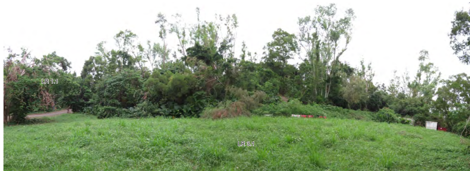
LR3.1 Managed Grassland on Ex-landfill Site (within Project Site)