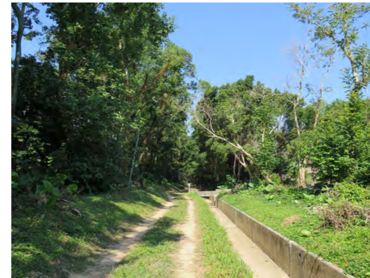
LR1.2 Ex-Landfill Site Plantation (outside Project Site)