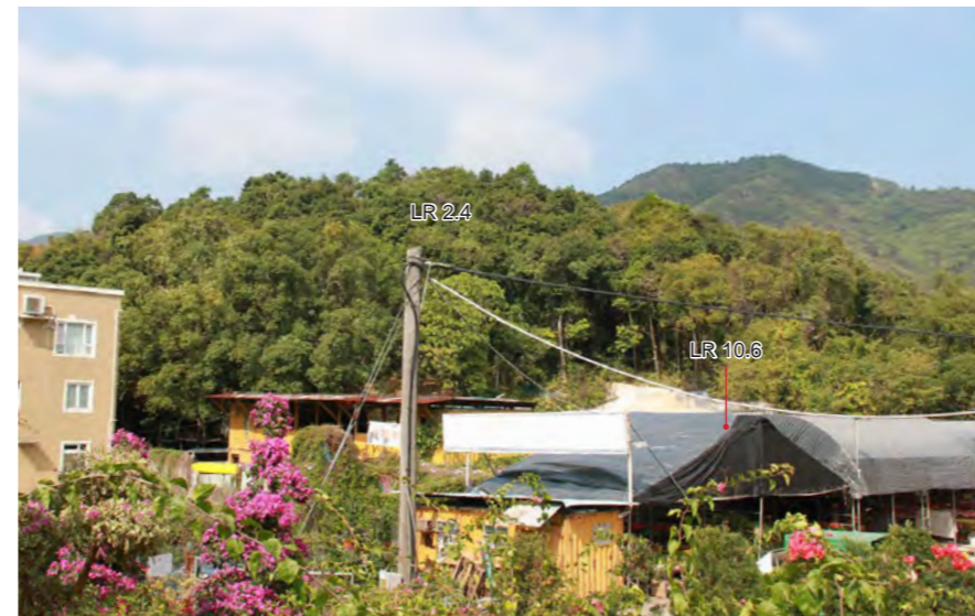
LR2.4 Ha Hang Mixed Woodland