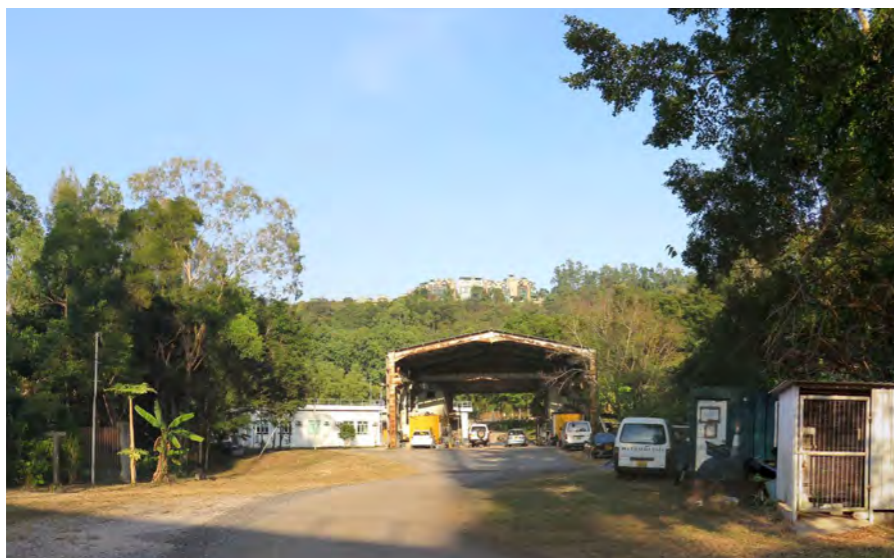
LR10.3 Offices on Ex-landfill Site