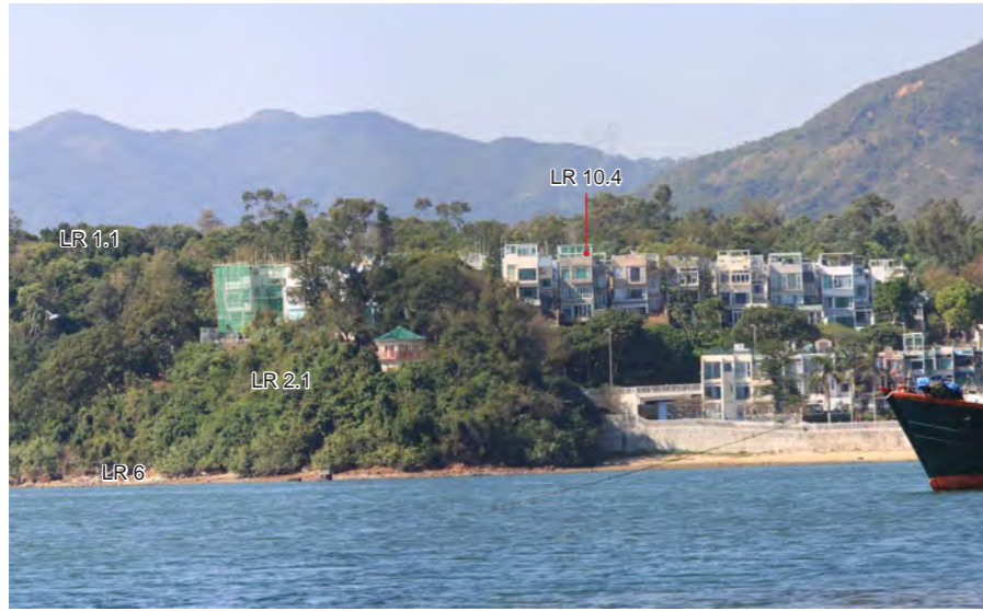
LR10.4 Ting Kok Road South Low-rise Residential Developed Area