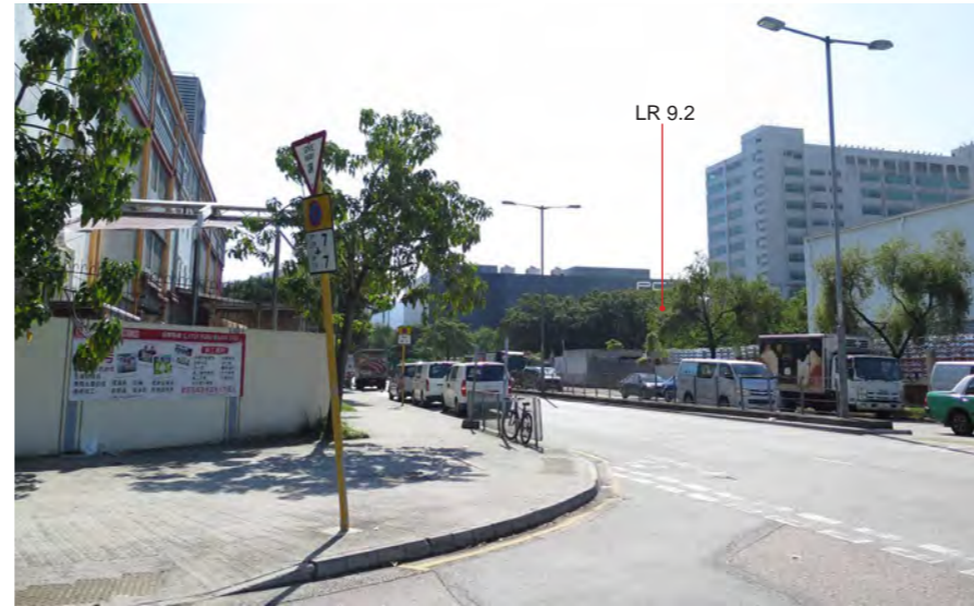
LR10.7 Tai Po Industrial Estate Developed Area