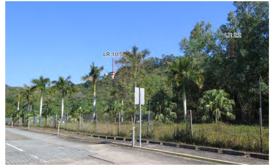
LR10.1 Golf Park Golf Driving Range on Ex-landfill Site (within Project Site)