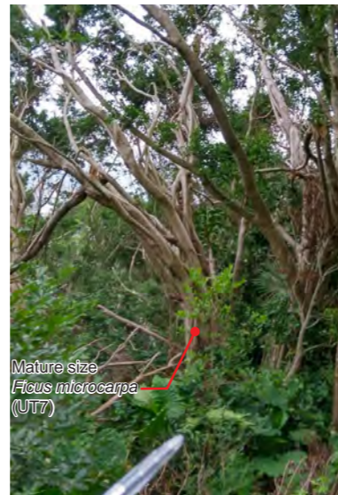
LR1.1 Ex-Landfill Site Plantation (within Project Site)