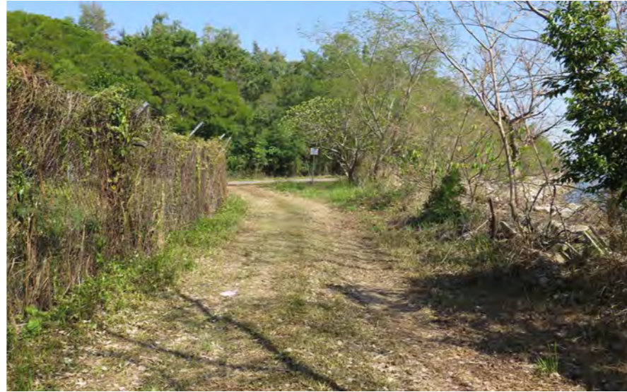
LR3.3 Managed Grassland on Ex-landfill Site (outside Project Site)