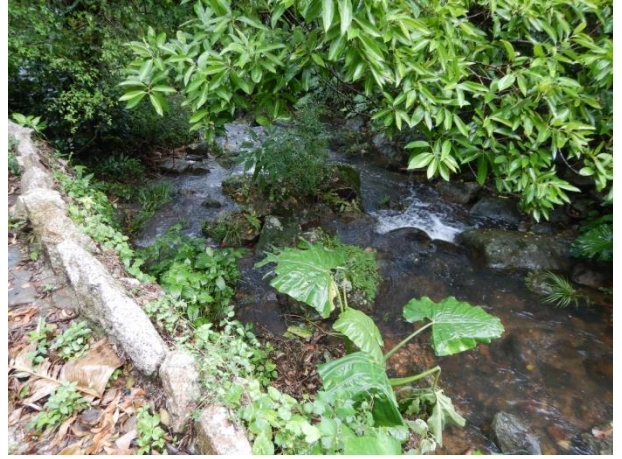
Watercourse (natural section)