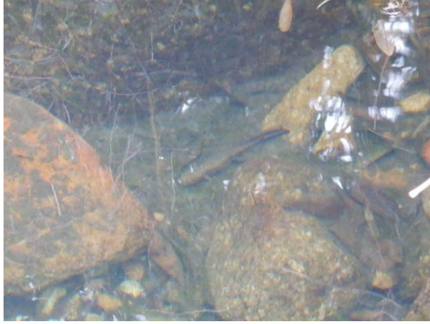
Hong Kong Newt