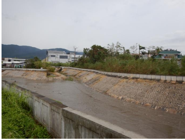
Watercourse (channelized section)