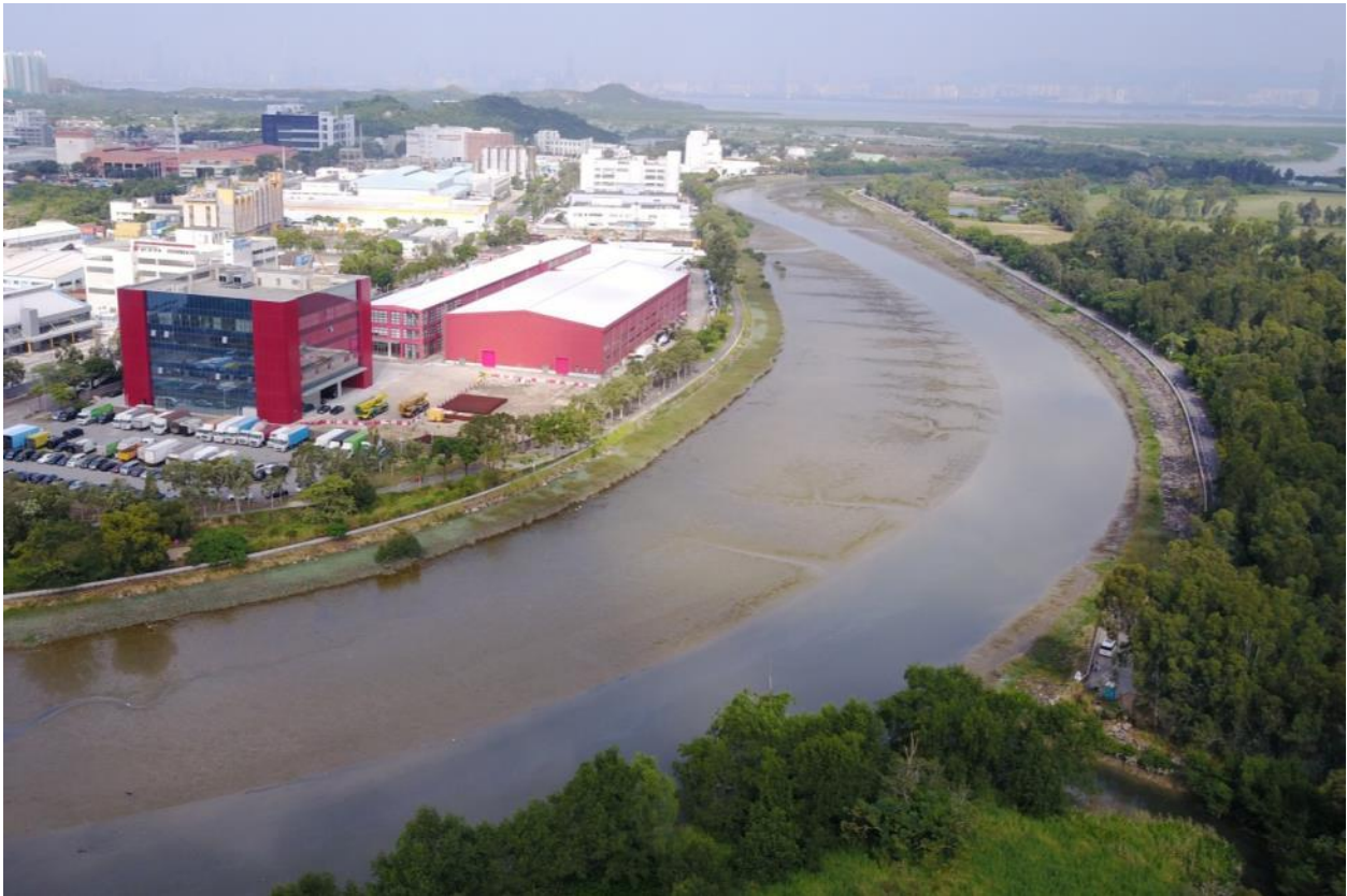
Shan Pui River