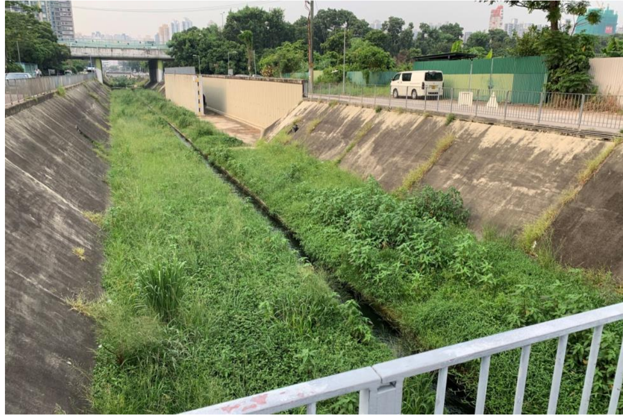
Yuen Long Town Nullah (Section 1)