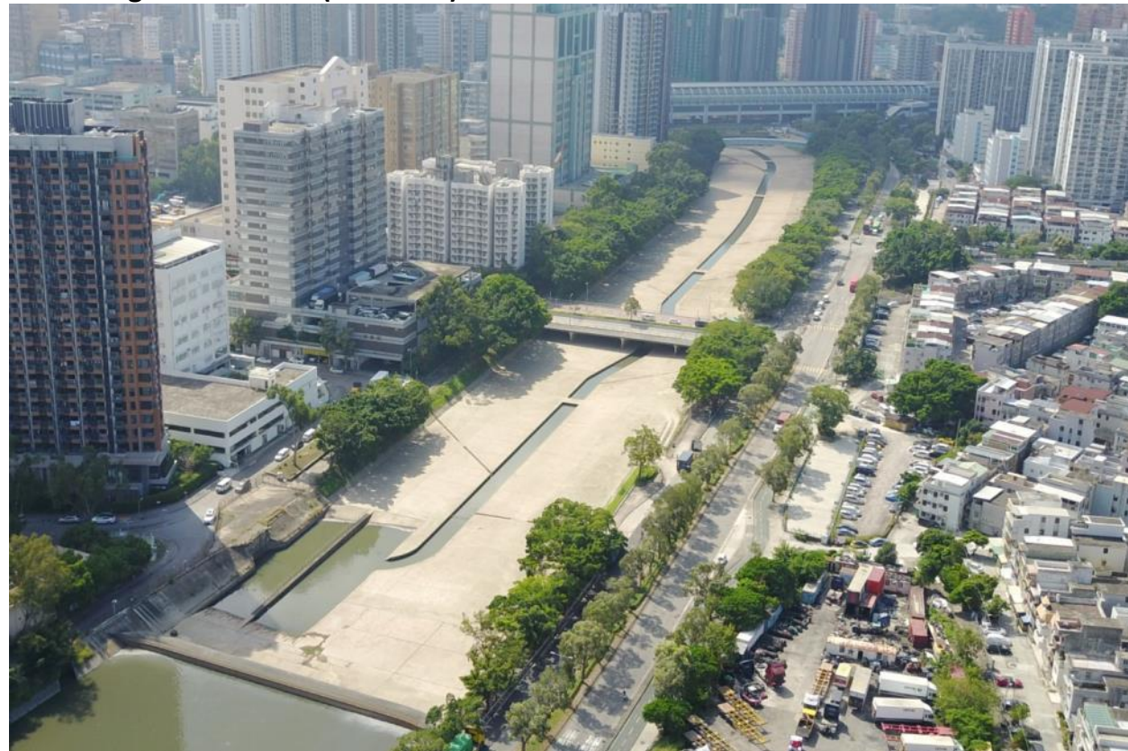
Yuen Long Town Nullah (Section 3)