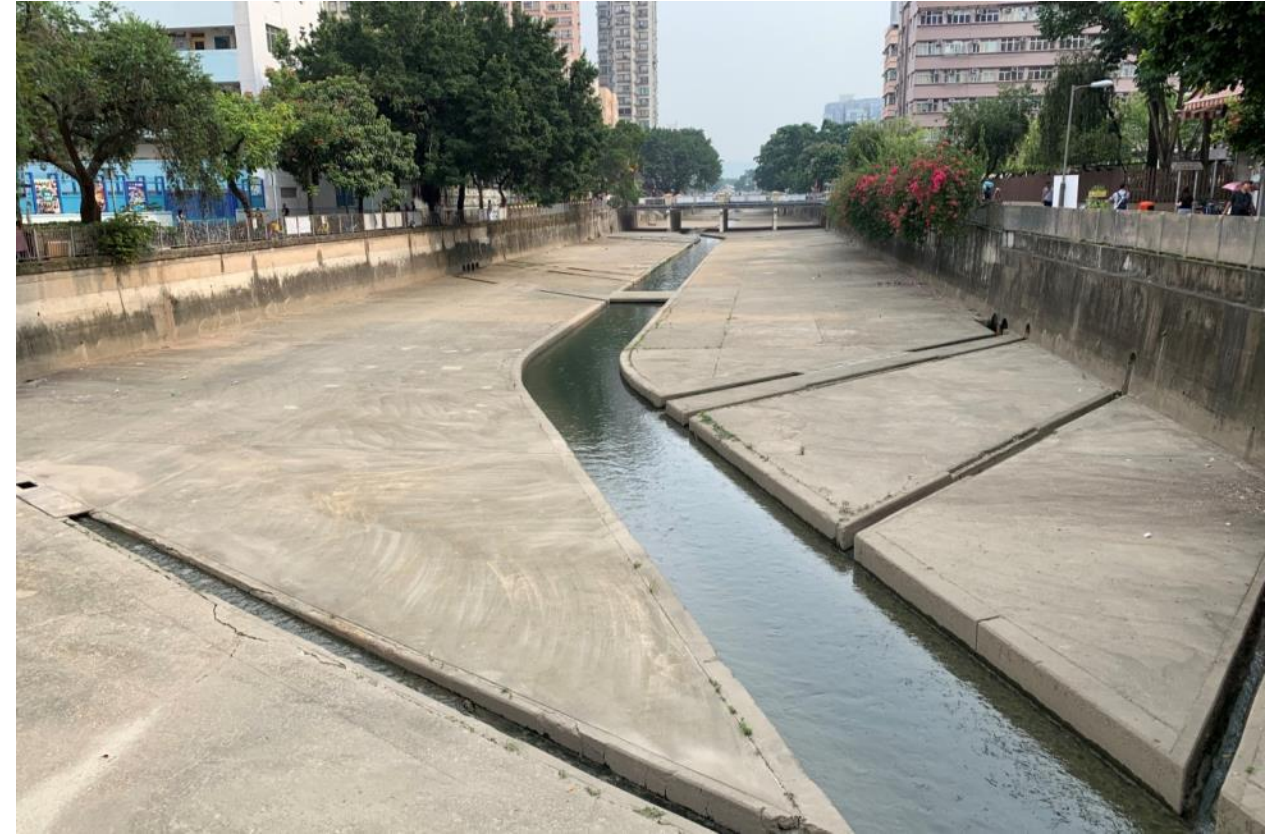
Yuen Long Town Nullah (Section 2)