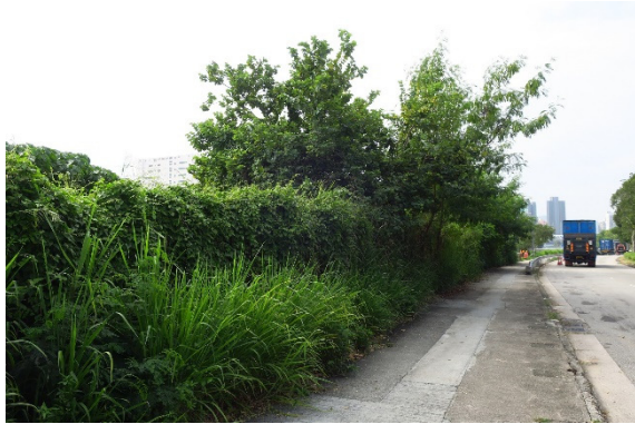
Tree Group W1