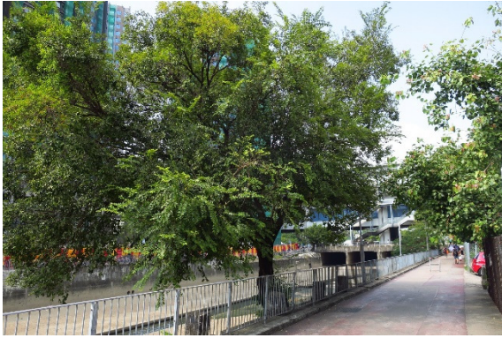
Tree Group W8