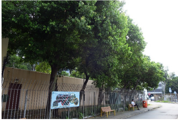
Tree Group W6