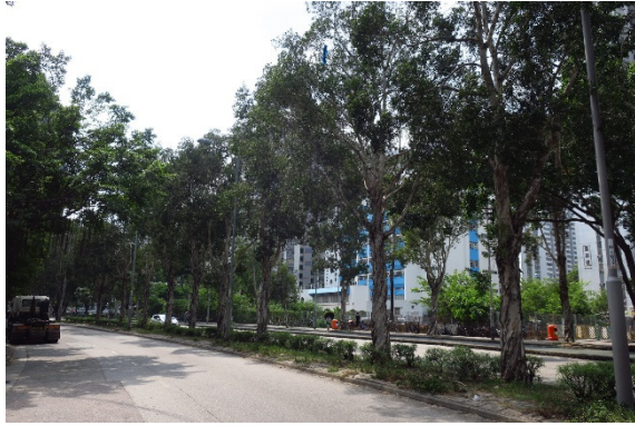
Tree Group W4