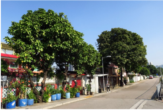
Tree Group W10