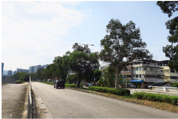
Tree Group W3