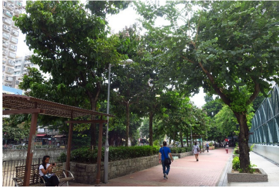
Tree Group W7