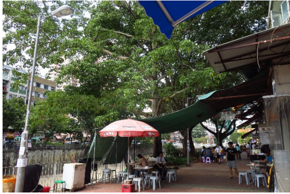
Tree Group W9