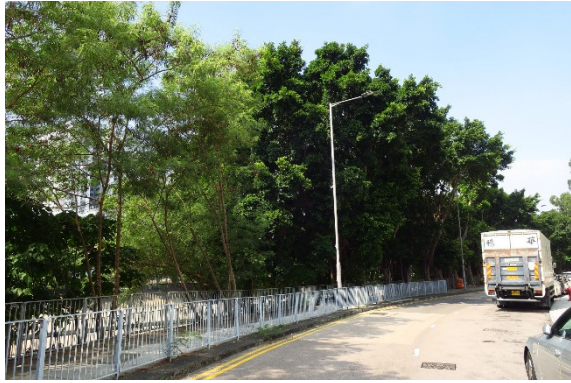
Tree Group W5