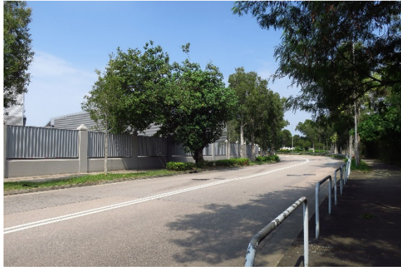
Tree Group W2