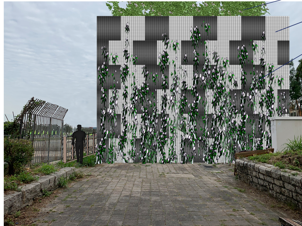
YEAR 10 OPERATION WITH LANDSCAPE AND VISUAL MITIGATION MEASURES