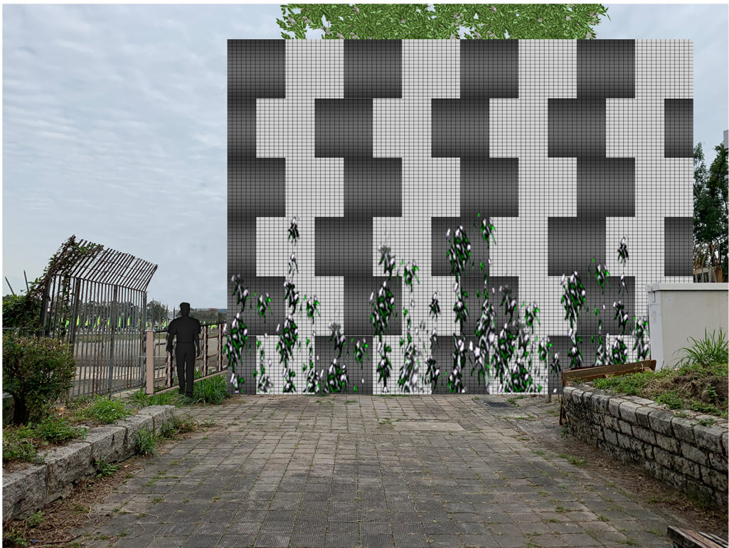
DAY 1 OPERATION WITH LANDSCAPE AND VISUAL MITIGATION MEASURES