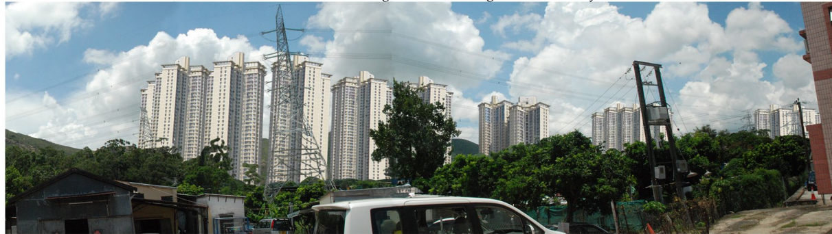
VSR6 Photomontage – With Mitigation at Day 1