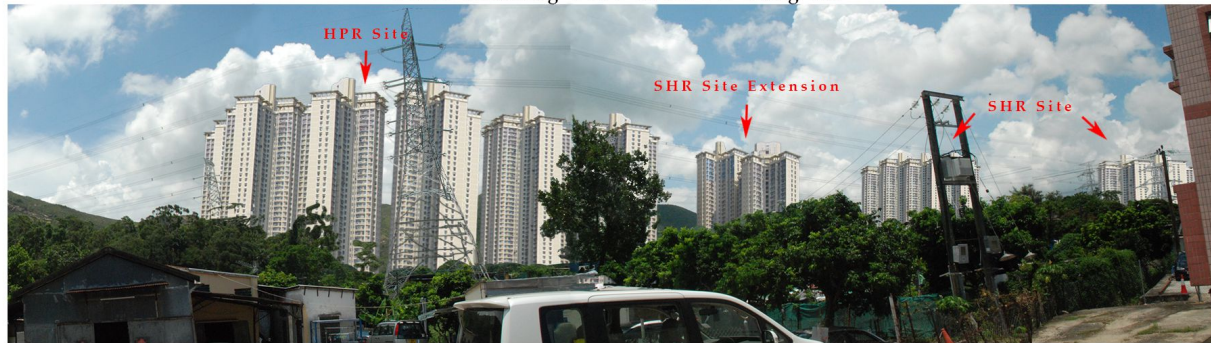
VSR6 Photomontage – No Mitigation at Day 1