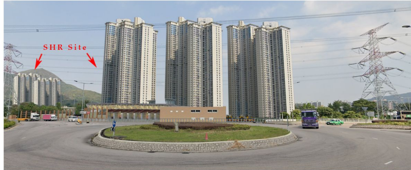
VSR14 Photomontage - No Mitigation at Day 1