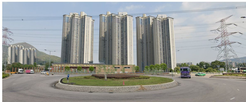
VSR14 Photomontage - With Mitigation in Year 10