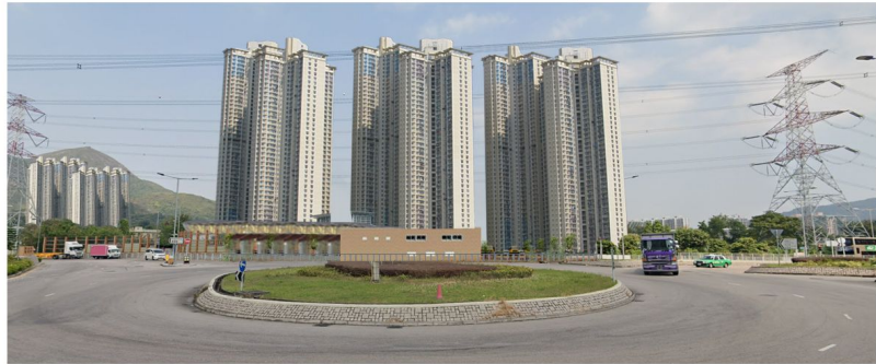
VSR14 Photomontage - With Mitigation at Day 1